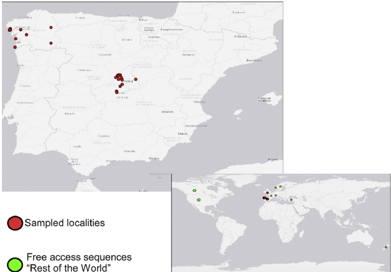
Fig. 1. Localities sampled. More detailed maps are shown in Fig. 3.