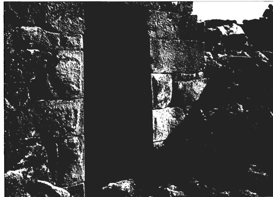
Photograph 3. Doorway in monastic complex at Umm es-Surab, Jordan, fifteen kilometres south of Bostra, possibly on the route Abu Talib's caravan might have taken. Though the location of Bahira's cell is not known, a room such as this would fit the conditions of the monk's residence much better than the Basilica in Bostra.

This Muhammad-Bahīrā topos will serve us to imagine not merely the caravan traffic between Mecca and Bostra/Damascus, but the movement and identity of peoples between the Arabian Peninsula and Syria, and the related settlement of some of them in towns and villages on the desert fringe, especially the Southern Hauran. As Muhammad's visit