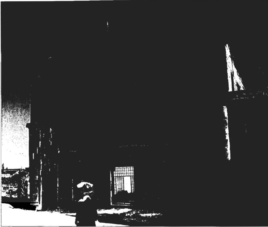
Photograph 2. "Basilica of Bahira," Bostra. The structure was originally a Roman building. The filling of the arch was part of its conversion to a Christian basilica, and the filling of the windows represent its further reuse likely in the Mamluk period. Association with Bahira is part of local tour guide lore, but has no basis in historical evidence.

authentication story, symbolic of universality of Muhammad's apostleship and of the intimate role of Christianity in incipient Islam. In Syrian Christianity, on the other hand, the tale was embellished to portray Bahīrā as the human originator of Muhammad's message (Griffith).