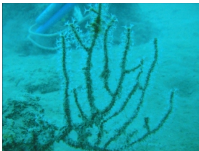
Muricella paraplectana (Grasshoff, 1999)