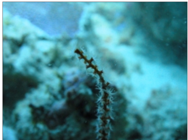
Ellisella marisrubri (Stiasny, 1938)