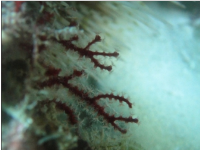
Acabaria cinquemiglia (Grasshoff, 1999)