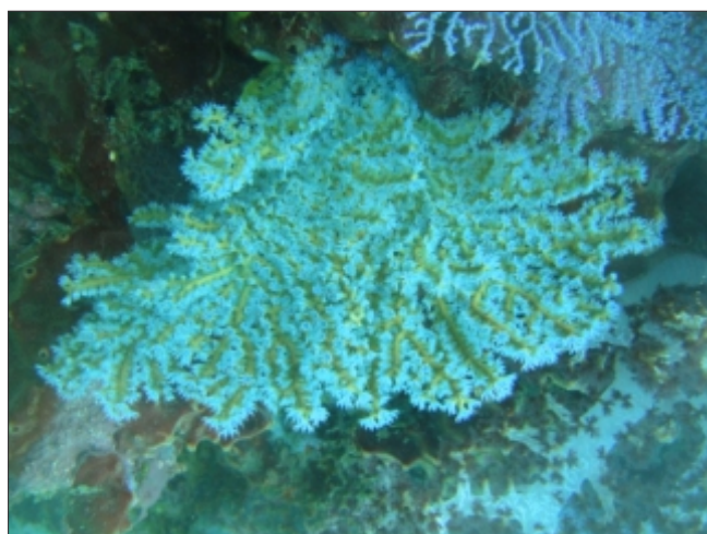
Anthogorgia ochracea (Grasshoff, 1999)