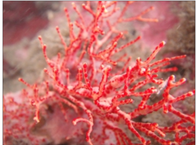
Acabaria ouvea (Grasshoff, 1999)