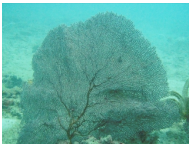
Verrucella corona (Grasshoff, 1999)