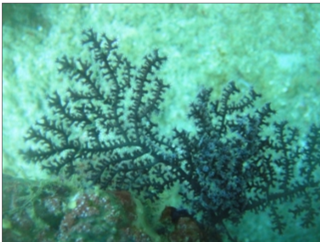
Bebryce sirene (Grasshoff, 1999)