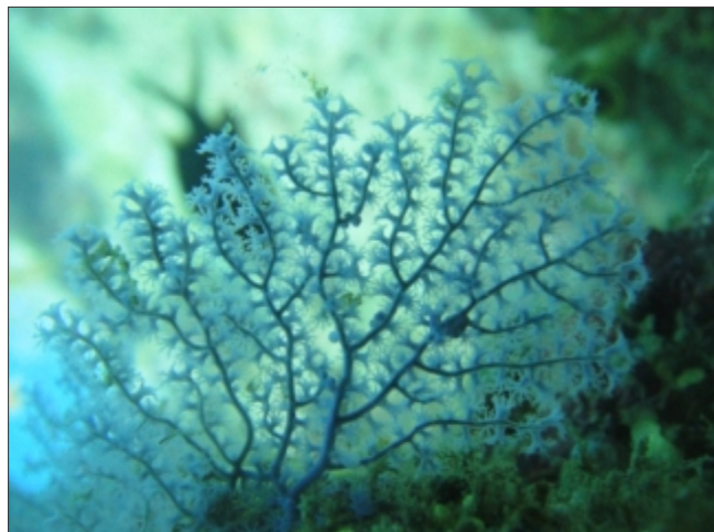
Acanthogorgia breviflora Whitelegge, 1897