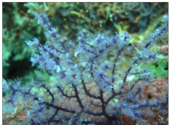
Trimuricea caledonica (Grasshoff, 1999)