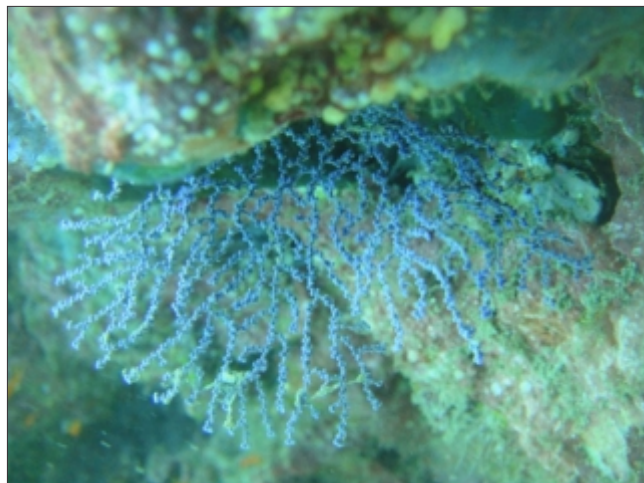
Acanthogorgia spinosa Hiles, 1899