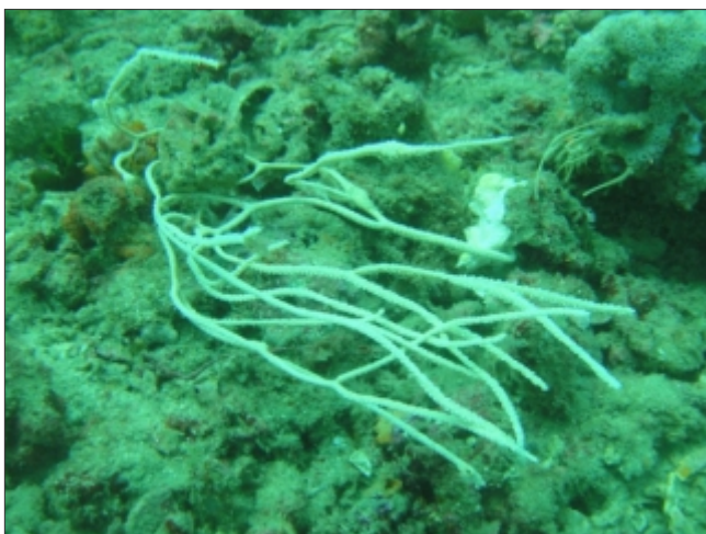
Junceella delicata (Grasshoff, 1999)