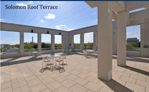
Solomon Roof Terrace