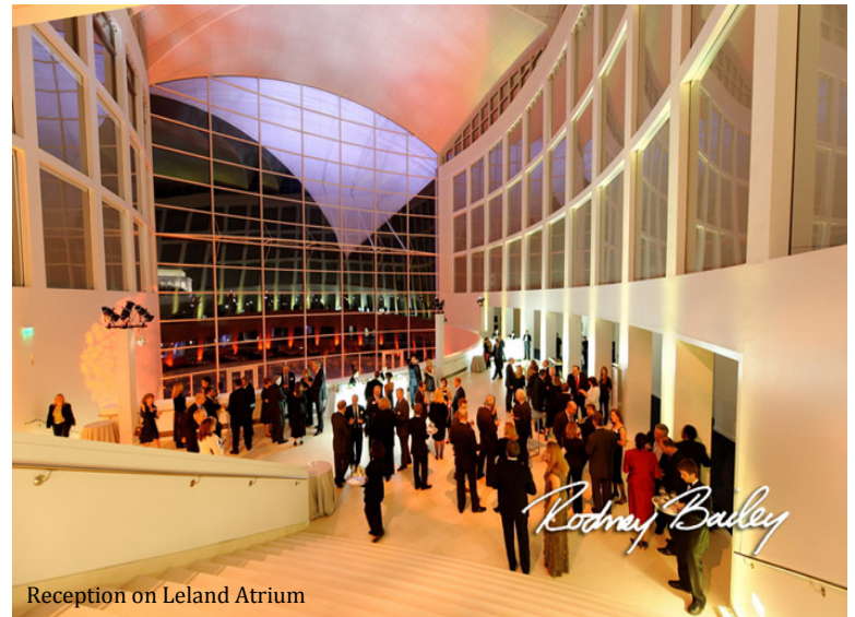
Reception on Leland Atrium

The event sponsor is responsible for inviting all external vendors to the meeting. The event sponsor's event timeline, vendor list, USIP Vendor Guidelines, and USIP Facility Management process (i.e., loading dock, security, cleaning, parking, etc.) will be reviewed during this meeting. 72 hours prior to the event, the sponsor must submit a copy of the CME Vehicle / Freight Access Form and include a complete list of event staff for event day building access. All event walkthroughs are scheduled by the CME Office during weekday business hours and by appointment only.