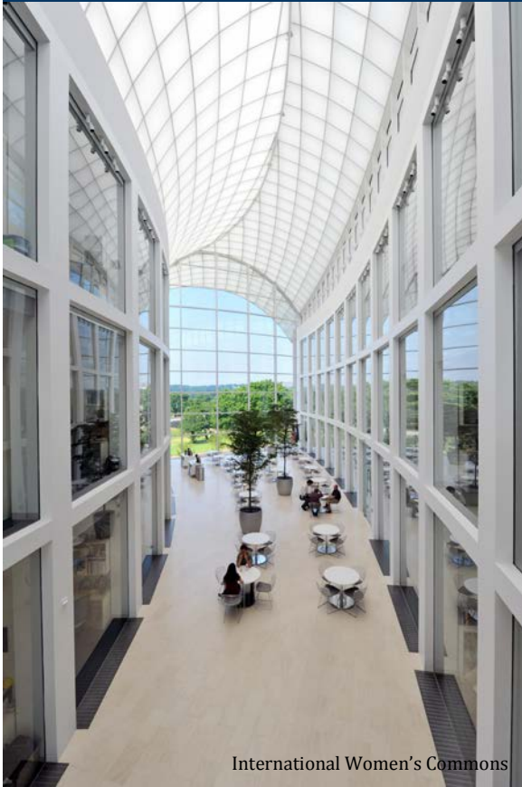
International Women's Commons