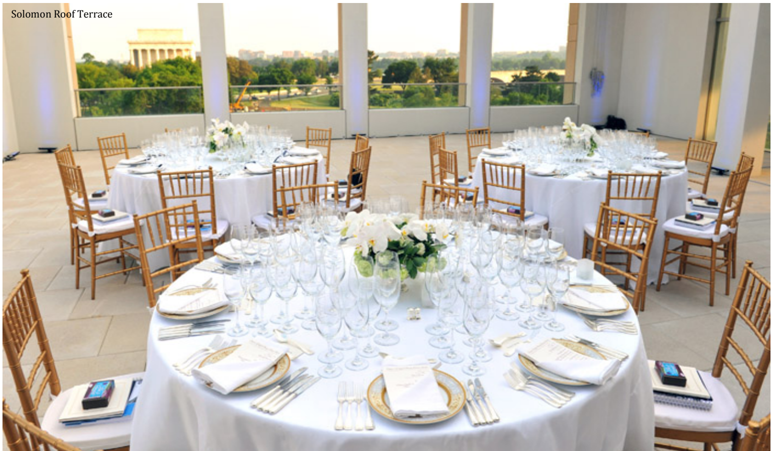
Solomon Roof Terrace