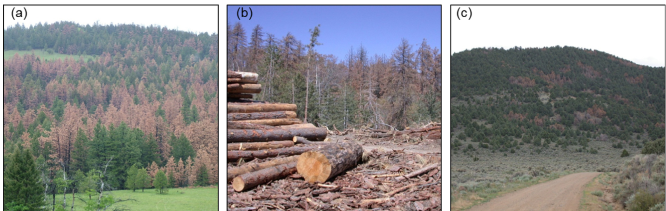
Fig. 1. Examples of extensive tree mortality in the western U.S. caused by bark beetles during severe drought in the early 2000s. (a) Pine forests of the Intermountain West due to mountain pine beetle ( Dendroctonus ponderosae ) (photo B. Bentz, USDA Forest Service). (b) Pine forests of southern California due to western pine beetle ( Dendroctonus brevicomis ) (photo: C. Fettig, USDA Forest Service). (c) Pinyon pine forests (e.g., Pinus monophylla ) of the southwestern U.S. due to pinyon ips ( Ips confusus ) (photo: C. Fettig, USDA Forest Service).