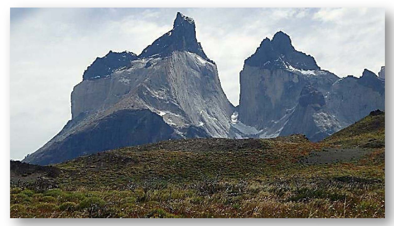
Serrano Glacier, Bernardo O'Higgins National Park.

Horns of Torres del Paine Parque Nacional.