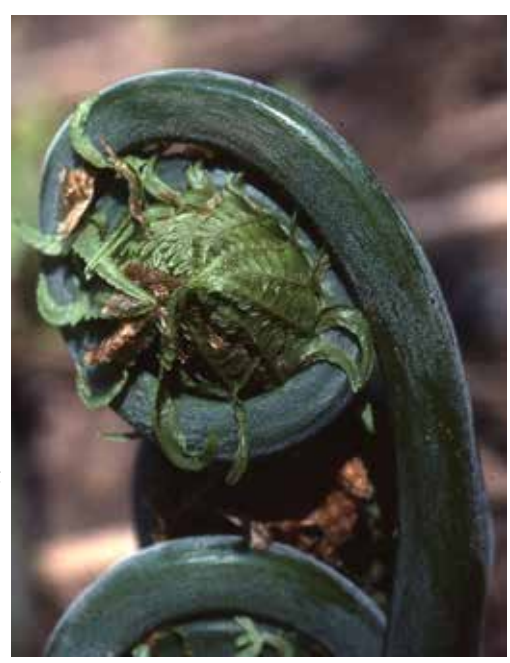
Fiddleheads ( Matteuccia ) were a food not commonly eaten by First Nations (who used other parts of the plant for materials), but were valued by European immigrants.

Many world-class food products originated in the Americas: maize, potatoes, beans, peppers, tomatoes, pineapples, papayas, chocolate and vanilla, to name just a few. Most of these were introduced to Europe fairly early on by explorers like Christopher Columbus, and all of these examples were crops that were domesticated originally from Central and South America. However, North American Indigenous peoples have relied for millennia on diverse and nutritious plant foods from their own and neighbouring territories. Among these, only a handful, most notably sunflower ( Helianthus annuus L. ), have spread worldwide as domesticated crops. Many others, including wild-growing and locally cultivated species, have been consumed and enjoyed more locally, not only by First Peoples, but by newcomer populations during the trade and colonial eras, and right up to the present day as people everywhere have reclaimed their interest in local, sustainable food systems. This paper focuses on plant foods of North American First Peoples that were adopted by Europeans and other immigrants, in some cases out of necessity, but often because of convenience and appreciation of their quality, taste and nutritive values. To provide a deeper understanding of the types of situations in which these foods were adopted, five key species are highlighted, with details of their procurement, acceptance and adaptation by the newcomers, including their use up to the present time.