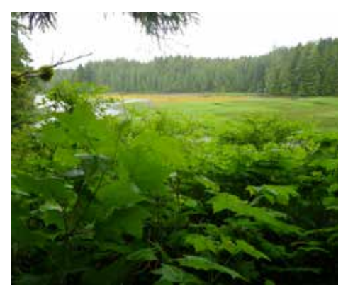
View of Hauyat village site.