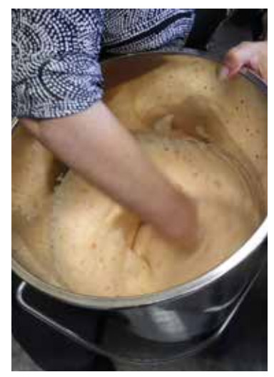
Nisga'a elder demonstrates how to whip soapberries in the Nass Valley as part of Ethnobotany course.

Conservation of biological and cultural diversity tends to occur in parallel, each with its own programs. At best, this model is ineffective because biological and cultural diversity are strongly linked. What are some of the alternative conservation pathways embracing a biocultural approach? How can such an approach be adopted; what policy mechanisms be used, and what are some of the challenges? Using biocultural conservation examples from Canada, Aotearoa New Zealand and Mexico to explore these questions based on ongoing participatory projects with indigenous groups, the authors show that conservation planning is beginning (a) to deal with multifunctional and/or cultural landscapes; (b) to accommodate multiple objectives of the local people (political, cultural, environmental) and their livelihoods; and (c) to address multi-level governance needs. Conservation