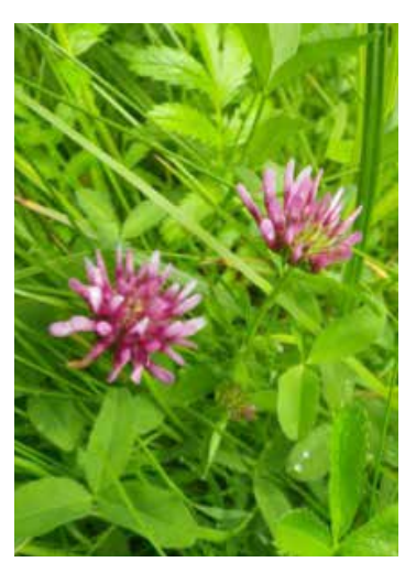
t'xwsús Springbank clover ( Trifolium wormskioldii ) on Hunter Island, Central Coast, BC

Both Elsie and Vi were concerned that much of what they knew, and had learned about plants through their lifetimes, would be lost to their children and grandchildren, and to all WSÁNEĆ children, when they passed away. Plants have always been important to the WSÁNEĆ people: trees, shrubs and other kinds of plants, including seaweeds, are major sources of food, materials, and medicines for humans, and provide the backdrop and environmental texture for all cultural