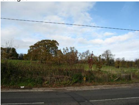
View from the A48 to the north west.

Overall the character of the village, where the plots face the main road, is of detached or terraced properties set back slightly from the road, the depth of the front gardens having been reduced by the road widening in 1930. Substantial stone walls and groups of mature trees are also important features, the heavy planting now seen in oblique views along the road having been encouraged by house owners to provide a visual barrier from the road. To the eastern and western edges of the village, the density of building reduces to the odd property until the road is totally bordered by fields.