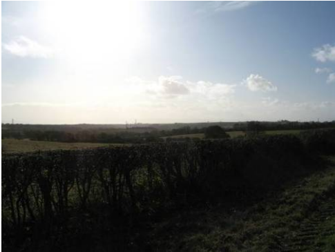
View southwards close to Sheepcourt Cottages.