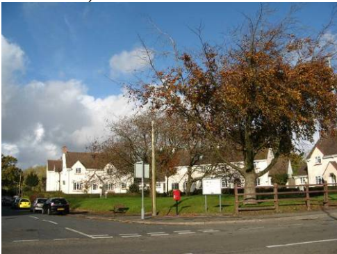
Well detailed Post-war housing off Maes-y-Ffynnon.