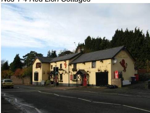
The Red Lion

A C19 farm house with attractive stone farm buildings within adjoining farm complex.