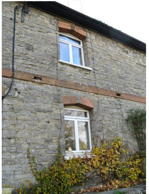
The use of local lias limestone as a building material is prevalent, occasionally with red brick dressing.