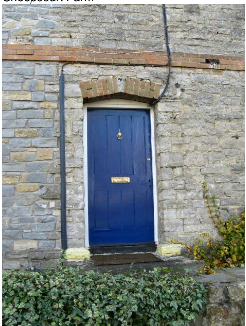
Details of the front door on Sheep Court Cottages