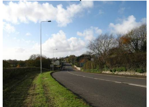
The A48 drops in level from the east.