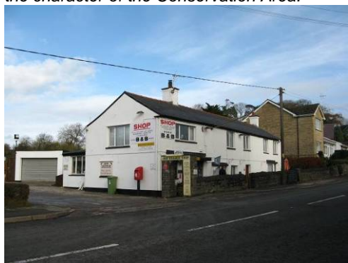
Cluttered signage to the Village Shop.