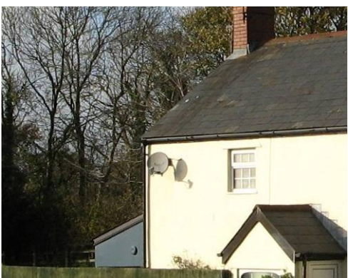
Highly visible satellite dishes can detract from the character of the Conservation Area.