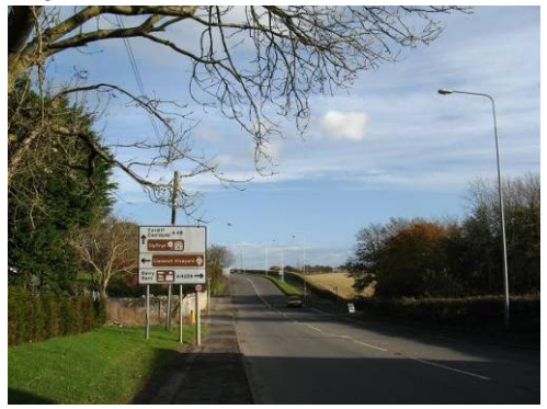
Entrance from the east.