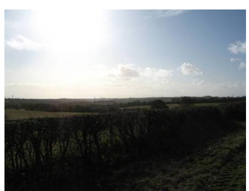
View southwards close to Sheepcourt Cottages.