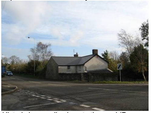
Historic houses lie close to the road (Pen-yr-Heol House).