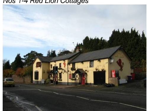
The Red Lion