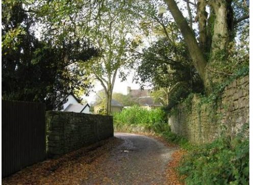
A quiet lane leads to Plas y Coed off the A48.