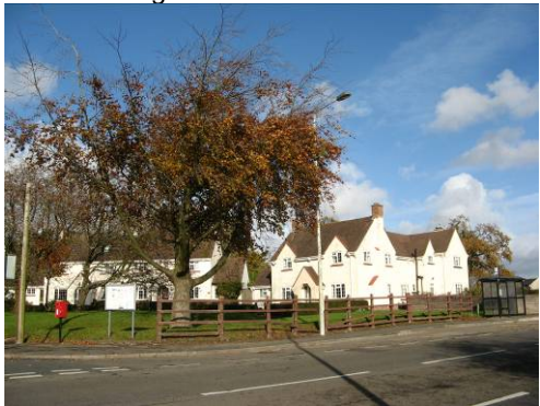
Former Rural District Council housing surrounds an attractive green.