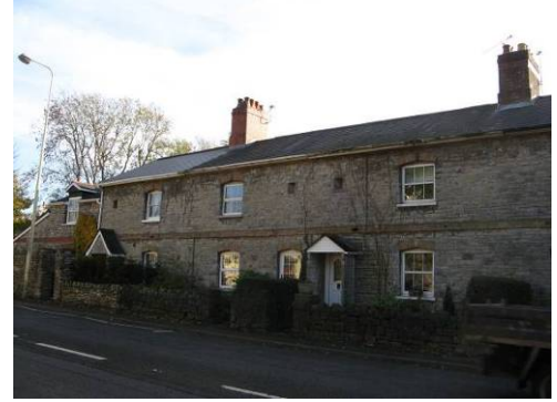
Nos 1-4 Red Lion Cottages