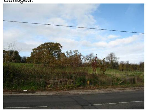
View from the A48 to the north west.

Overall the character of the village, where the plots face the main road, is of detached or terraced properties set back slightly from the road, the depth of the front gardens having been reduced by the road widening in 1930. Substantial stone walls and groups of mature trees are also important features, the heavy planting now seen in oblique views along the road having been encouraged by house owners to provide a visual barrier from the road. To the eastern and western edges of the village, the density of building reduces to the odd property until the road is totally bordered by fields.