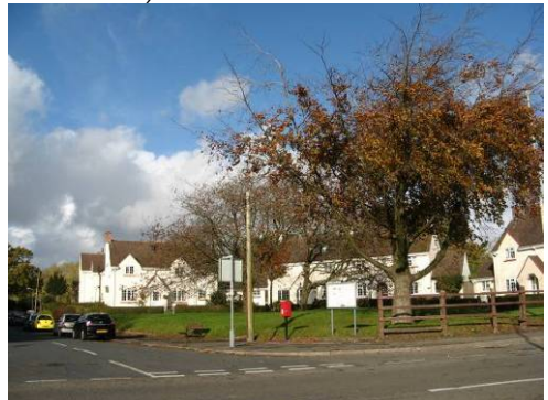
Well detailed Post-war housing off Maes-y-Ffynnon.