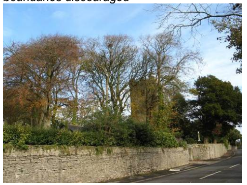
Trees are very important in the conservation area