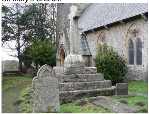
Cross in the churchyard of St. Mary's Church.