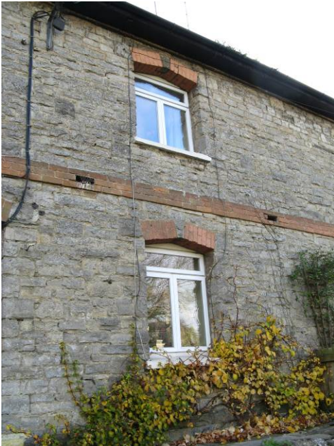
The use of local lias limestone as a building material is prevalent, occasionally with red brick dressing.