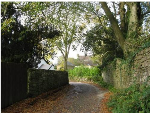
A quiet lane leads to Plas y Coed off the A48.