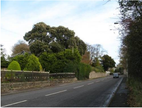
Historic stone walls in the conservation area need to be preserved, and modern boundaries discouraged