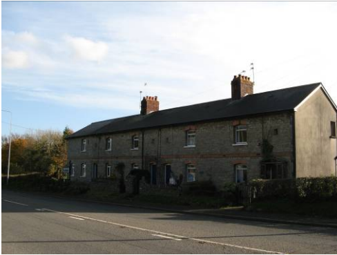
A mix of dwelling types adds to the character of the Conservation Area.