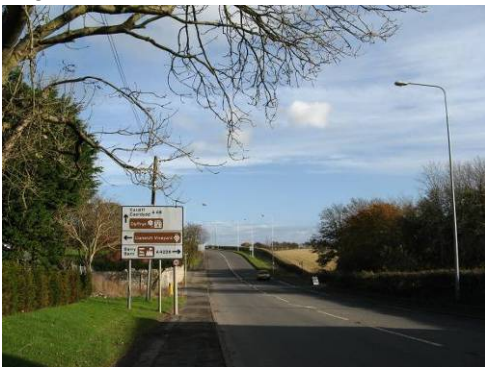
Entrance from the east.