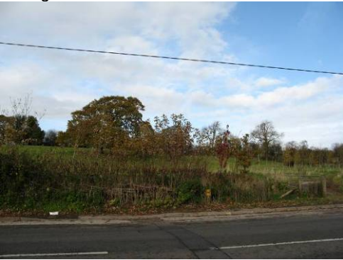
View from the A48 to the north west.

Overall the character of the village, where the plots face the main road, is of detached or terraced properties set back slightly from the road, the depth of the front gardens having been reduced by the road widening in 1930. Substantial stone walls and groups of mature trees are also important features, the heavy planting now seen in oblique views along the road having been encouraged by house owners to provide a visual barrier from the road. To the eastern and western edges of the village, the density of building reduces to the odd property until the road is totally bordered by fields.