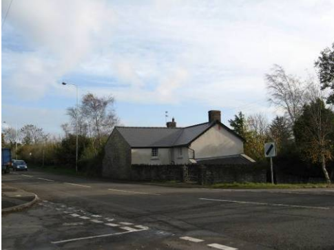
Historic houses lie close to the road (Pen-yr-Heol House).