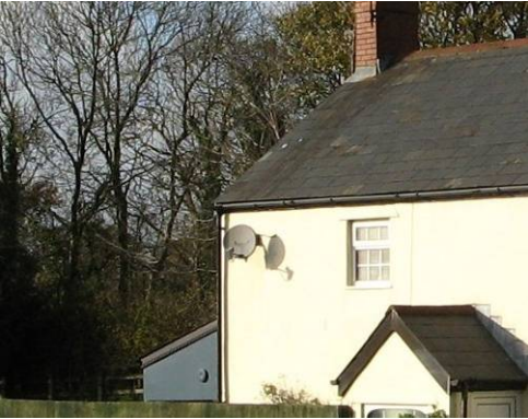
Highly visible satellite dishes can detract from the character of the Conservation Area.