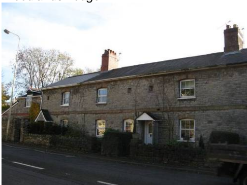
Nos 1-4 Red Lion Cottages

C19 estate cottages built in coursed limestone and displaying rustic decoration within timber porches, arched brick window openings and vents.