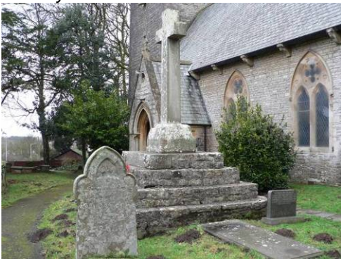
Cross in the churchyard of St. Mary's Church.