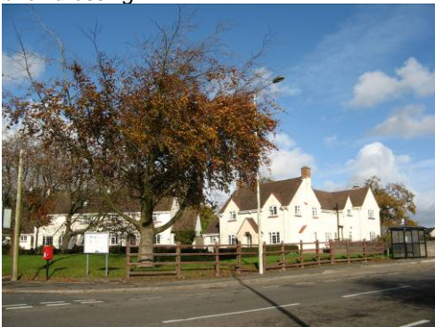
Former Rural District Council housing surrounds an attractive green.