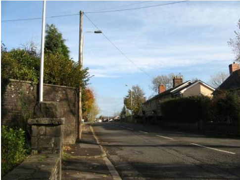
The conservation area is located along the A48.

Historically, Bonvilston was loosely centred on Bonvilston House, St. Mary's Church, and the Red Lion Inn, with farm groups, labourers' cottages and a few prestigious village houses scattered along the main street. Some of these buildings relate to the historic patronage of the Basset family of nearby Beaupré. Today, the village sadly lacks any focus and even the parish church of St. Mary's (a rebuild of the 1860s) is somewhat obscured by trees and sits awkwardly close to the road. The centre of the village, if there is one, is around the Red Lion Inn which is located on the north side of the A48. Between the church and pub is the former lodge to Bonvilston House, demolished in the 1970s to create the houses which now face Village Farm. The stables associated with the house can still be seen somewhat subsumed within the modern houses which curve around from Maes-y-Ffynnon, which connects back to the A48. All of these houses have been added since the 1940s.