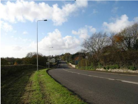
The A48 drops in level from the east.