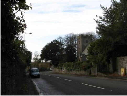
The A48 forms the defining spatial feature of the Conservation Area.

The defining spatial feature of the Bonvilston Conservation Area is the wide main road which gently curves and undulates through the village. The only public open space is provided by the small village green at the entrance to Maes-y-Ffynnon which contains a few trees and is otherwise simply grassed. The churchyard also provides some open green space, but its location high up above the level of the street, enclosed by a stone retaining wall, makes it visually cut off from the road, an impression reinforced by the somewhat low key entrance to one side. Private gardens and small fields provide the other open spaces, which vary tremendously in their impact on the conservation area as many are largely or totally hidden by high stone walls or planting. Many of the buildings also face the street, so their back gardens are similarly hidden from view. Overall the conservation area is very spacious and maintains a strongly rural character, with footpaths leading out into the surrounding countryside, although the post-war developments along Maes-y-Ffynnon and Village Farm add a more suburban element .