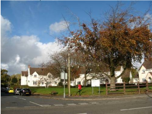
Well detailed Post-war housing off Maes-y-Ffynnon.