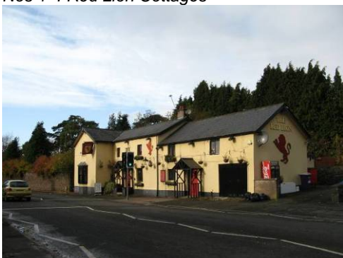
The Red Lion

A C19 farm house with attractive stone farm buildings within adjoining farm complex.