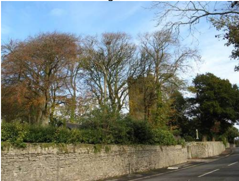
Trees are very important in the conservation area