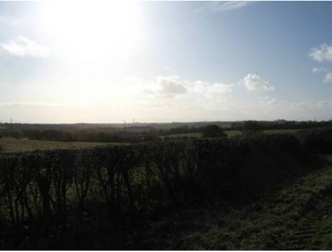
View southwards close to Sheepcourt Cottages.