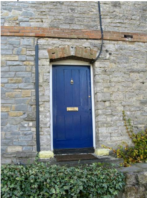
Details of the front door on Sheep Court Cottages