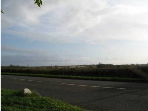
View to the south from Ty Groes Farm.