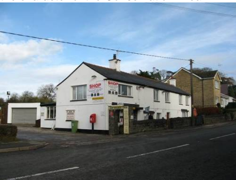
Cluttered signage to the Village Shop.