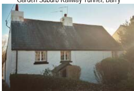
The Ramblers, Colwinston