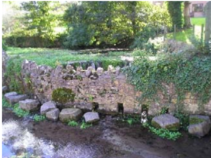
Baptismal Pool, Ewenny