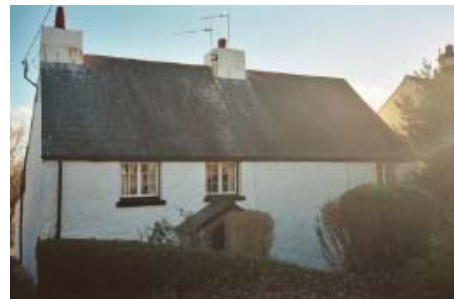
The Ramblers, Colwinston