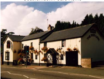
The Red Lion, Bonvilston