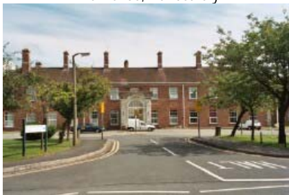
Llandough Hospital, Llandough