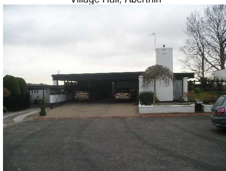
Modern housing at The Mount, Dinas Powys

3.1 The local items were identified by means of a partnership between the Council, representatives of town/community councils, the Penarth Society, other local amenity societies and independent local volunteers. Led by a steering group appointed in 2002, the project was partly funded by the Heritage Lottery Fund which provided support for a project co-ordinator.