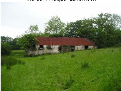
Tyr Mynydd, Welsh St. Donats

9.1 County Treasures is now available on the Council's website and includes the name and community of each building along with an architectural description, its reason for inclusion, a photograph and map.