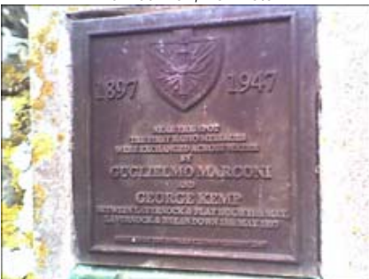
Marconi Plaque, Lavernock