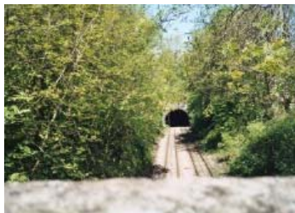
Garden Suburb Railway Tunnel, Barry