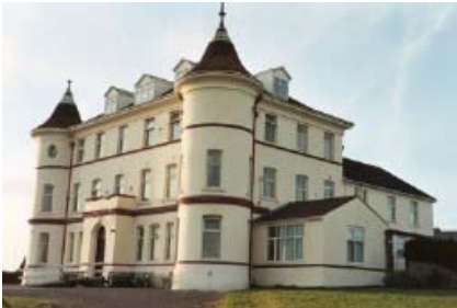
Southerndown Care Home