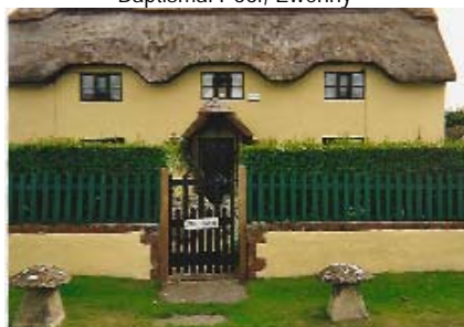
The Manse, Llanbethery