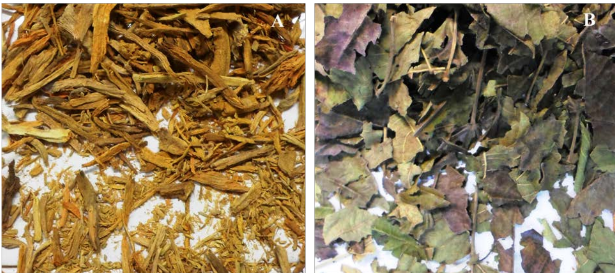
Photo LABIOCA 2. Samples of Cochlospermum planchonii . (A): Roots; (B): Leaves