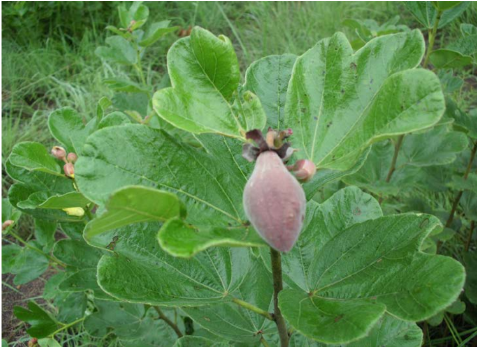
1. Cochlospermum planchonii