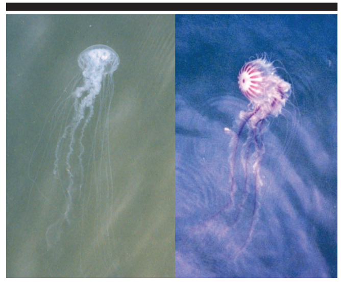
Figure 11. Sea nettle Chrysaora quinquecirrha . Two color morphs exist in the lower Chesapeake Bay, the more common white variety (left) and a less common red-striped variety (right).

Seasonal and interannual variability in medusae abundance is a function of water temperature and salinity, as well