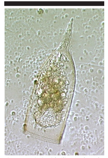
Figure 2. Tintinnid ciliate.

ciliated protozoa (aloricate ciliates and tintinnids). Rotifers, copepod nauplii, and sarcodines are also important at times. A study of the lower Chesapeake Bay found non-loricate ciliates to represent 60%, tintinnids 33%, rotifers 4%, and nauplii larvae (mostly copepods) 3%, of the total microzooplankton composition (PARK and MARSHALL, 1993). In the York River, the abundance of each of these groups was lowest in the tidal fresh region up-river, with numbers increasing in the meso- and polyhaline regions (PARK and MARSHALL, 1993). The species diversity of tintin-