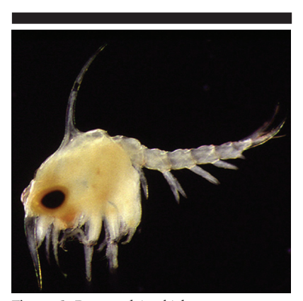
Figure 6. Decapod (crab) larva

larvae (Figure 6), bivalve (clam) and gastropod (snail) larvae, naupliar and cyprid stages of barnacles, and polychaete worm larvae (Figure 7) become numerically important in the Bay (BROWNLEE and JA-COBS, 1987, OLSON, 1987, GRANT and OL-NEY, 1983) and in the York River (e.g., SAN-DIFER, 1973). Some of these are demersal