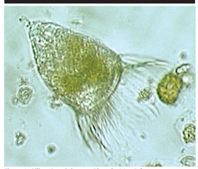
Figure 1. Ciliate Strombidium sp.

feeding. They are most common in the fresher regions of the bay, and although patchy, can be highly productive and reach high densities in some regions of the Bay (DOLAN and GALLEGOS, 1992). Other microzooplankton include the juvenile/larval stages of zooplankton such as copepods or other invertebrates.