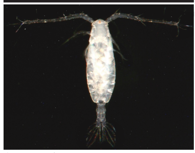
Figure 3. Copepod Acartia tonsa.

The dominant copepod species in the Chesapeake Bay are the calanoid copepods Acartia tonsa, Acartia hudsonica (formerly Acartia clausii), and Eurytemora affinis (HEINLE, 1966, BROWNLEE and JACOBS, 1987, OLSON, 1987). In the lower polyhaline portion of the bay, the summer copepod assemblage is dominated by Acartia tonsa (Figure 3), and in winter there is a shift to Acartia hudsonica (BROWNLEE and JACOBS, 1987). In the upper mesohaline portion of the York River (station RET 4.3, CBP), Acartia spp. abundance peaks in August and Eurytemora peaks in March /April. However, while the lower York also experiences a summer Acartia bloom there is no winter Eurytemora peak (station WE 4.2, CBP, STEINBERG and BRUSH, unpublished data). This is consistent with what is found in the rest of the lower polyhaline region of the mainstem bay, where numbers of Eurytemora affinis are much reduced compared to the upper, mesohaline, mainstem bay. In the lower York, Pseudodiaptomus coronatus can also be very abundant in summer (PRICE, 1986). Acartia exhibits diel vertical migration, with densities substantially higher in the surface waters at night in the lower York