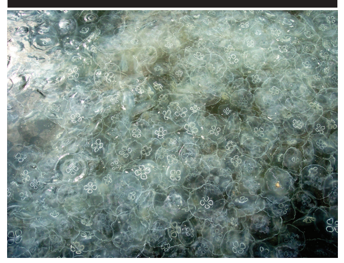
Figure 12. Moon jelly Aurelia sp. bloom in Mobjack Bay at the mouth of York River.

Another scyphomedusan abundant at times in the York River is the moon jelly, Aurelia sp. (Figure 12). Moon jellies are present in the polyhaline regions of the lower York River and Chesapeake from June–July when they can form large swarms or aggregations (CONDON and STEINBERG, 2008) (Figure 12), usually determined by local hydrographic conditions such as fronts (GRAHAM et al. , 2001). In the winter months (January–March) the Lion's Mane jellyfish, Cyanea sp., can also be found in the lower York River and Chesapeake Bay (BURRELL, 1972; CONDON and STEINBERG, 2008). This winter jelly has received little attention and consequently virtually nothing is known of the ecology and impact of Cyanea medusae in the