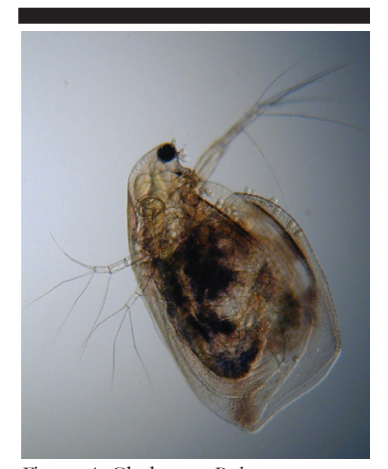
Figure 4. Cladocera Podon sp.

estuarine species, such as Podon polyphemoides which peaks in May, occasionally proliferate in the lower, polyhaline portion of the bay, sometimes extending the length of the estuary (Bosch and Taylor, 1967, 1973). In the tidal fresh Mattaponi tributary of the York, Bosmina is the most common genus and peaks in spring (April/May) (J. HOFFMAN, pers. comm.), while Podon peaks at the mouth of the York in July (CBP; STEINBERG and BRUSH, unpublished) (Figure 4).