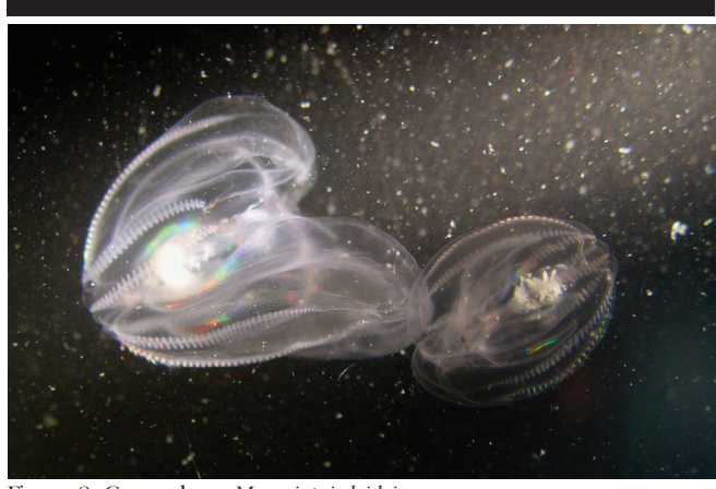
Figure 8. Ctenophore Mnemiopsis leidyi

Ctenophores or comb jellies are the largest animal to move by cilia, and have eight rows of 'combs' made of fused macrocilia that they use to swim (Figures 8 and 9). Some have tentacles loaded with sticky cells called colloblasts that are used to capture food. Others, such as the lobate ctenophores, use a pair of oral lobes coated with sticky mucus to trap prey items upon contact.