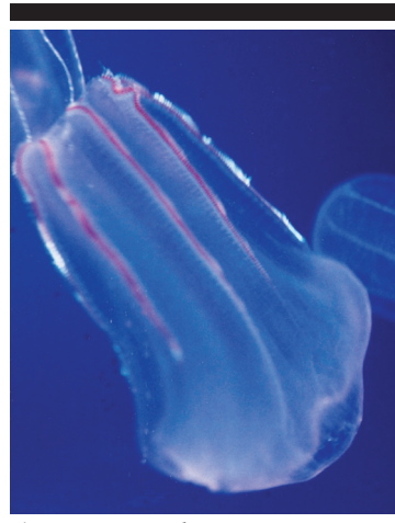
Figure 9. Ctenophore Beroë ovata