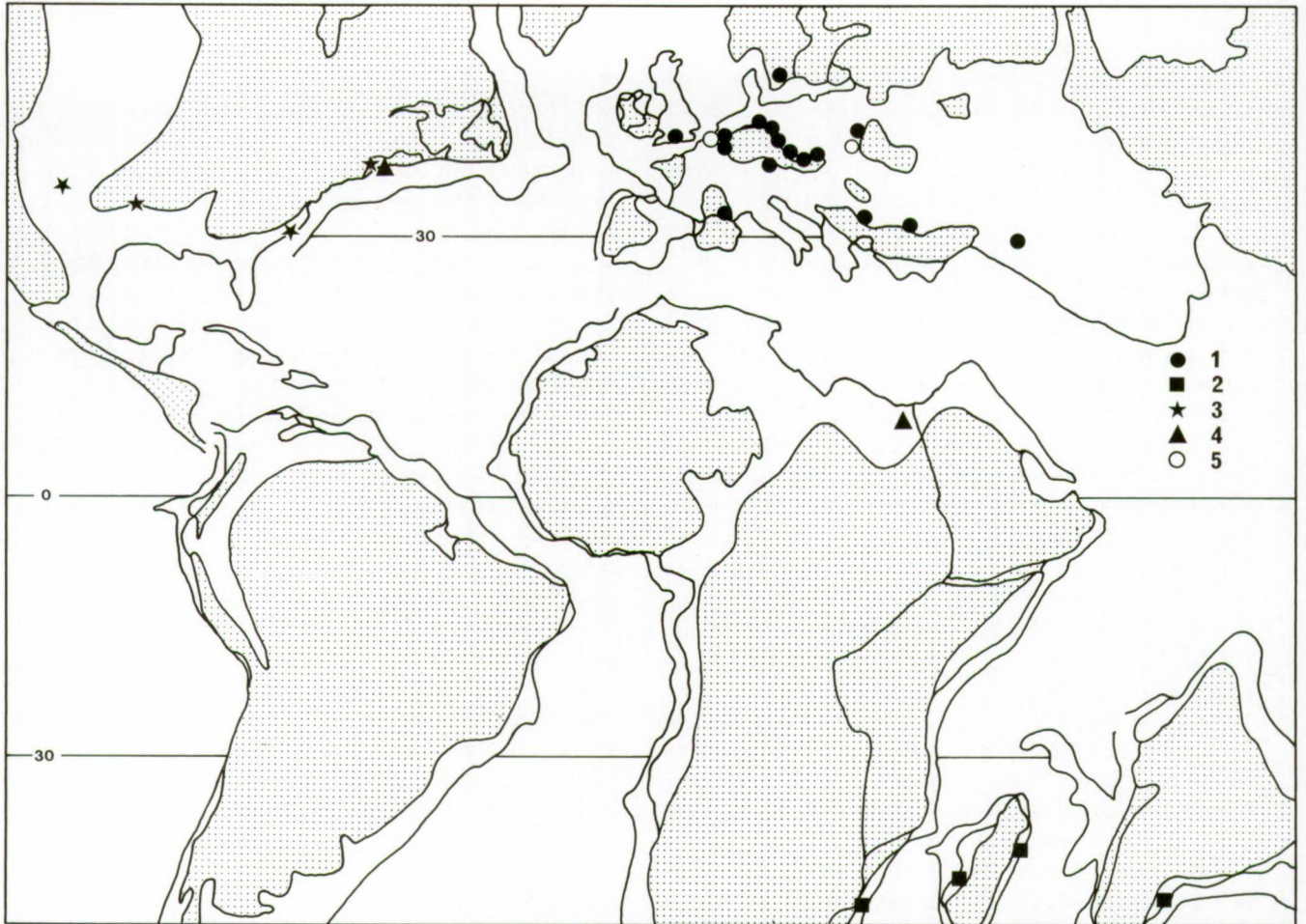
Text-Figure 1. – Palaeogeographic distribution of Liopistha species: (1) L. aequivalvis (GOLDFUSS, 1841), (2) L. lucerna (FORBES, 1846), (3) L. protexta (CONRAD, 1853), (4) L. alternata WELLER, 1907, (5) Liopistha sp. cf. L. alternata . Data out of literature and personal research. Palaeogeographic reconstruction at 80 million years from BARRON et al. , 1981.

lected two Liopistha specimens (3655 and 3656) in steinkern preservation which are close to L. alternata WELLER, 1907 (p. 527, pl. 58, figs. 7-9, fide RICHARDS, 1958, p. 168) from the Merchantville Fm., i.e. Lower Campanian (OWENS et al. , 1970).