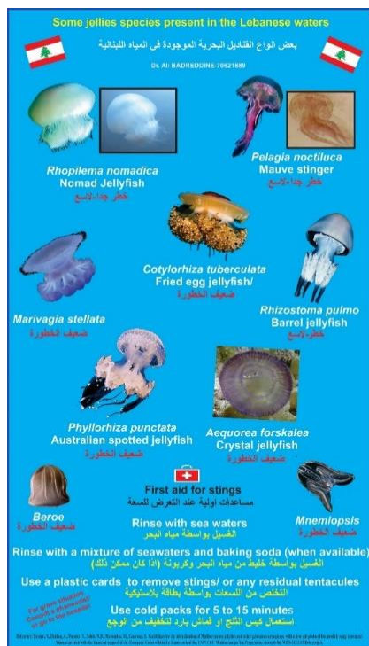
Figure 3. Poster about common sea jelly species in the Lebanese waters published via social network and distributed to the public along the Lebanese coast

In the Lebanese waters, new records of marine species are also continuously reported (Bitar and Badreddine 2019; Stern et al. 2019; Bariche and Fricke 2020). This fact is more related to the use of citizen science as an important monitoring tool to detect new species. It is also the case of C. erythraea reported here. It is worth noting that citizen science has been used also to survey existing jellies and detect new ones in many areas of the Mediterranean Sea (Boreo et al. 2009, 2016; Piraino et al. 2016; Douek et al. 2020). In this context and to guarantee a long-term monitoring, we have launched an awareness campaign on jellyfish along the Lebanese coast (see the poster, Figure 3) that allows to introduce the common jellies in the Lebanese waters to the public and especially sea-lovers.