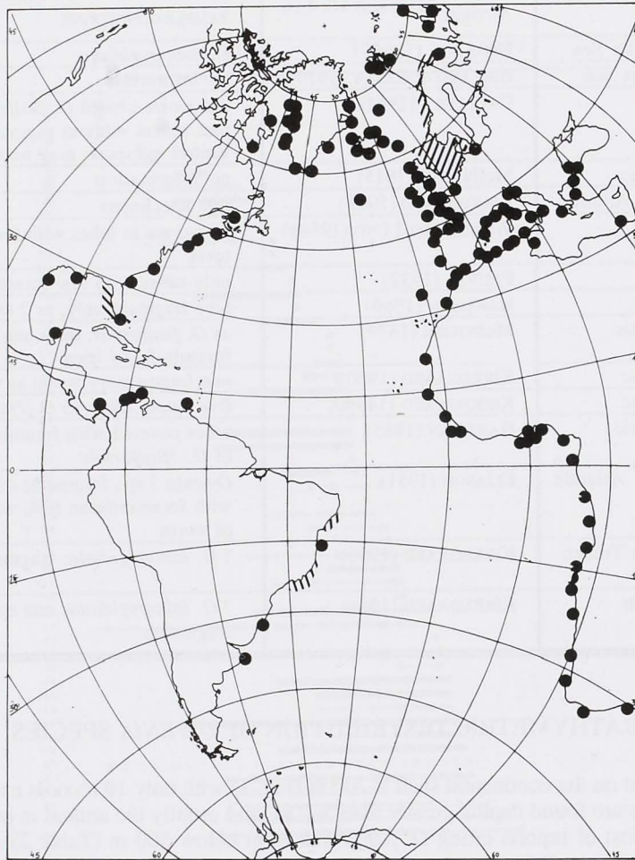
FIG. 2. — The atlantic distribution of O. fusiformis . From AMOUREUX (1966, 1970, 1971, 1972, 1973, 1976), ANADON (1980), ANDREWS (1891), AUGENER (1928), BACHELET (1981), BAKALEM & ROMANO (1978), BAKALEM (pers. comm.), BELLAN (1969a,b), BIDENKAP (1894, 1907), BRUCE et al. (1963), BUCHANAN (1957), BUCHANAN et al. (1978), CAPACCIONI -AZZATI et al. (1991), CASTELLI et al. (1991), CLAPARÈDE (1868), COGNETTI-VARRIALE & ZUNARELLI-VANDINI (1979), CURTIS (1972, 1977), DALE et al. (1989), DANIELSSEN (1859), DAY (1961, 1967), DAY et al. (1971), DEWARUMEZ (pers. comm.), DIAPOULIS & BOGDANOS (1983), DUMITRESCO (1960), EAGLE (1973), EAGLE & HARDIMAN (1976), EHLERS (1875), ELIASON (1962), FAUVEL (1909, 1911, 1936, 1937), FAUVEL & RULLIER (1959a,b), FRANKENBERG & LEIPER (1977), GAGE (1972), GAMBI & GANGRANDE (1986), GEORGE (1974), GIANGRANDE & GAMBI (1986), GILLET (1985, 1988), GLÉMAREC (1969), GUELORGET & MICHEL (1979), GUILLAUMONT & HAMON (1983), HAMOND (1966), HARTMAN (1944), HARTMANN-SCHRÖDER (1971, 1974b), HASSAM (1991), HOLTHE (1977b), IBANEZ AGUIRRE & SOLIS WEISS (1986), INTES & LE LOEUFF (1977), JELDES & LEFEVERE (1959), JOHNSON (1901), KINBERG (1867), KIRKEGAARD (1959, 1969, 1978, 1983), LABORDA (1987), LAUBIER (1962), LAVERDE-CASTILLO & GOMEZ (1987), LOPEZ-JAMAR (1981), LOPEZ-JAMAR et al. (1986), LUNA (1967), MCCALL (1977), MCINTOSH (1879, 1915), MCINTYRE (1958), McNULTY & LOPEZ (1969), MALMGREN (1867), MARINOV (1977), MASSÉ (1971), MICHAELSEN (1897, 1898), MILLIGAN (1984), NICOLAIDOU et al. (1988), NICOLAIDOU & PAPADOPOULOU (1989), NILSEN & HOLTHE (1985), NONATO & LUNA (1970), ORENSANZ & GIANUCA (1974), PEER et al. (1980), PROBERT (1981), QUINTINO & GENTIL (1987), REES (1983), REES et al. (1976), RIOJA (1917), RULLIER (1963, 1965a), RULLIER & AMOUREUX (1979), SANZ (1986), SHIN et al. (1982), STEIMLE (1982), TORRES-GAVILA et al. (1990), TREADWELL (1948), TUNBERG (1982), VOVELLE (1963), WACASEY et al. (1979), WESENBERG-LUND (1950a, b, 1951, 1953), ZGHAL & BEN AMOR, (1980), ZUNARELLI-VANDINI & COGNETTI-VARRIALE (1981).