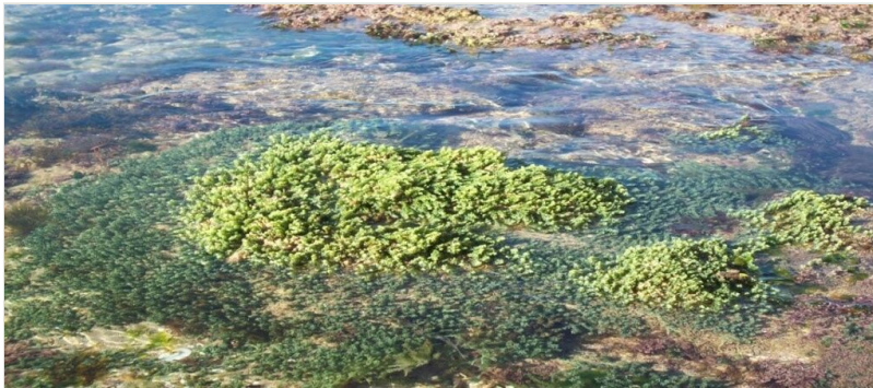
Figure 5. doi

cover of 50% of Chlorophyceae in the Salamandre Station. This high presence rate is an indicator of a polluted environment which is confirmed by domestic and urban discharges (Khiari et al. 2017, Damak et al. 2019) duly observed at Salamandre Station, in addition the presence rate of the invasive species C. cylindracea amount to 10.83% (Table 1) which confirms an increasingly advanced colonisation.