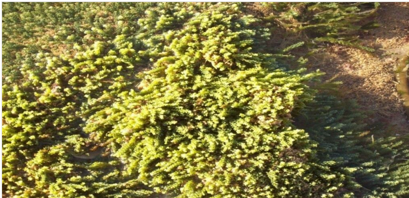
Figure 6. doi

Central colonies of C. cylindracea at the Salamandre Station.