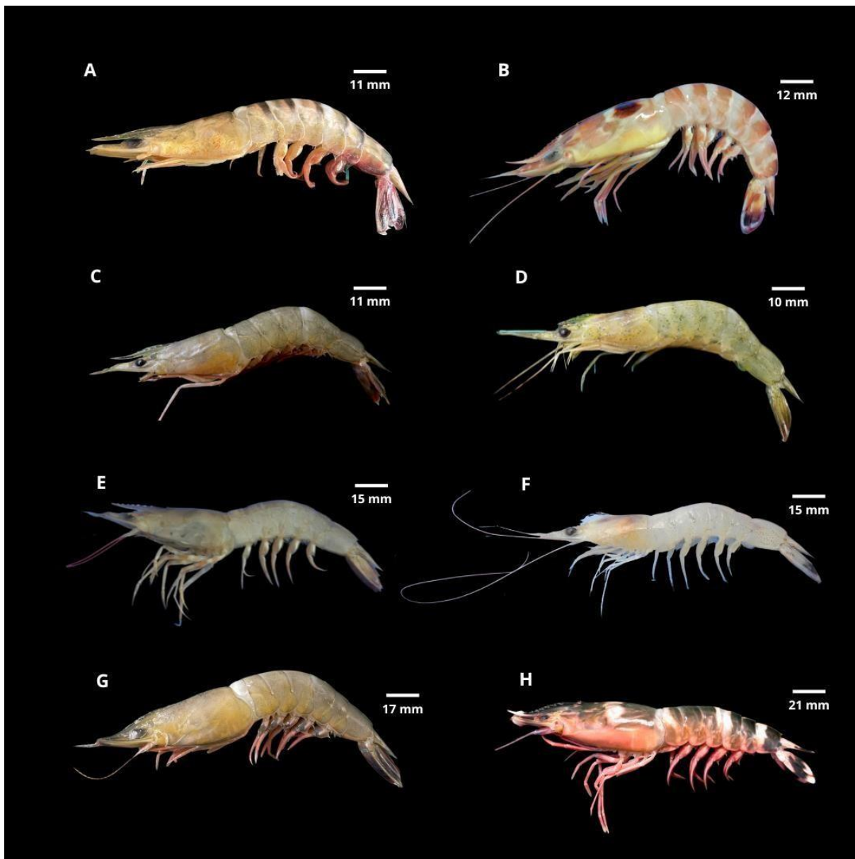
Figure 2. Shrimp species collected in this study. A) Alcockpenaeopsis hungerfordii ; B) Ganjampenaeopsis uncta ; C) Metapenaeus affinis ; D) Metapenaeus brevicornis ; E) Metapenaeus ensis ; F) Metapenaeus lysianassa ; G) Mierspenaeopsis hardwickii ; H) Mierspenaeopsis sculptilis . Bar scale on each photo indicates the total length of the species in millimeter (mm).