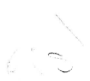
Fig. 1. The SW Netherlands coastal area, with waters mentioned in the text: G = Grevelingen; H = Haringvliet; M = Markiezaatsmeer; O = Oosterschelde; OM = Oostvoornse Meer; V = Volkerak; VM = Veerse Meer; W = Westerschelde. Also shown is the expansion of the alien rhodophyte Polysiphonia senticulosa (black dots), established in 1993 - by spring 1998 this species was a co-dominant in the algal vegetations where the first collections were made.