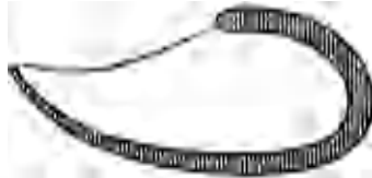
FIG. 2.—Sagittal section of the shell of Cymbuliopsis in which the dotted line indicates the aperture.

Characters and Description .—"Shell" in form of a slipper, with thin walls, and a very large cavity extending to the dorsal extremity. The latter is rounded, while the ventral extremity, which is very delicate, ends in a level margin. The whole external surface is covered with small, uniform tubercles; the aperture is of considerable size; its margins do not bear spines.