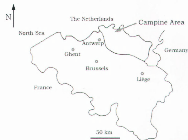
Figure 1. Location of the Campine Area.