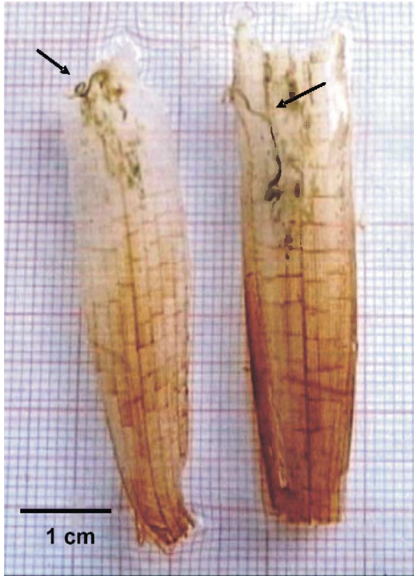
Fig. 1. Small boring polychaetes ( Nematoneis cf. unicornis ) in the sheaths of Thalassia testudinum (arrows).

belonged to both species of Lysidice . Small polychaetes were found within sheaths from which the green blade had most recently abscised (first dead sheath) until the fourth dead sheath. They were located inside burrows made in the mesophyll of a sheath (Fig. 1). These burrows were quite regular, narrow ( \approx similar to the width of the polychaete) and linear or sinuous, following the nerves of the sheath, located in the upper part of the sheath (upper 1–3 cm, Fig. 1). Larger polychaetes entered the bundle of dead sheath tissue through small holes bored in the outer sheath about 1.3–2.0 cm from the leaf base (Figs. 2 and 3). Subsequently, traces of burrowing by large polychaetes extended through a large part of the bundle of dead sheath tissue, from the outermost until the fifth to third dead sheath (Fig. 3). Empty burrows, formed by both small and larger worms, were filled with sediment, and often hosted other species of non-burrowing polychaetes (spionids, capitellids, sabellids, dorvilleids, syllids, cirratulids, nereidids), or sipunculids. None of the boring polychaetes settled in sheaths of living leaves which still had attached green blades.