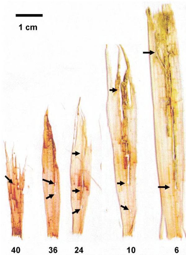
Fig. 3. Sheaths of a Thalassia testudinum shoot damaged by a large polychaete borer ( Lysidice cf. ninetta or L. cf. collaris ). The numbers represent the sheath number; numbering starting with the youngest (live) sheath. Because the leaves alternate on the vertical rhizome, every other sheath number has burrowing marks of the same large polychaete. Inclined arrows in the oldest sheaths indicate small holes made when the polychaete bored into the sheath bundle, and horizontal arrows indicate the longitudinal burrows in the younger sheath tissue.