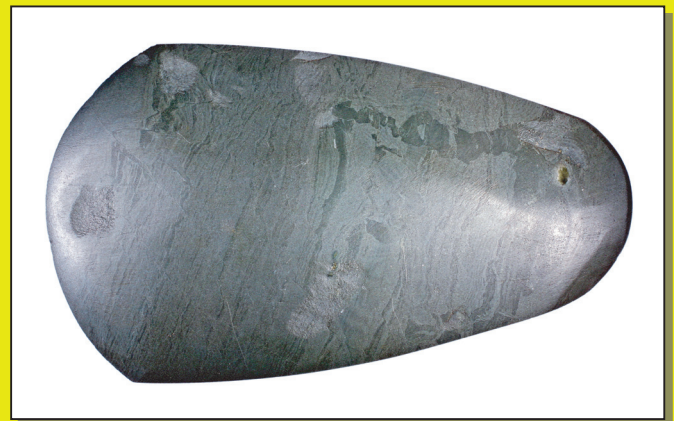
Polished Axe head