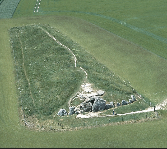
An aerial view of West Kennet Long Barrow

① Long barrows are ancient tombs. First a wood or stone 'house' was built for the dead, then covered with a long mound of earth, or chalk and earth. West Kennet Long Barrow was built sometime around 3,650BC.