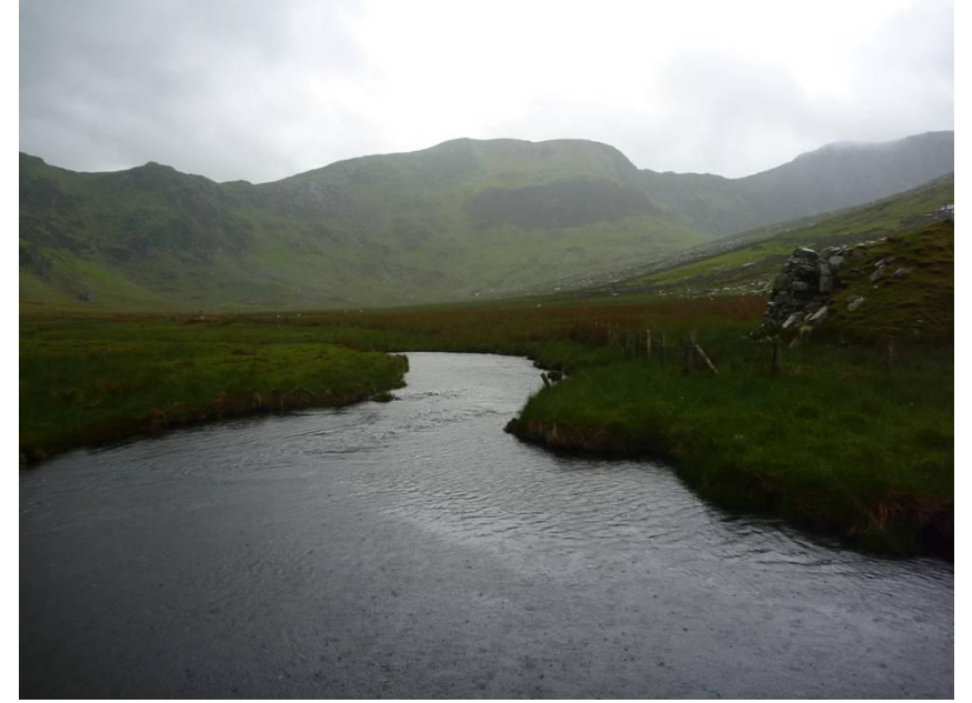
Figure 5: The river displays a meandering plan-form and there is quite a good degree of variation in depth, current velocity and cross-sectional profile evident. There is, though, little or no cover for fish.

Habitat within the river channel (Fig. 5) can be characterised as supporting features such as a meandering plan-form, riffles and lateral scour pools (deposition of gravels on the inside of bends and noticeable increases in depth on the outside of bends).