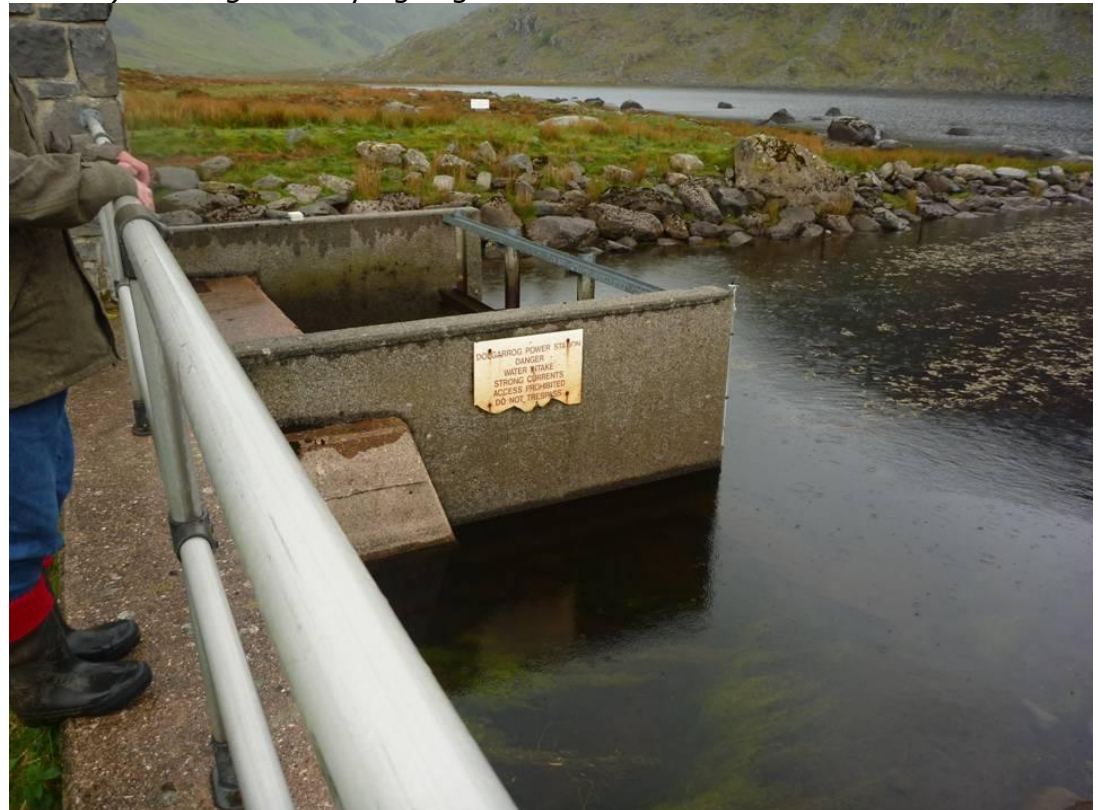
Figure 2: Draw-off point for transferring water and associated hydro-electricity generation

The first feature inspected was the draw-off outlet for hydro-electric generation at SH 72108 64900 (Fig. 2). Since the failure (and subsequent additional dismantling) of the dam, these sluice gates now exert the principle control on the level of water in the lake. Whilst the original damming would have artificially raised water levels, it is locally-believed that the current operation of the sluices impacts on the ecology of the lake. The protocol for the transfer of water imposes a heavily-regulated pattern of water level and, consequently, littoral (shore-line) wetting and drying regime.