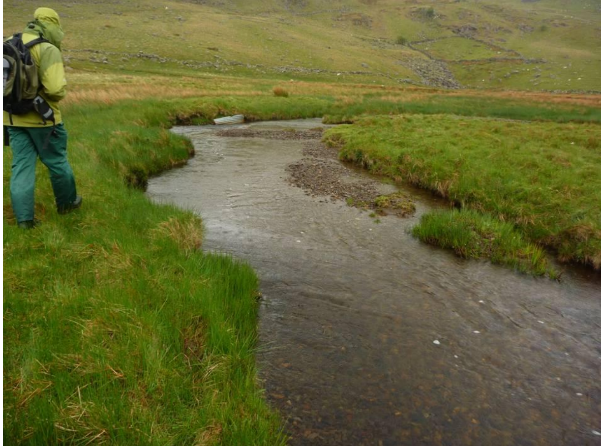
Figure 6: The lack of deep root structure (prevented from developing due to even comparatively light grazing at this elevation) is compounding an over-abundance of gravels by promoting low resistance in the riverbanks. Tussocks of grass in the channel (right of frame) and behind the corrugated iron revetment (upper left/middle of frame) indicate that the rate of bank erosion is too fast.

However, the bed material consists almost entirely of mobile gravels between approximately 20 mm and 50 mm in diameter. In addition, although the levels of grazing stock are relatively low, there is no succession of woody vegetation and there are examples of "block failure" of riverbanks (Fig. 6)