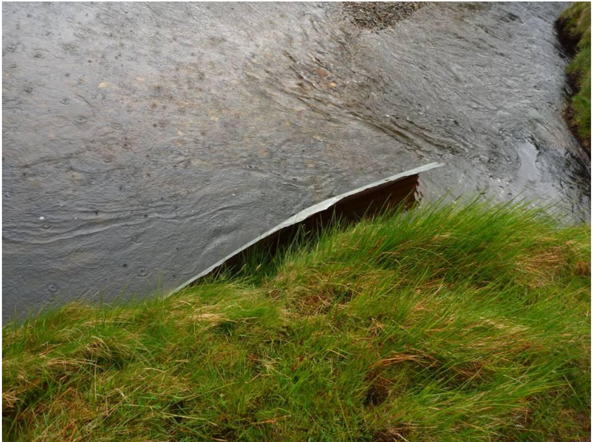
Figure 7: Sheet metal revetment (centre of frame) designed to protect the bank – but clearly causing worse erosion immediately next to it (right of frame)

The conditions in the sections of river detailed in this report are evident right up to the points at which the steep mountain-side streams join together in the valley-bottom to form the main Afon Eigiau. As a result, there is an excess of juvenile habitat and a lack of adult habitat – as well as an over-supply of gravel to the stream bed; increasing the bed mobility and the chances of egg/alevin wash-out.