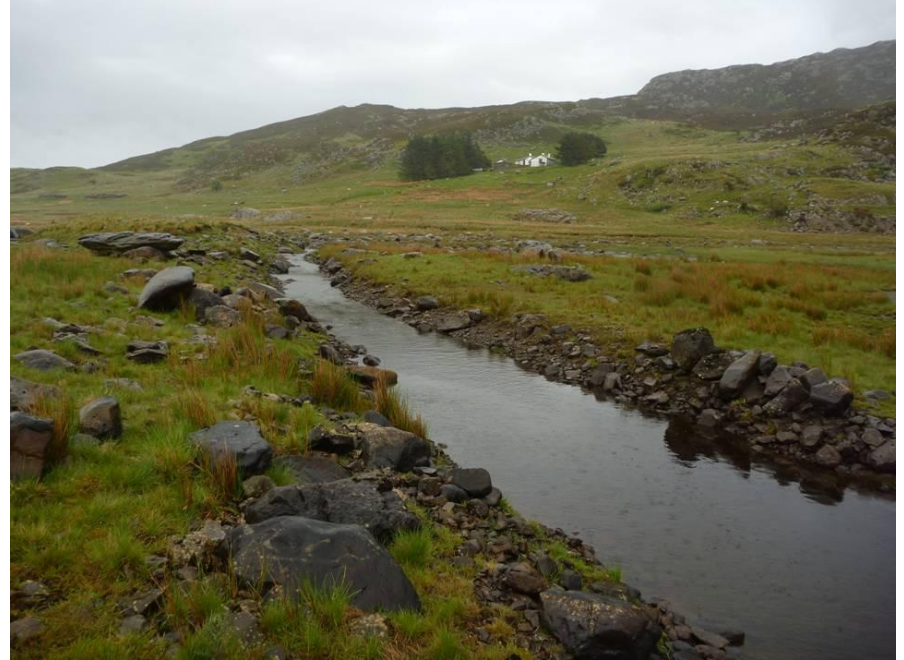
Figure 4: Recently-constructed bypass channel serving the hydropower system: a further complication for fish migration due to controlling influence on water levels and connectivity between the river and the lake. It is also very poor trout habitat.

easy to understand when nearly all of the "lost" area consists of productive shallows. By contrast, the remaining water consists of a more even split of both deeper refuge (also a vital habitat component) and a comparatively small area of shallow bays. On top of this, if there is even a small additional effect of either reduced spawning access or fish lost to the water-transfer system, the compounded effects could cause an effect that is greater than the sum of each individual part.