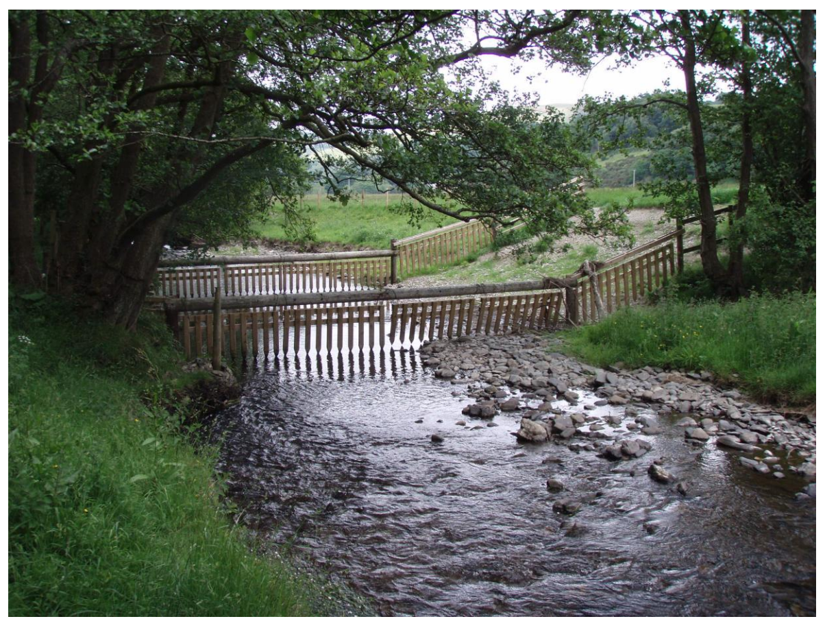
Figure 8: Example of top-hung water gates that would be required at each end of a grazing exclusion. Fencing panels that are orientated at 90-degrees to the river could also be installed in a similar fashion to prevent damage during out-of bank spate flows (or the use of loosely-tacked fencing panels that will break away during floods, and be easily replaced, can be a viable alternative)

It is a legal requirement that some works to the river may require written Natural Resources Wales consent prior to undertaking those works, either in-channel or within 8 metres of the bank. Any modifications to hard defences will require a land drainage consent on any river designated as "main river". Advice can be obtained from the local Development Control Officer. The ownership of the land and its management for a means of electricity generation and farming will also