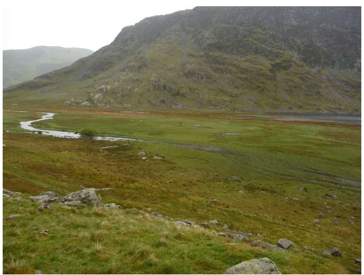
Figure 3: Afon Eigiau entering Llyn Eigiau via a diffuse network of vegetated channels

Members of the Dolgarrog angling club previously report captures of larger trout in the river system that are now no longer seen. Given the relatively small size of the river, this phenomenon could be consistent with a life-history similar to that exhibited by "dollaghan" trout in Ireland. In other words, fish growing to increased adult sizes within a lake habitat and re-entering the river system in order to spawn. Although the breeding and associated migration urge is incredibly powerful in brown trout, a reduced success rate in entering the feeder stream cannot be ruled out (either by reduced window of migration opportunity or increased predation impacts during delays).