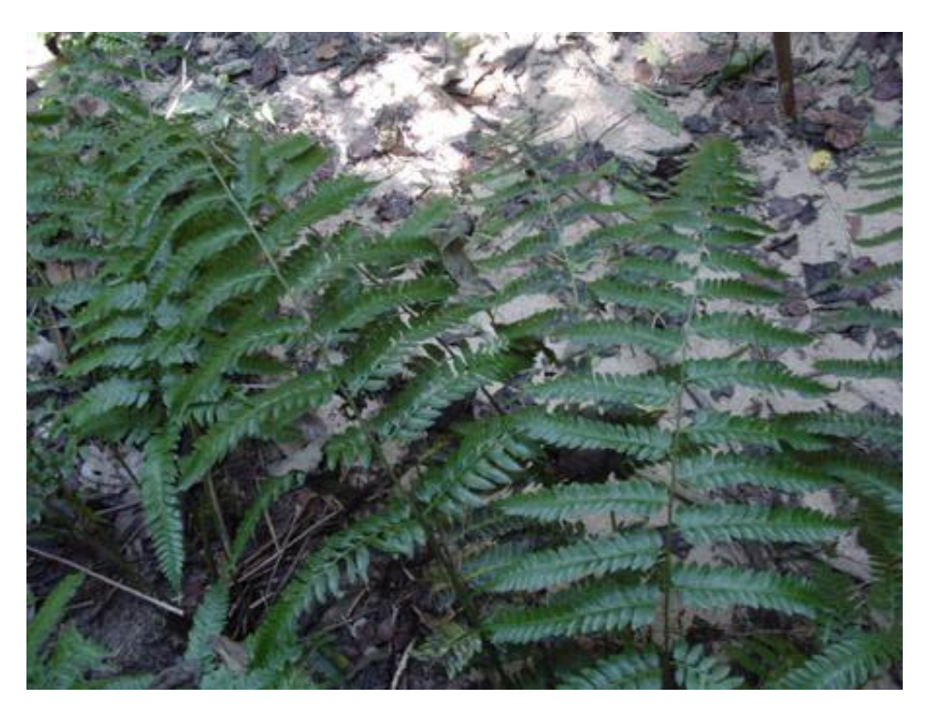
Diplazium lonchophyllum growing beside a stream bed in a ravine on Weeks Island, Iberia Parish.