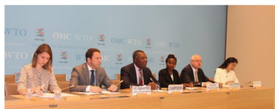
Informal Group on Accessions – 30 June 2016