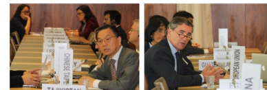
Informal Group on Accessions – 30 June 2016