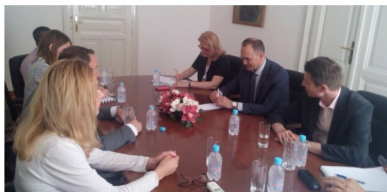
Mission to Sarajevo – Meeting with Parliamentary Assembly and the Negotiating Team 21-22 June 2016

"In spite of the Constitutional complexities and post-war challenges, the Government of Bosnia and Herzegovina has a vision. With purpose and determination, the aim is to close its 17-year WTO accession process in 2016."