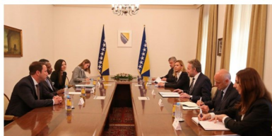
Mission to Sarajevo – Meeting with President Izetbegović 21 June 2016