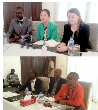
National Workshop on Post-Accession, Monrovia, Liberia 27-29 June 2016

A high-level WTO/UNCTAD Post-Accession Forum would be held on the margins of UNCTAD XIV in Nairobi on 19 July. This event would bring together the Governments of Afghanistan and Liberia and their multilateral and bilateral partners to discuss the on-going post-accession work and support, so that the two LDCs can maximise the benefits of WTO membership.