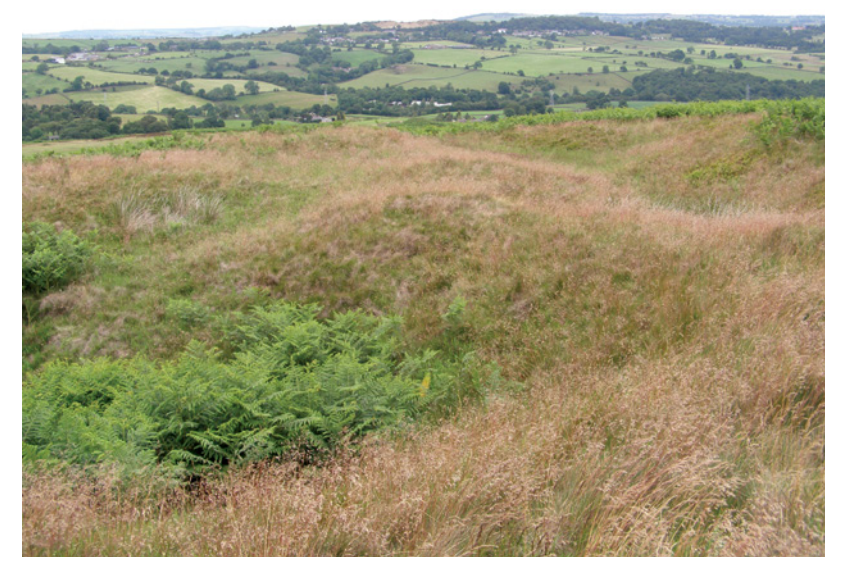
Sandstone quarry waste at Acrehow Hill Delph.