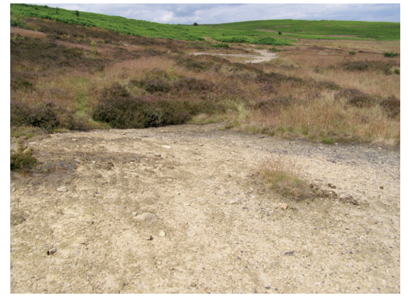
Fireclay spoil to the north of the fireclay mine.

Spoil heaps are common in mining areas and are comprised of waste material from the mining activities. Landslips are also frequent around mines where loose ground moves downwards either due to gravity or to high water content, which reduces the friction within the material. Both spoil heaps and landslips create undulating ground, which can be seen over most of Baildon Hill.