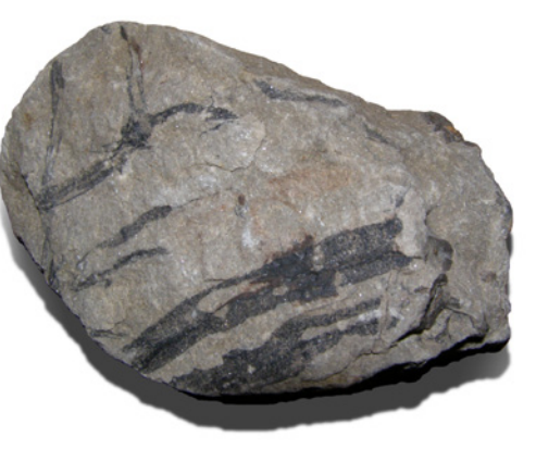
Sample of Ganister.

Ironstone is a sedimentary rock comprised of a high percentage of iron minerals. It is often found as nodules within bands of mudstone but it is not regularly distributed at Baildon Hill. It was extracted by picking the nodules out of the shale. Smelting took place in this area in medieval times. A bloomery or smelting works has been located at Glovershaw, to the west of Baildon Hill. Local mudstones could have provided the ironstone nodules that were exploited here.