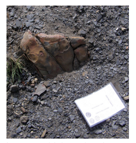
Ironstone nodule in a path on the east side of Baildon Hill.