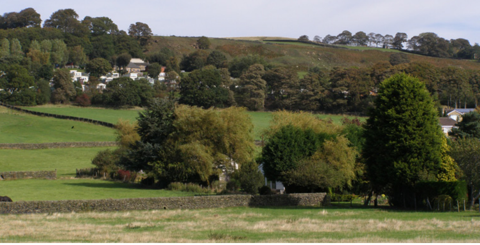
Escarpment formed by the 48 Yard Rock, looking north east from Bracken Hall. There are guarries in the 48 Yard Rock along the slope to the right of the Crook Farm caravan park.

The landslips have covered the coal seams between the 48 Yard Rock and the Rough Rock with a layer of clay and sandstone, which perhaps explains why there is little evidence that the coal seams were exploited on the south side of Baildon Hill.