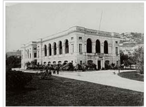
The Neapolitan Stazione Zoologica , Giesbrecht's main work place