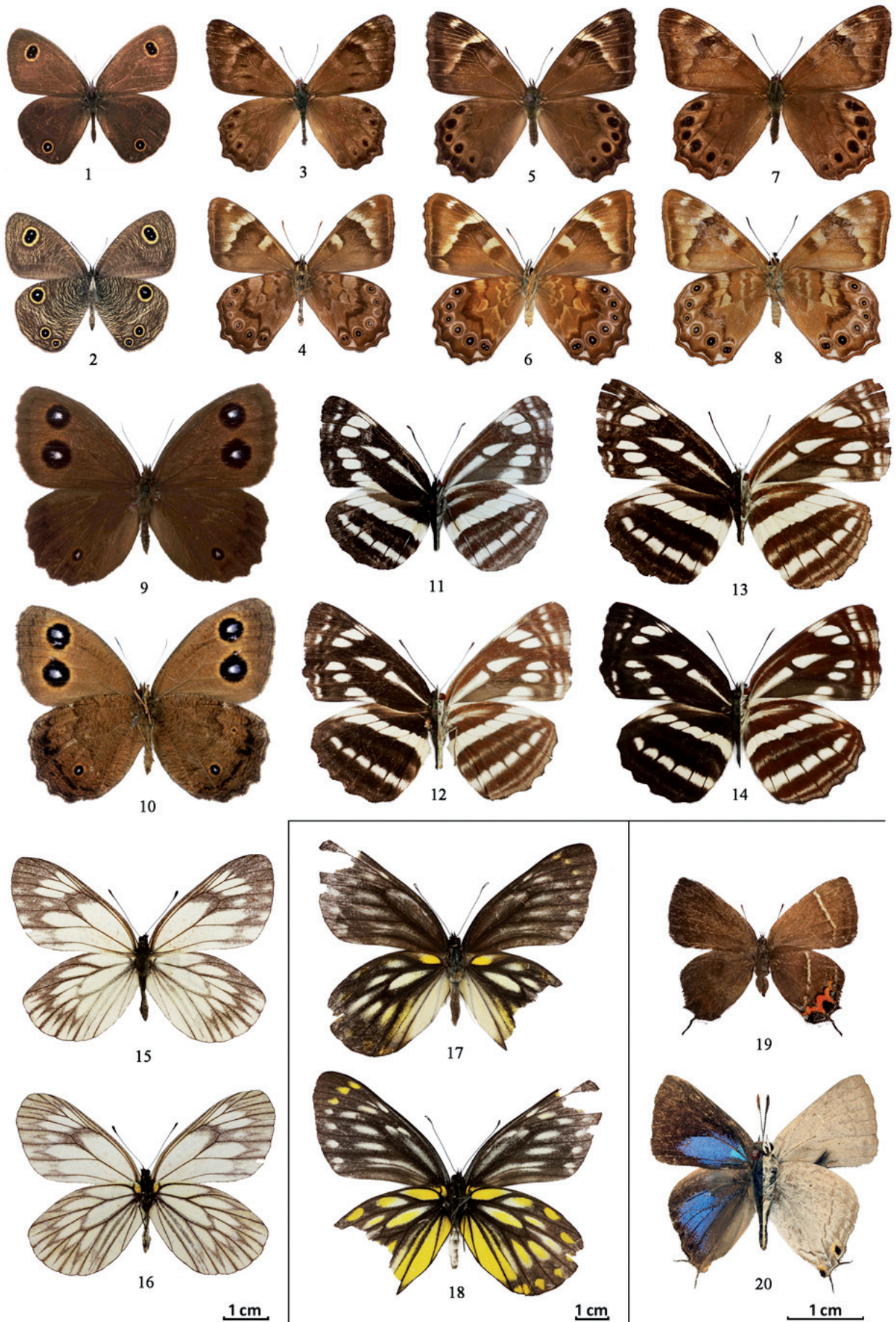
Fig. 1, 2: Ypthima eckweileri UEMURA & KOIWAYA, 2001, ♂, Liping Natural Reserve, Nanzheng County. Fig. 3-6: Lethe leeii ZHAO & WANG, 2000, Danangou, Fengxian County; (3, 4) ♂, (5, 6) ♀. Fig. 7, 8: Lethe liyufei HUANG, 2014, ♀, Pianpiangou, Zhouqu County. Fig. 9, 10: Minois dryas (SCOPOLI, 1763), ♂, Pianpiangou, Zhouqu County. Fig. 11: Neptis mahendra MOORE, 1872, ♂, Pianpiangou, Zhouqu County. Fig. 12: Neptis choui YUAN & WANG, 1994, ♀, Pianpiangou, Zhouqu County. Fig. 13: Neptis mahendra MOORE, 1872, ♀, Pianpiangou, Zhouqu County. Fig. 14: Neptis choui YUAN & WANG, 1994, ♀, Pianpiangou, Zhouqu County. Fig. 15, 16: Aporia nishimurai KOIWAYA, 1989, ♀, Tiangangou, Zhouqu County. Fig. 17, 18: Delias berinda (MOORE, 1872), ♀, Simianshan. Fig. 19: Satyrrium patrius (LEECH, 1891), ♀, Pianpiangou, Zhouqu County. Fig. 20: Pratapa spec. , ♂ Liping Natural Reserve, Nanzheng County.