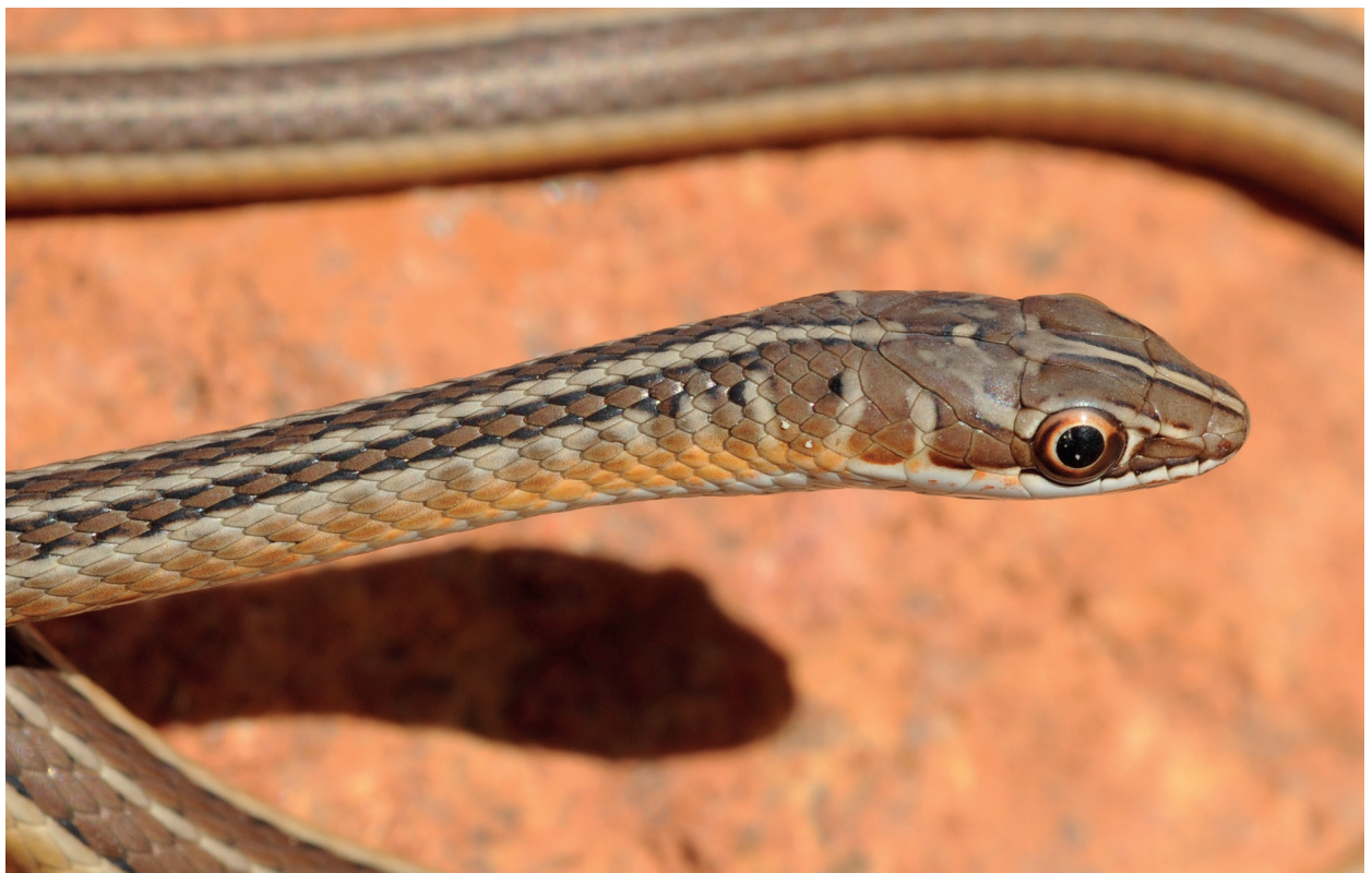
Fig. 18. Psammophis sudanensis . Jos (Nigeria). Specimen with a typical head and dorsal pattern.