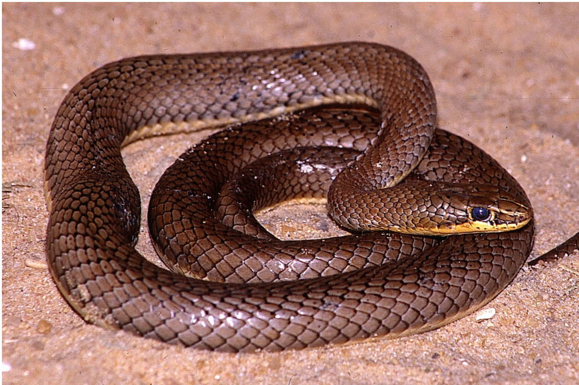
Fig. 10. Psammophis sibilans . Plain phase. Specimen from Faiyum (Egypt).