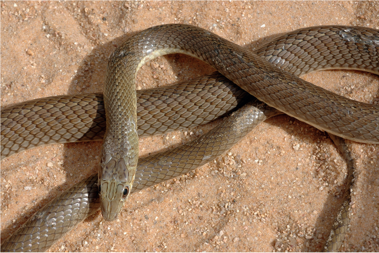
Fig. 16. Psammophis afroccidentalis sp. nov. General view of a specimen with a typical dorsal head pattern, ill-defined vertebral chain and lacking pale dorsal stripes. Dielmo, Senegal.