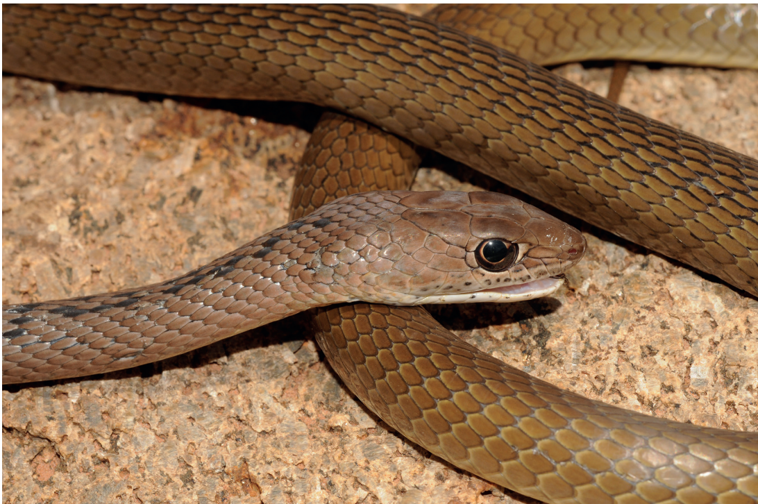
Fig. 22. Psammophis mossambicus . Sequenced specimen IRD 2238.N. Baïbokoum (Chad).