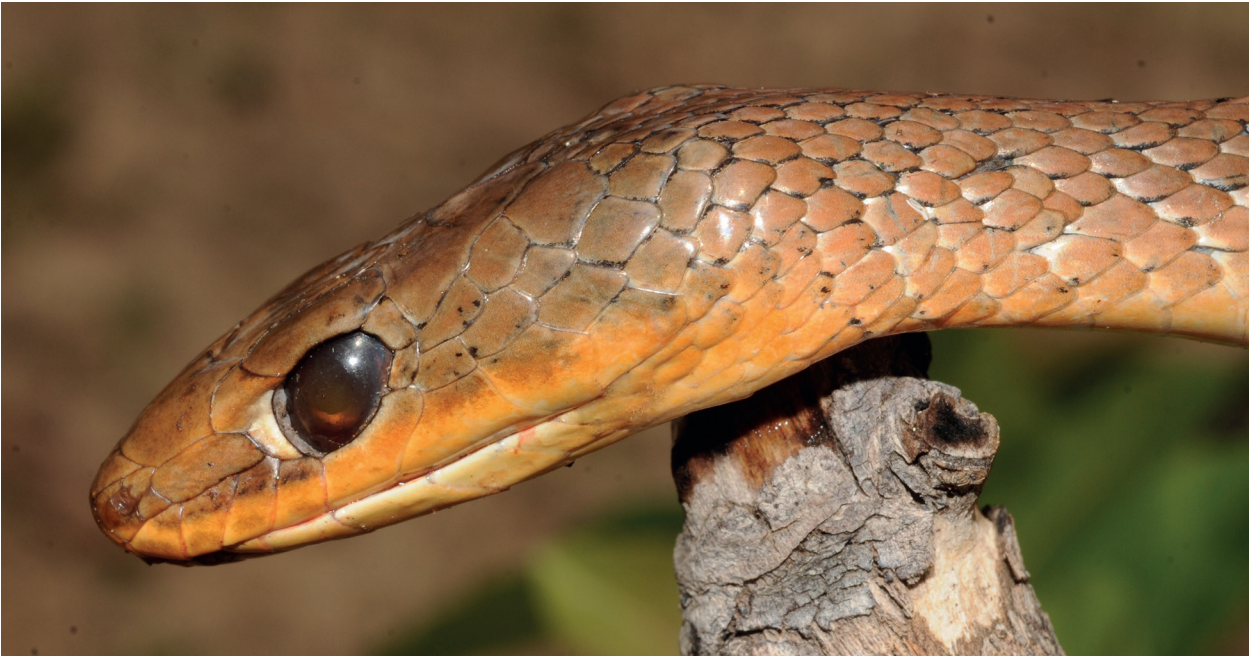
Fig. 7. Psammophis mossambicus . Orange throat phase. Sequenced specimen 2186.N. Baïbokoum (Chad).