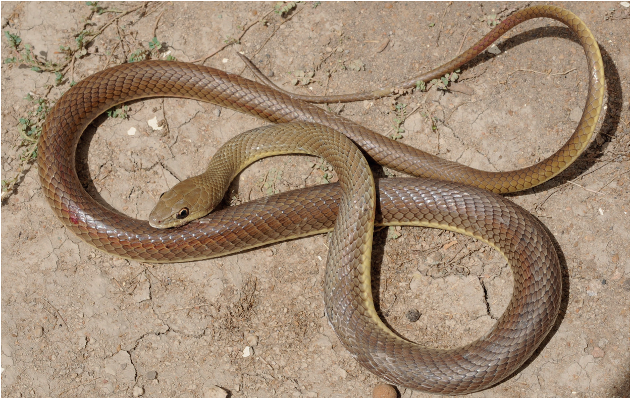
Fig. 2. Psammophis rukwae . Plain phase. Sequenced specimen IRD 2002.N. N'Djaména (Chad).