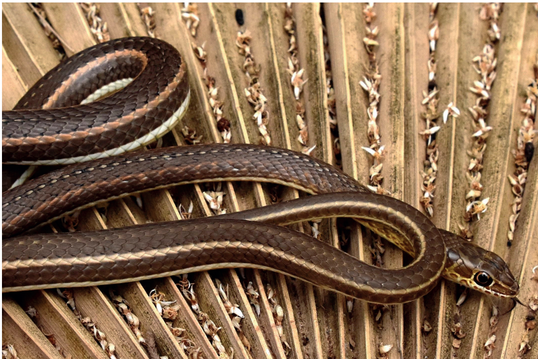
Fig. 5. Psammophis afroccidentalis sp. nov. Lineated phase. Dakar (Senegal).