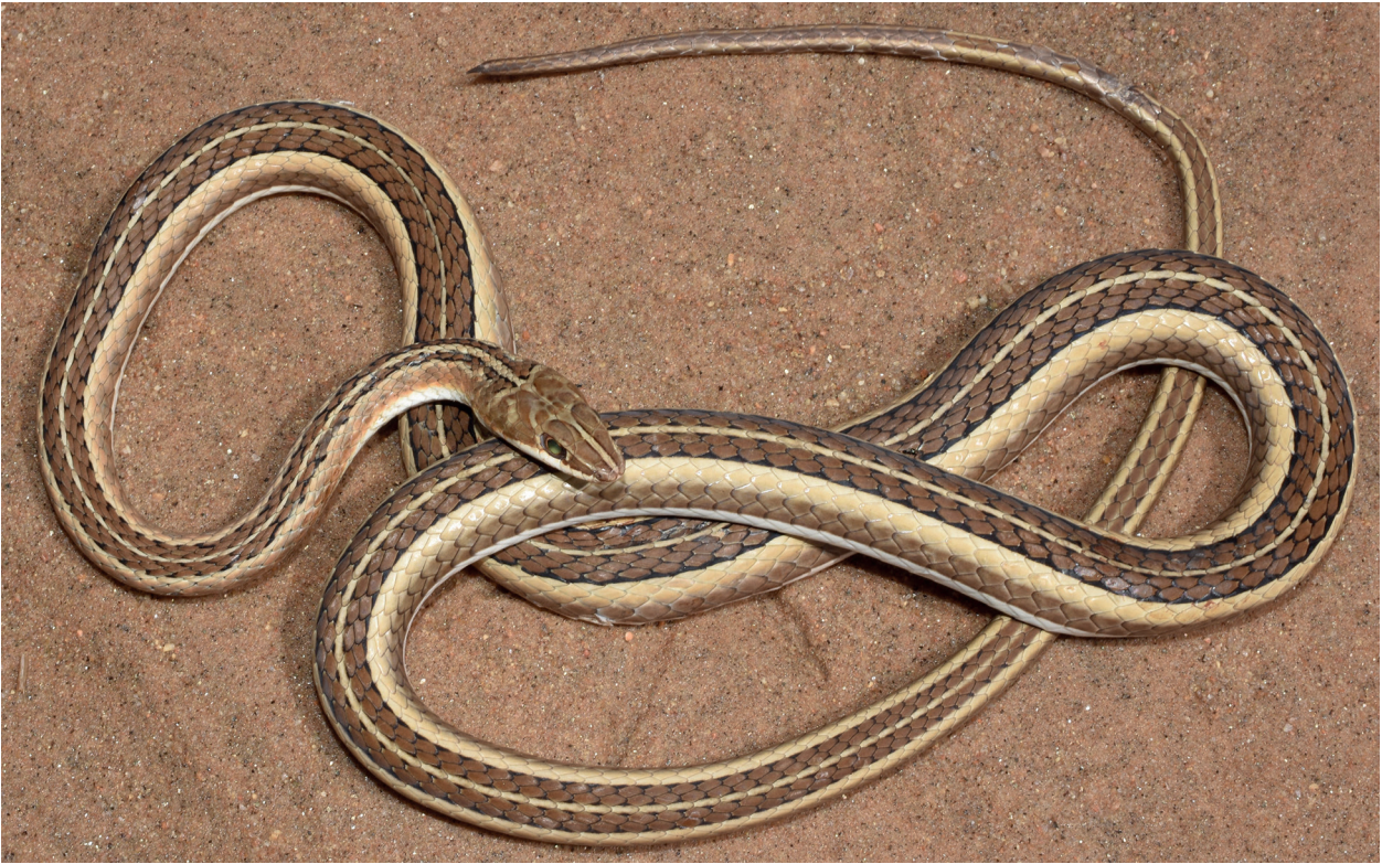
Fig. 19. Psammophis sudanensis . Bitea (Chad). Specimen with a typical head and dorsal pattern.