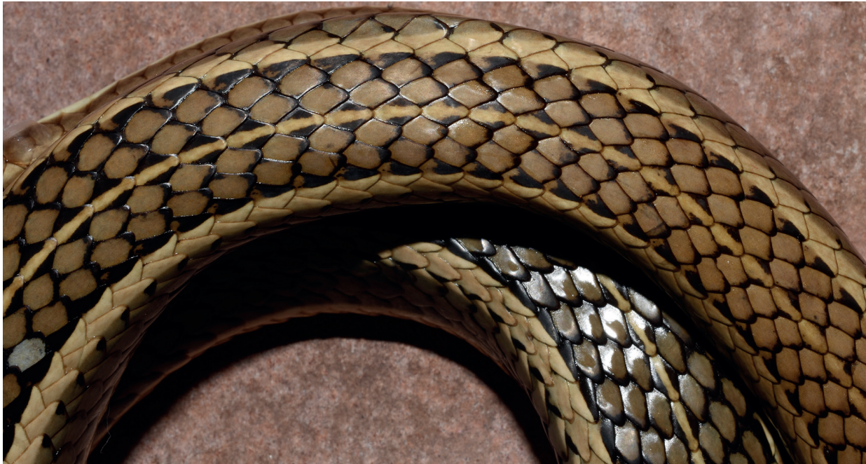
Fig. 11. Psammophis sibilans . Lineated phase. Specimen from Aïn Ghossair near Ismailia, Egypt (MNHN 2001.0601).

a SEM micrograph of a dorsal scale of NMZB 10636 from Ikelenge, Zambia.