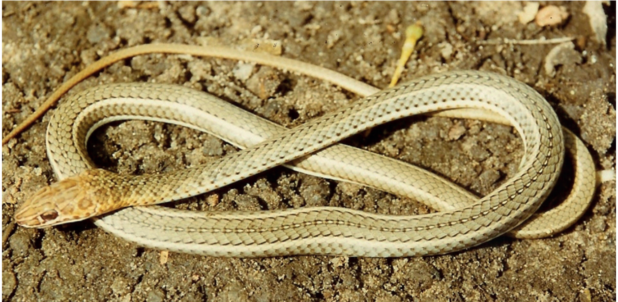
Fig. 17. Psammophis afroccidentalis sp. nov. Juvenile specimen with a vertebral chain and pale dorso-lateral stripes. Dakar, Senegal.