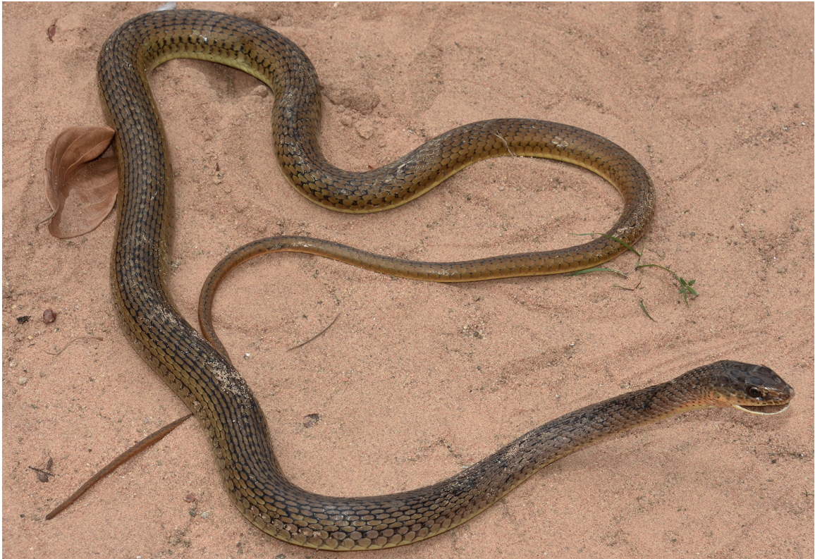
Fig. 21. Psammophis phillipsi . Sequenced specimen IRD 5002.G. Kindia (Guinea).