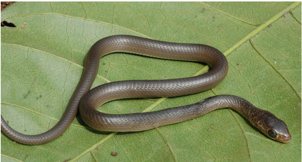
Fig. 20. Psammophis phillipsi . Mt Nimba (Guinea).