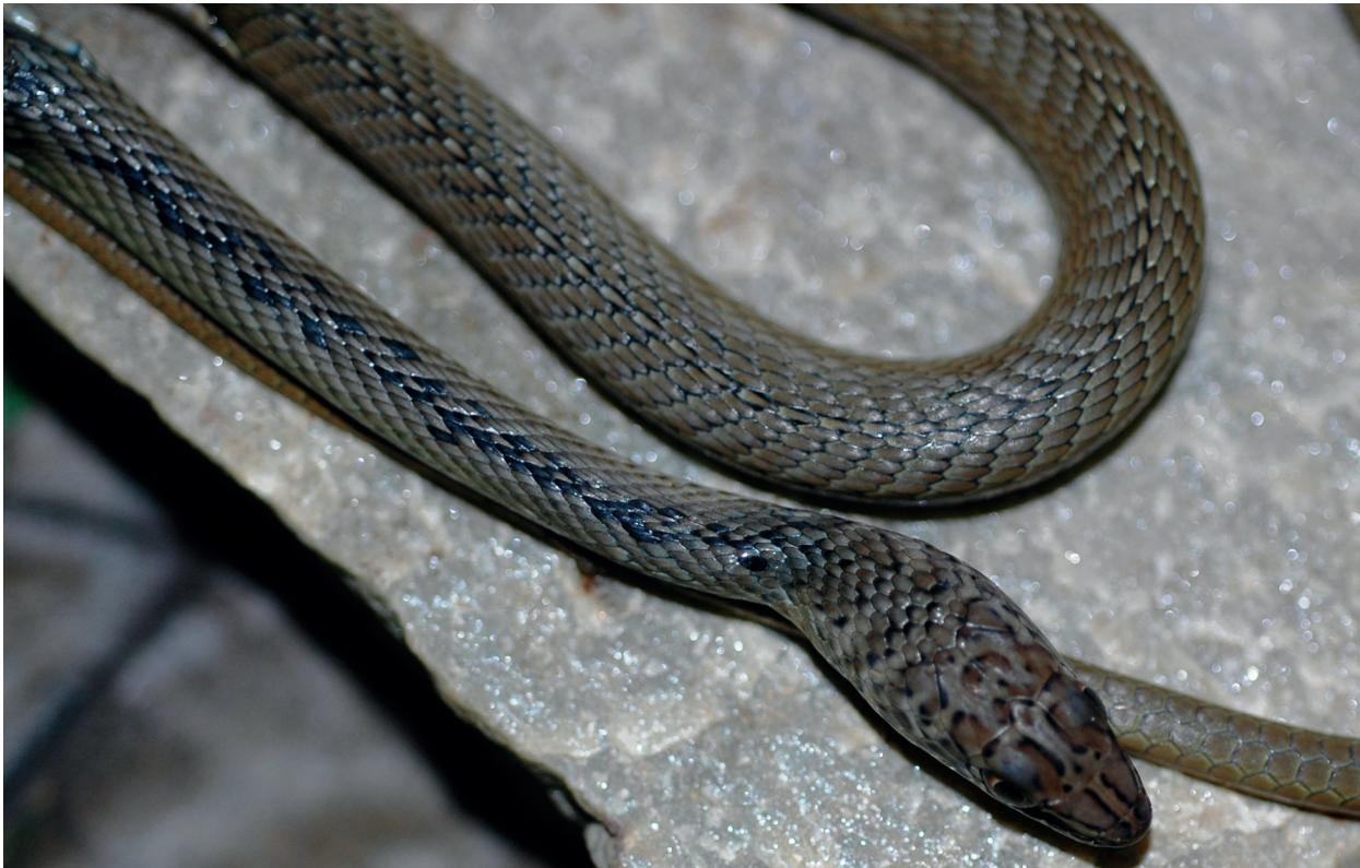
Fig. 6. Psammophis phillipsi “irregularis”. Sequenced specimen IRD 44.T. Vicinity of Kpalimé (Togo).

Remarks. Brandstätter (1995) and Hughes (1999) first restricted the name P. phillipsi to the uniform olive form with an entire cloacal shield in West Africa, where it occupies forest clearings and moist savanna. Our molecular data also support this view for the occasional West Af-