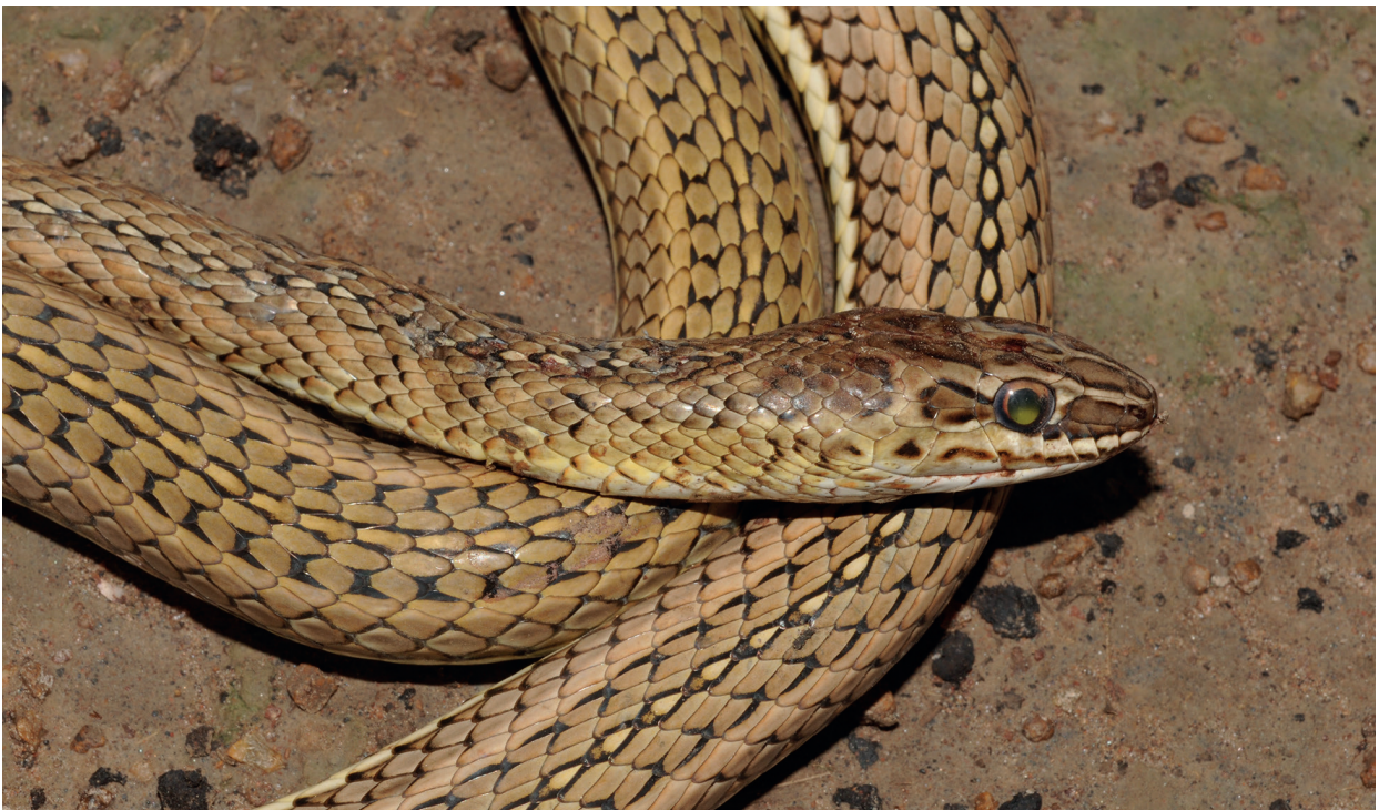
Fig. 3. Psammophis rukwae . Lineated phase. Sequenced specimen IRD 2150.N. Baïbokoum (Chad)