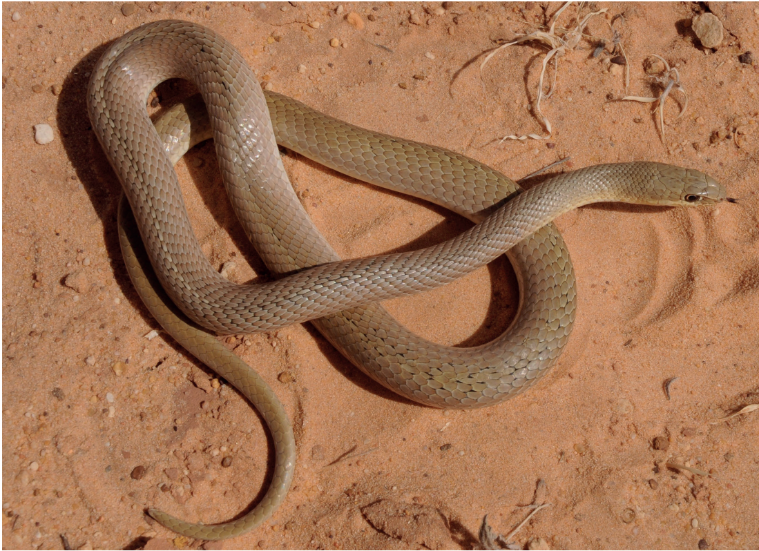
Fig. 4. Psammophis afroccidentalis sp. nov. Plain phase. Sequenced specimen IRD TR.4501. Matmata (Mauritania).