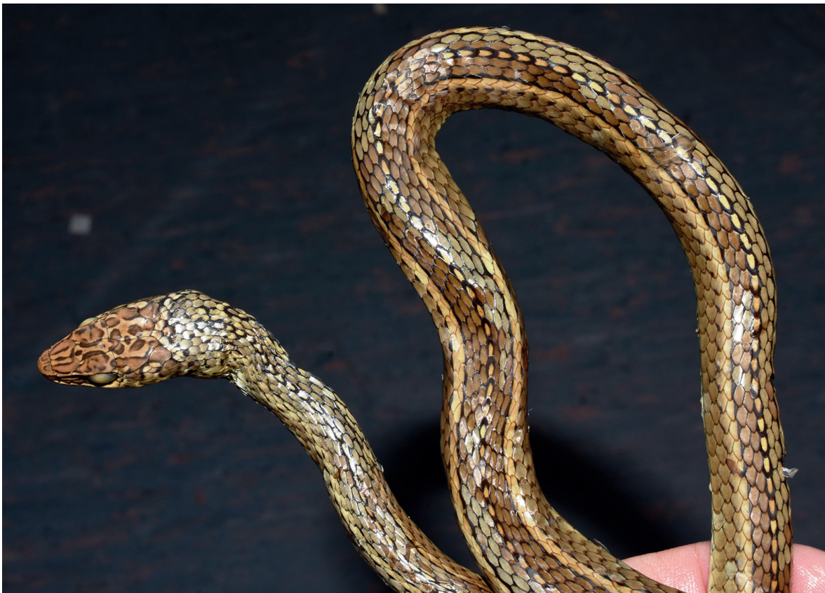
Fig. 8. Psammophis mossambicus . Typical specimen from Pointe Noire area (Republic of Congo) with a head reticulated pattern, a vertebral chain and a pale dorso-lateral stripe (MNHN 1988.2316).