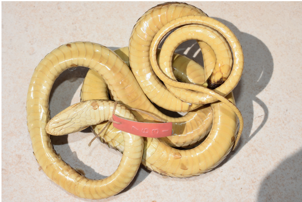
Fig. 14. Psammophis afroccidentalis sp. nov. Ventral view of the holotype MNHN 2018.0013 from Dakar, Senegal.