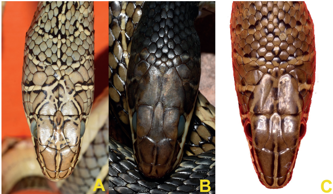
Fig. 9. Psammophis sibilans . Dorsal view of the head of BM 1897.10.28.603 from Abassiyeh near Cairo, Egypt (A), MNHN 2001.0601 from Ain Ghossair near Ismailia, Egypt (B), and AUZC.R02262 from Qalubiya near Cairo, Egypt (C). Note the black edged yellow median line starting from the snout which is not forking then bordering the frontal as observed in Psammophis afro-cidentalis sp. nov. and P. rukwae .