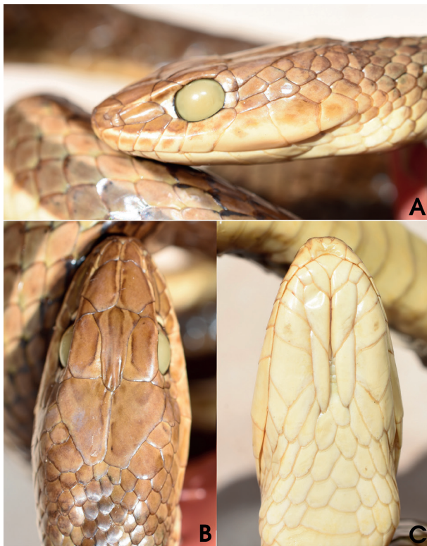
Fig. 15. Psammophis afroccidentalis sp. nov. Lateral (A), dorsal (B) and ventral (C) view of the head of the holotype MNHN 2018.0013 from Dakar, Senegal.