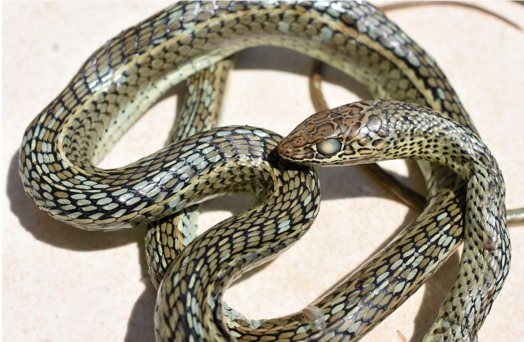
Fig. 23. Psammophis mossambicus . Sequenced specimen LC.4366. Gamba (Gabon).