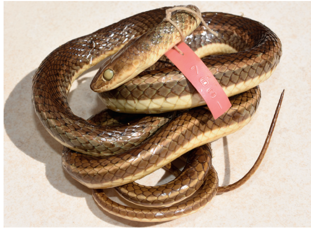
Fig. 13. Psammophis afroccidentalis sp. nov. General view of the holotype MNHN 2018.0013 (formerly IRD 7631.S) from Dakar, Senegal.