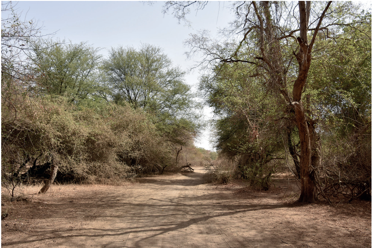
Fig. 3. The Sahelo-Sudanese savanna in eastern Chad (11°45'N / 21°10'E) near Bahar, Hileborno and Mahargal study villages. The most common species collected in this area were Psammophis rukwae , Psammophis sudanensis , Crotaphopeltis hotamboeia , Echis leucogaster and Atractaspis watsoni .

Other specimens (coll. MNHN): Fort-Lamy (4), Mayo-Kebbi (1).