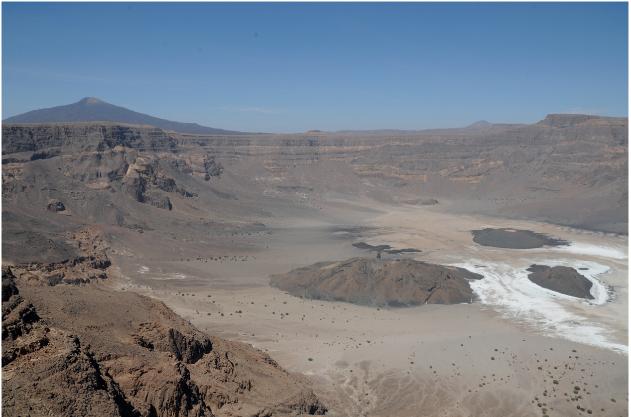
Fig. 6. The Tibesti mountains near the Pic Toussidé (3315 m) in the background and the caldera of the Trou du natron in the foreground (20°57'N, 16°33'E). Snake species currently known from the Tibesti include Echis leucogaster , Cerastes cerastes , Cerastes vipera , Psammodphis aegyptius and Platycephalus saharicus .