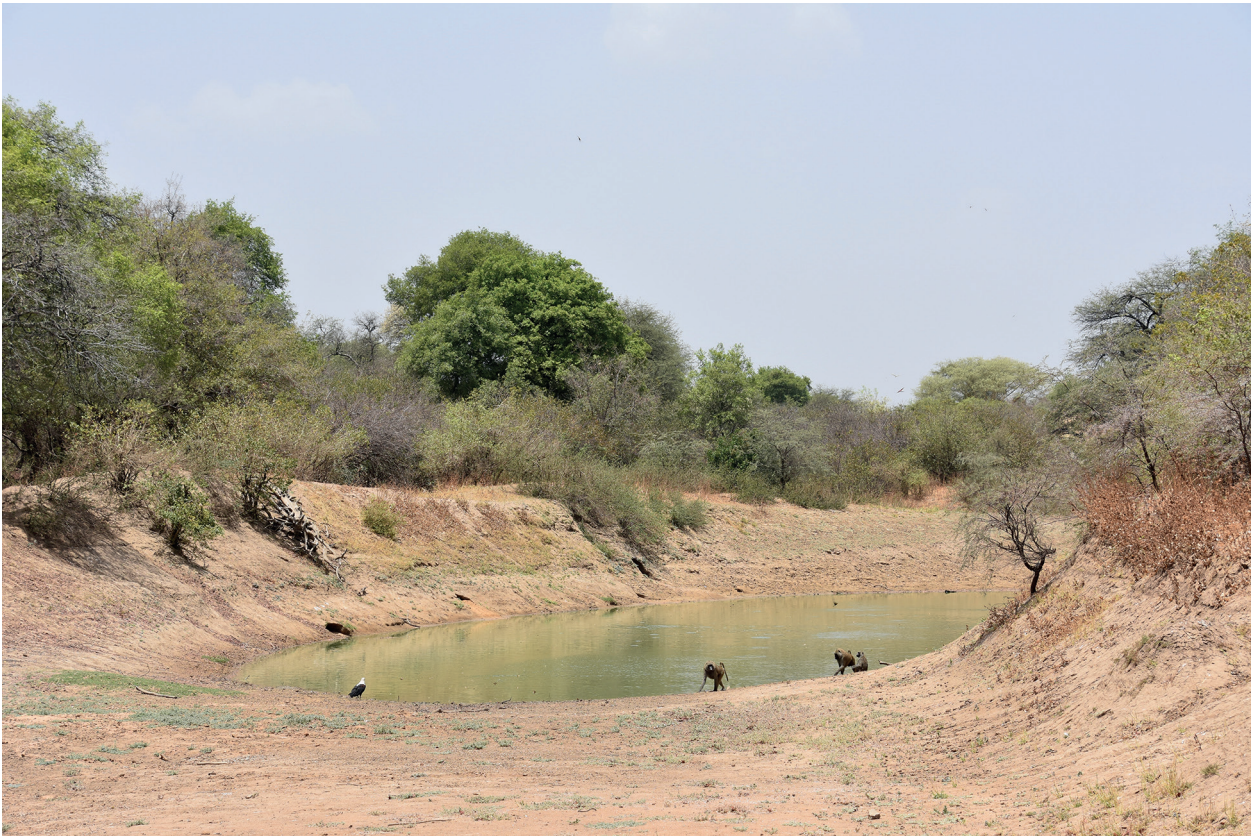
Fig. 4. The Sudan Savanna and Salamat River at Zakouma National Park during the dry season (10°50'N, 19°47'E). Three study villages (Djarat Abounimir, Bon Amdaoud and Kiéké) were located at the eastern, western and southern limits of the park, respectively, where 25 snake species were collected.

Myriopholis lanzai Broadley, Wade & Wallach, 2014