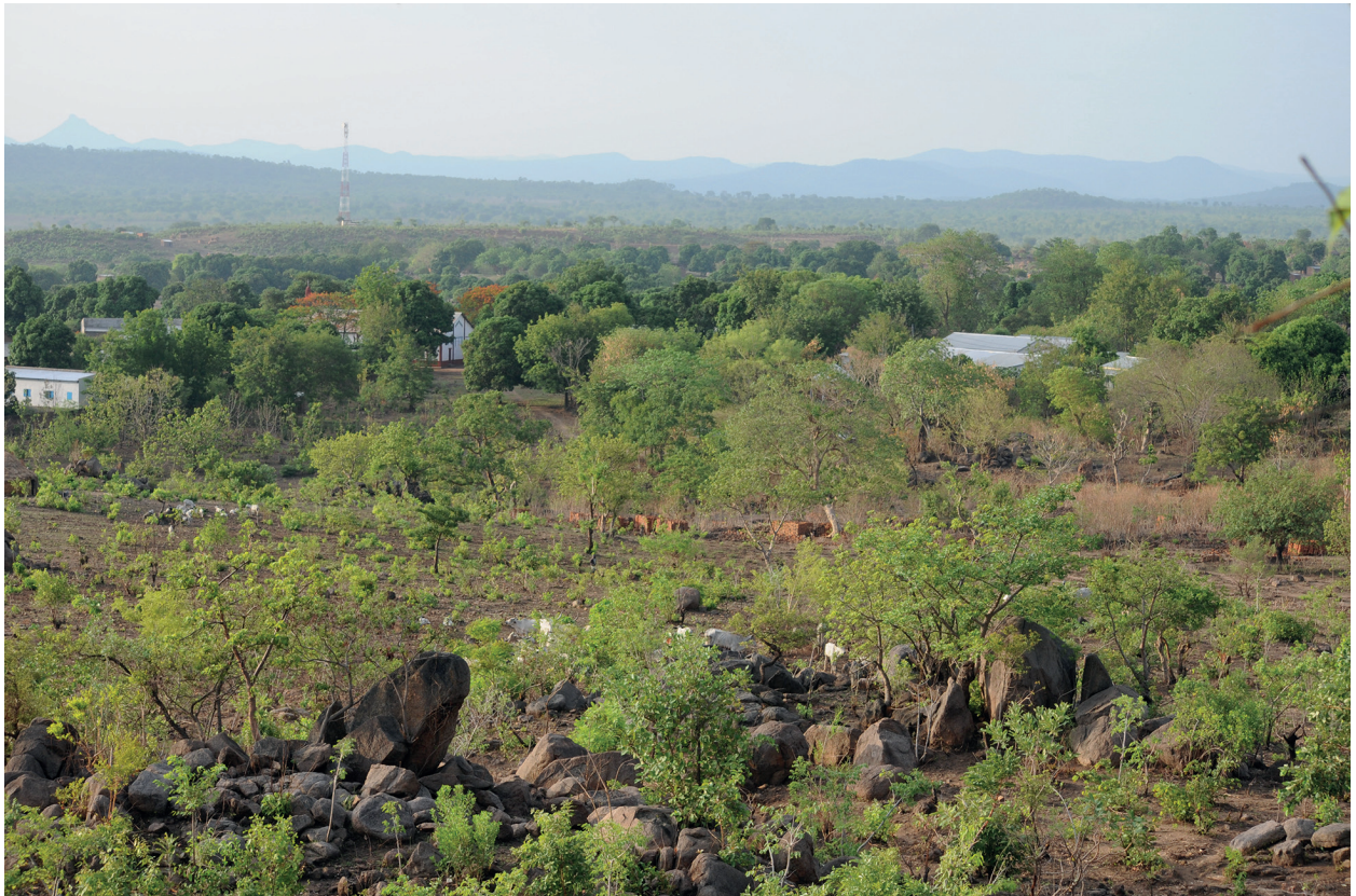
Fig. 8. View of Baïbokoum area where 40 species of snakes were collected within only ten days. The Logone occidentale River is in the background, the rocky hill that dominates Baïbokoum is in the foreground (07°44'N, 15°40'E).

Localities: Baïbokoum (1), Moïssala (1), Moundou (1). Other specimen (coll. MNHN): Maillao (1).