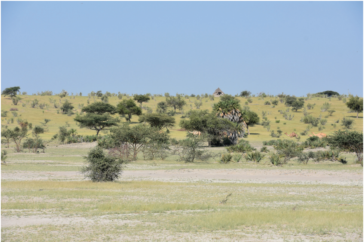
Fig. 2. The Sahel near Lake Chad at the end of the rainy season (13°48'N, 15°46'E). Psammophis sudanensis was the most abundant species at this latitude as in most other Sahelian and Sudano-Sahelian areas of Chad. The other common species between 13°N and 14°N were Psammophis rukwae , Eryx colubrinus , Atractaspis watsoni , Boaedon subflavus , Naja haje and Echis leucogaster .

between 13°00'N and 15°00'N, and seven north of 15°00'N (Fig. 7), where average annual rainfall ranges approximately from 1,300–1,100 mm, 1,100–800 mm, 800–400 mm, 400–200 mm, and 200–<5 mm, respectively (Mahé et al. 2012).