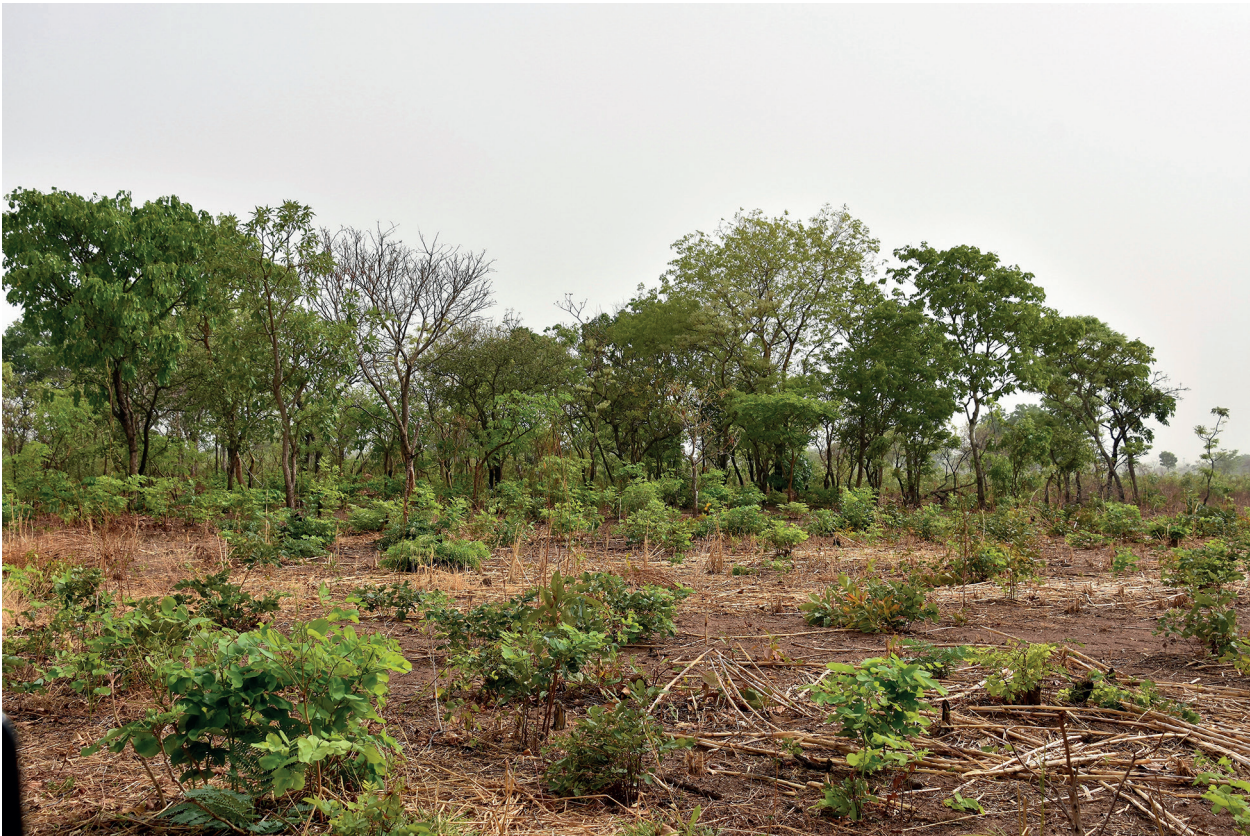
Fig. 5. The Sudano-Congolese savanna in southern Chad near Moïssala is strongly impacted by agricultural activities (08°05'N, 17°40'E). The most common snake species were Psammophis mossambicus , Psammophis sudanensis , Naja nigricollis and Lycophidion semicinctum .

Literature records: Gounou-Gaya, Bongor (Roussel & Villiers 1965), Fort-Lamy, Bahr-el-Ghazal (Graber 1966).