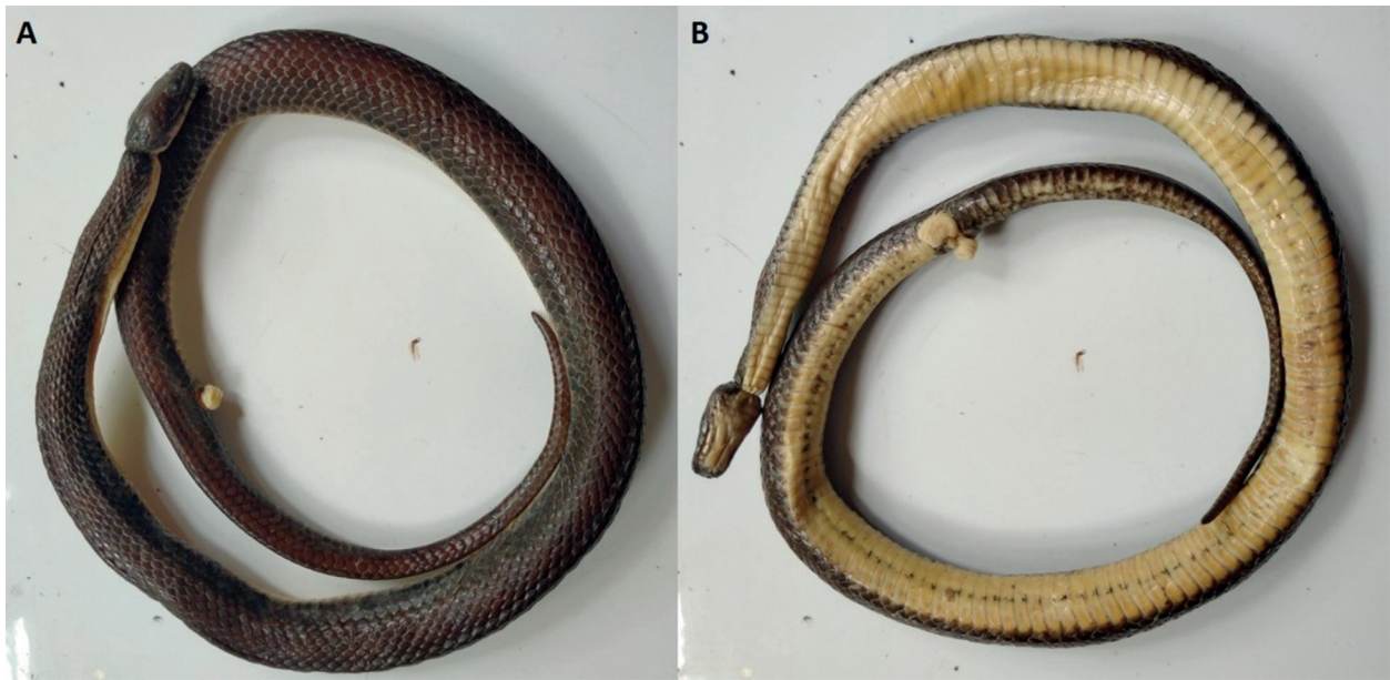
Fig. 2. Trimerodytes yapingi (Guo, Zhu & Liu, 2019) (NUOL R.2020.15), adult male (preserved) from Laos. A. Dorsal view. B. Ventral view.

ensis Rao & Yang, 1998 and T. aequifasciatus (Barbour, 1908) with a bootstrap value of 72. Within clade A, Trimerodytes praemaxillaris Angel, 1929 and T. yapingi Go,