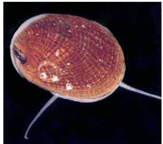
4: S. briandi : in situ