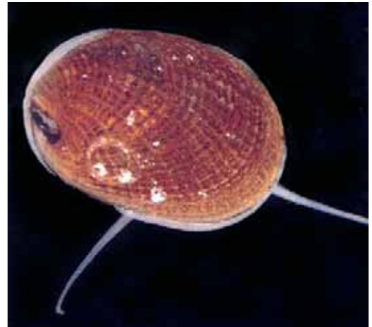
4: S. briandi : in situ