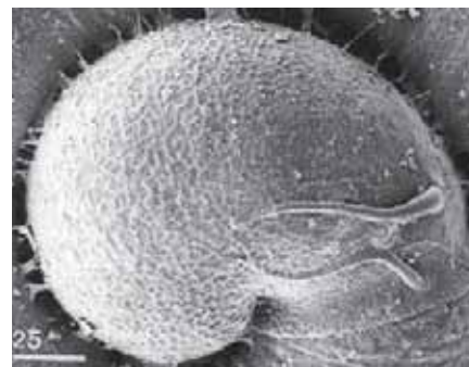
4: L. vitreus : close-up of protoconch of the same paratype; from WARÉN & BOUCHET (1989).