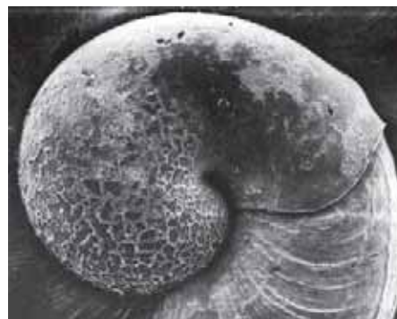
2: Protoconch; after WARÉN & BOUCHET (1993).