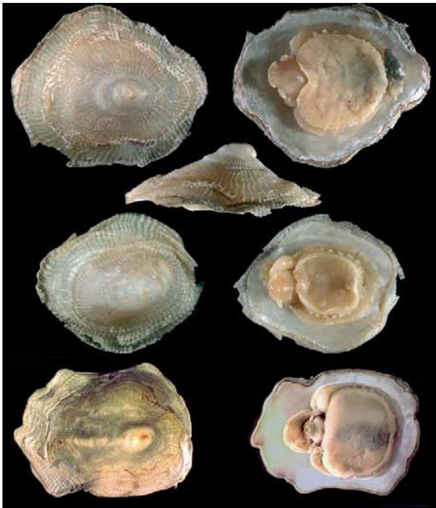
1: S. regularis

Biology: Symmetromphalus regularis occurs in dense aggregations on the walls of vents; the species at Lau and Fiji lives on mussels and on the subsutural ramp of Ifremeria nautili . Endemic to vents. Sexually dimorphic, with males much smaller. Feeding biology not known. Pallial furrow and especially epipodial tentacles with growth of large filiform bacteria. Larval development lecithotrophic with planktonic dispersal stage.