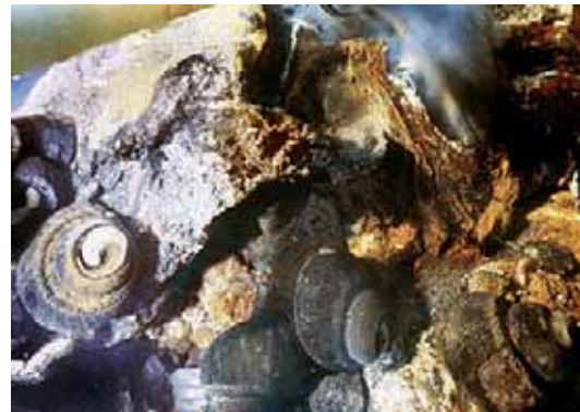
2 top: Living specimens in situ, inhabited by limpets Olgasolaris sp.; bottom: Left; right.