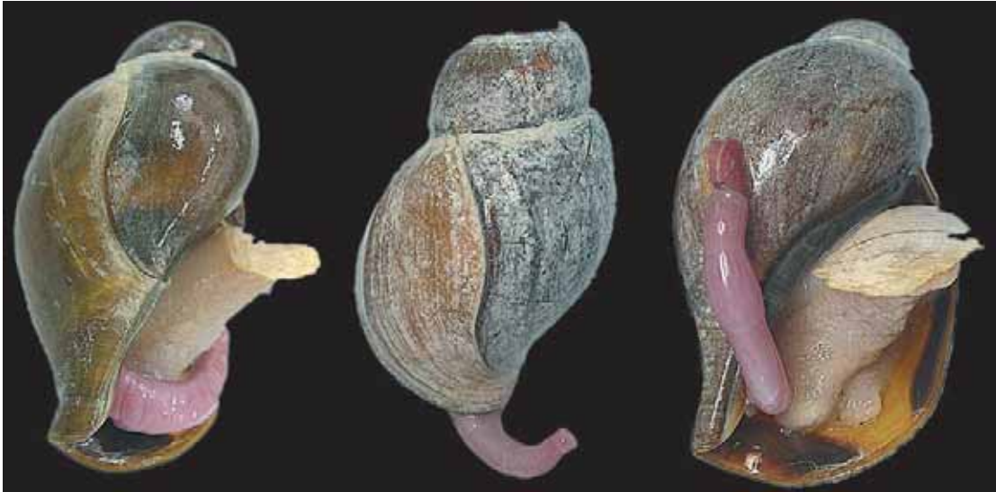
2: E. auzendei, in vivo specimens