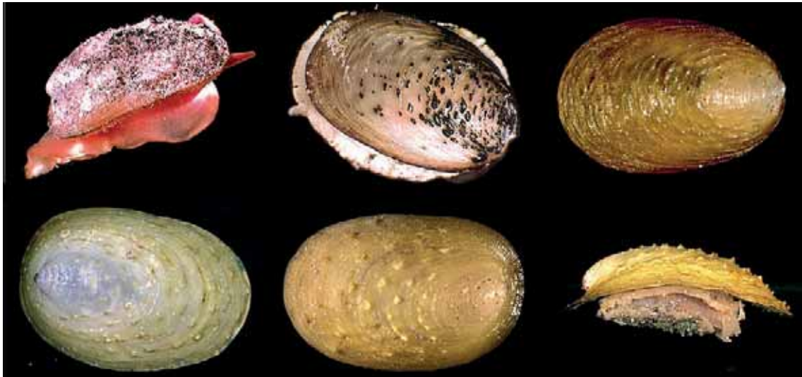
3: N. subnoda top middle and right; bottom left and middle; bottom right is N. heminoda ; by P. Briand © Ifremer.