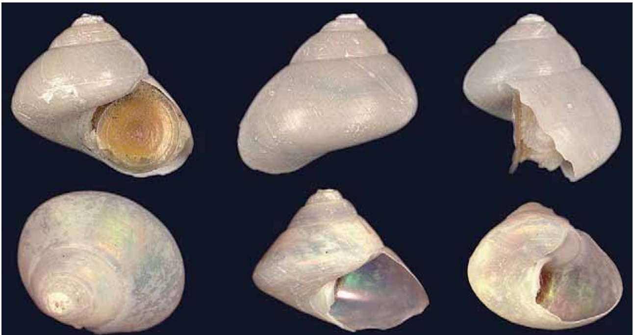
1 top: Specimen 1, apertural, abapertural and lateral view by A. Le Goff © MNHN; bottom: Specimen 2, inclined dorsal view, apertural view, inclined basal view; by P. Briand © Ifremer.

Distribution: East Pacific Rise: 13°N and 21°N.