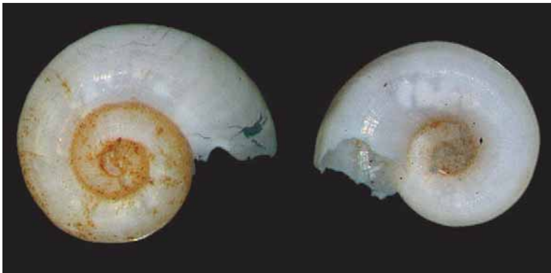
1: Two specimens: left dorsal view, right ventral view; by A. Warén.

Distribution: Mid-Atlantic Ridge: Menez Gwen and Lucky Strike. Another species, Xylodiscula major WARÉN & BOUCHET, 1993 was collected from North Fiji Back-Arc Basin.