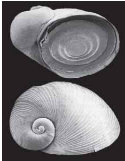
3: L. vitreus , top holotype, apertural view, 2.4 mm; bottom paratype, apical view, 2.2 mm; from WARÉN & BOUCHET (1989).