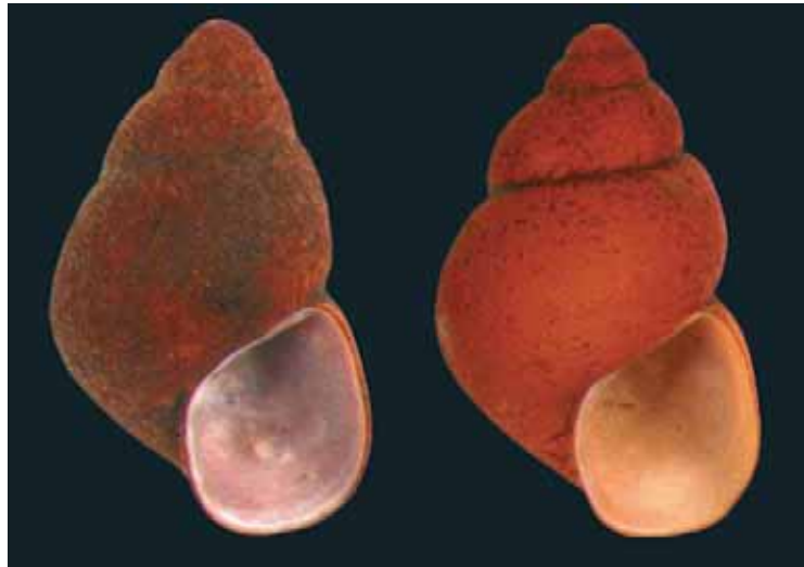
1: The same specimen with and without ferruginous layer; scale bar 0.5 mm; by A. Warén.

Distribution: Mid-Atlantic Ridge: Menez Gwen to Rainbow. Genus also known from Japan ( Laeviphitus japonicus OKUTANI, FUJIKURA & SASAKI, 1993) and the Marianas (unpubl.). Larvae common at the East Pacific Rise: 13°N, but no juvenile or adult specimens have been found.