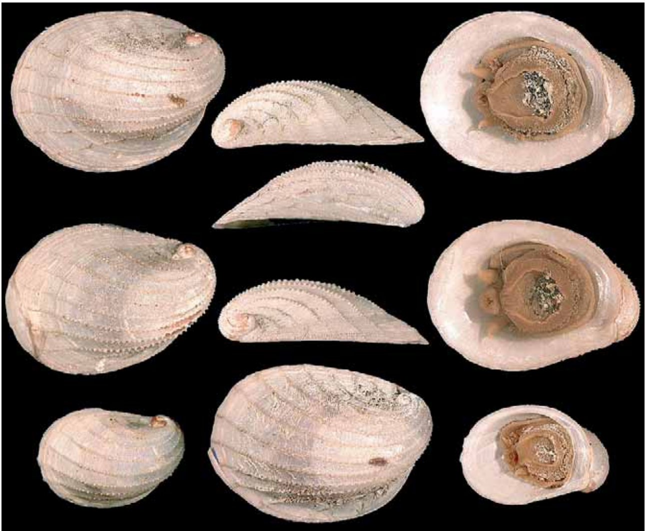
1: Several specimens