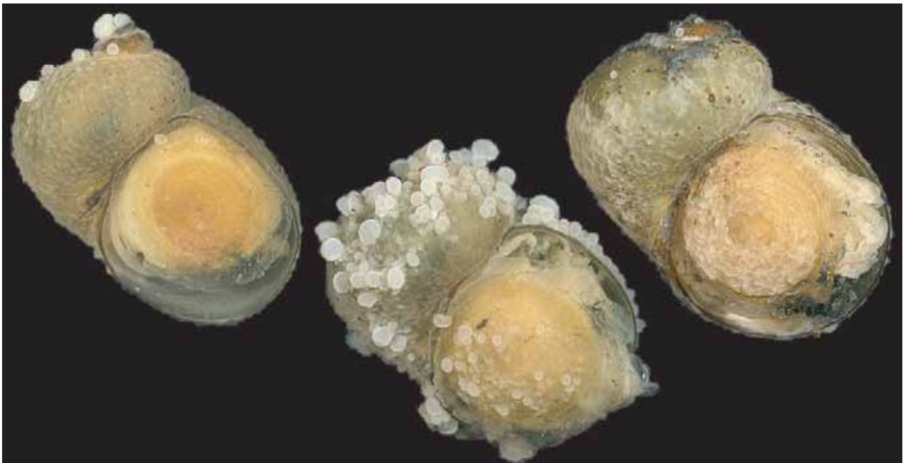
1: Several specimens; by R. von Cosel © MNHN.