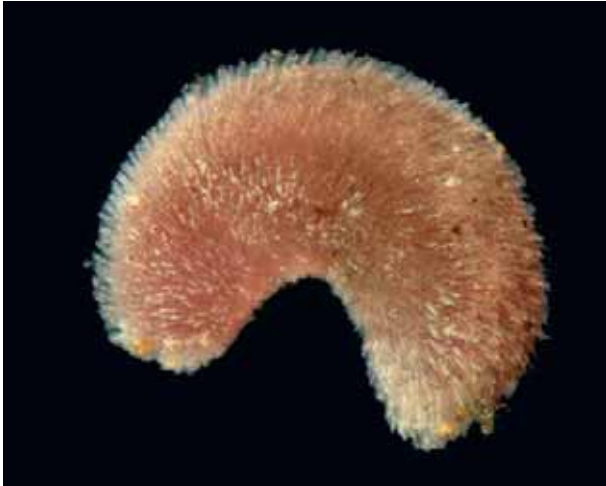
2: H. cf. acredema , in vivo specimen from East Pacific Rise: 9°N, site Tica; by M. Bright.