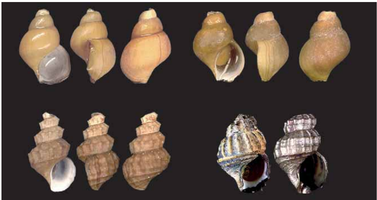
1 top left: P. laevis ; top right: P. variabilis ; bottom left: P. ios ; bottom right: P. buccinoides