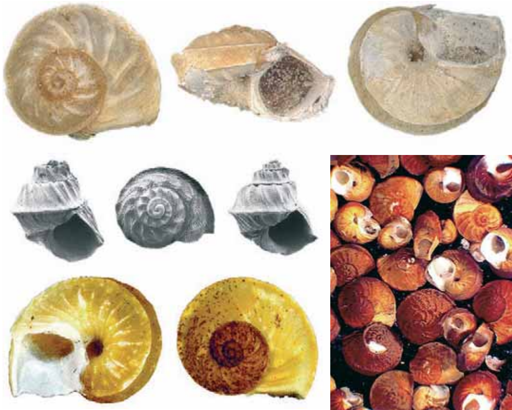
1: Top: M. aurantiaca ; middle: M. aurantiaca ; bottom: M. galeronae

Biology: Genus with three species endemic in vents. The species are locally common in washings of Riftia , Ridgeia , Calyptogena and Alvinella . Genus endemic to vents. Food consists of the detrital surface layer of the bottom. Larval development lecithotrophic with planktonic dispersal stage.