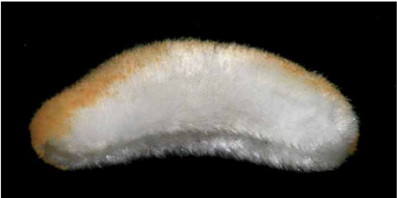
1: Helicoradomenia sp. 2 from southern East Pacific Rise: 21°S; cruise Biospeedo © Ifremer.

Recorded hot vent Solenogastres range between 1.5-6 mm length and are – characteristically for all aplacophoran molluscs – covered by small aragonitic sclerites. Because these sclerites are important specific as well as supraspecific characters, the collected animals should be preserved in 70% ethanol (or in formalin and soon transferred to ethanol) to save the sclerites for determination. Furthermore, specimens should be preserved as soon as possible after sampling, because internal organs (as important as the sclerites) rapidly undergo histolysis (as was the case in quite a number of specimens from the above records).