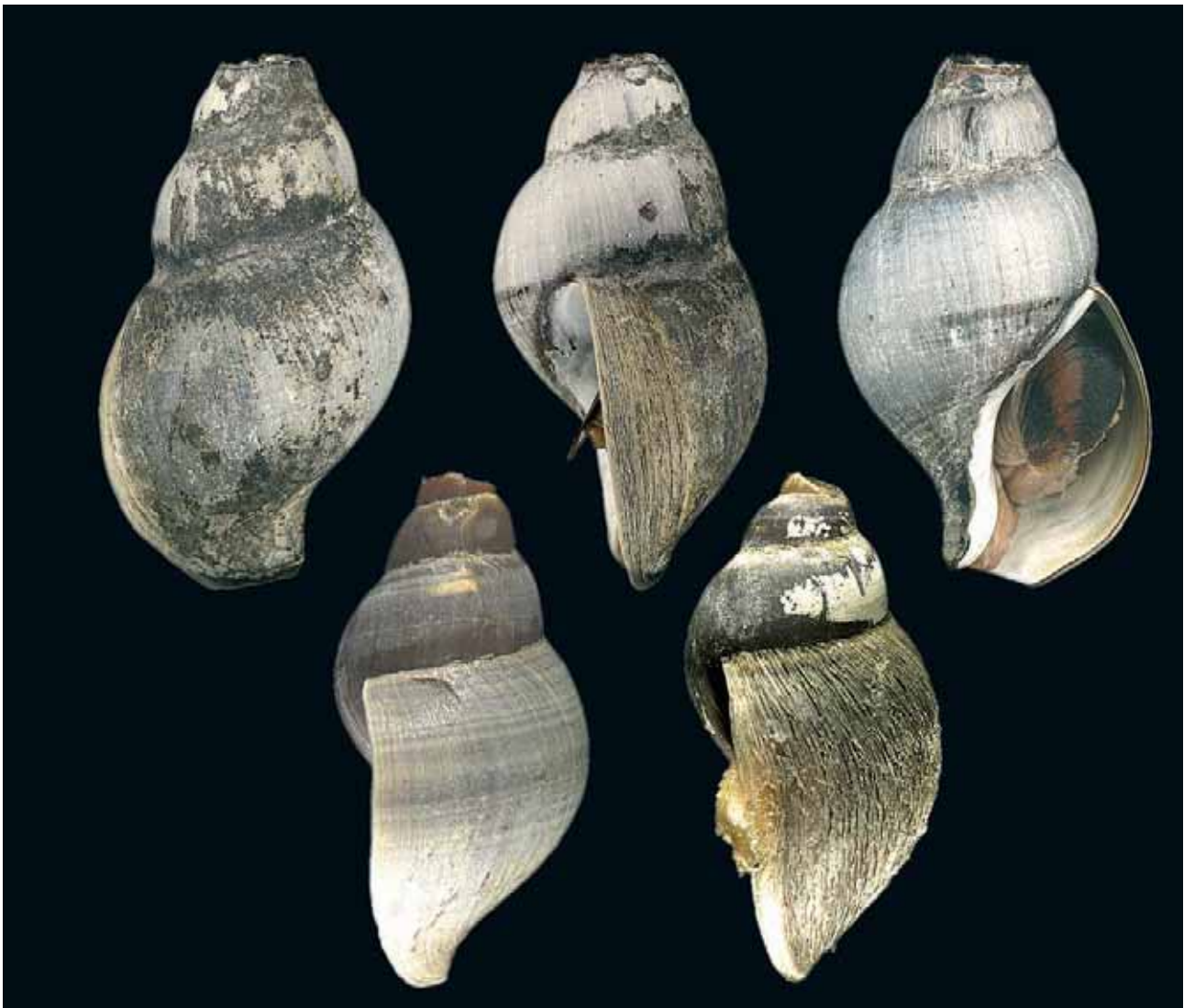
1: E. desbruyeresi ; top left to right: Abapertural, lateral and apertural view; bottom: Lateral views; by R. von Cosel & P. Lozouet.

Biology: A small radiation of buccinids living at vents; provisionally placed in the genus Eosipho , a genus known from sunken drift wood and normal bathyal environments. A related species lives at Caribbean seeps. Buccinidae are carnivorous or scavengers and E. desbruyeresi has been collected in quantity in baited traps.