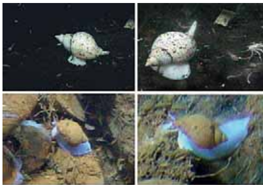
3: Phymorhynchus sp. from East Pacific Rise: 18°S, cruise Biospeedo ; middle: Phymorhynchus sp. from Juan de Fuca Ridge; bottom: Larva from Juan de Fuca Ridge