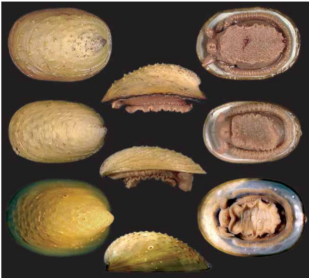
1 top: N. heminoda ; middle: N. subnoda ; bottom: N. rigneae. All with exterior, interior and lateral view.

Biology: Closely associated with black smokers, recovered from aggregations of Alvinella . Genus endemic to East Pacific Rise vents. Larval development lecithotrophic with planktonic dispersal stage.