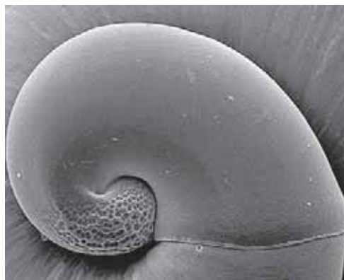
3: H. umbellifera , early protoconch; A. Warén.