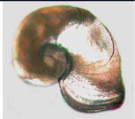
2: Larva; by courtesy of L. Mullineaux.