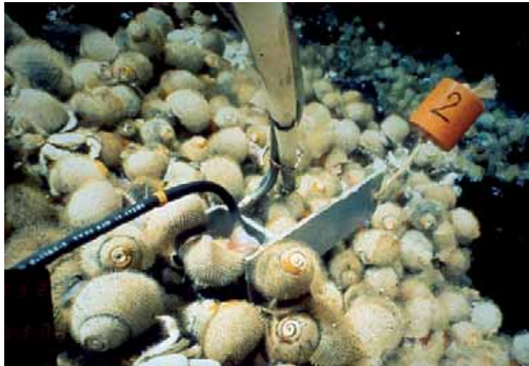
4: In situ population at Lau Back-Arc Basin; Biolau cruise © Ifremer.