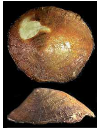
2: Habitus