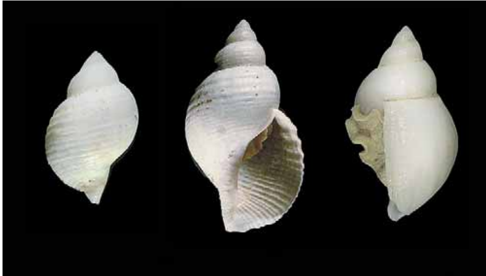
2 left to right: One specimen of P. major from East Pacific Rise 13°N, and two specimens of P. starmeri from North Fiji Back-Arc Basin