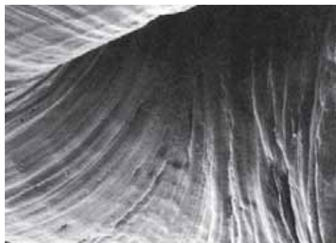
3: Umbilicus; after WARÉN & BOUCHET (1993).