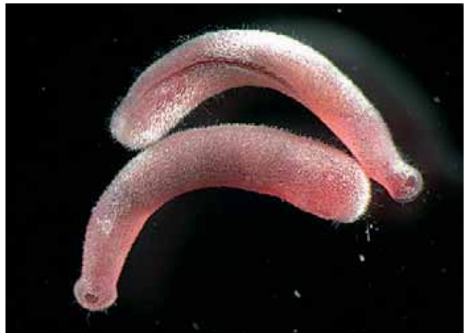
7: Two specimens of Simrothiellidae sp. in vivo from North Fiji Back-Arc Basin, site White Lady; cruise TUIM06MV (June 2005, MBARI) © G. Rouse.