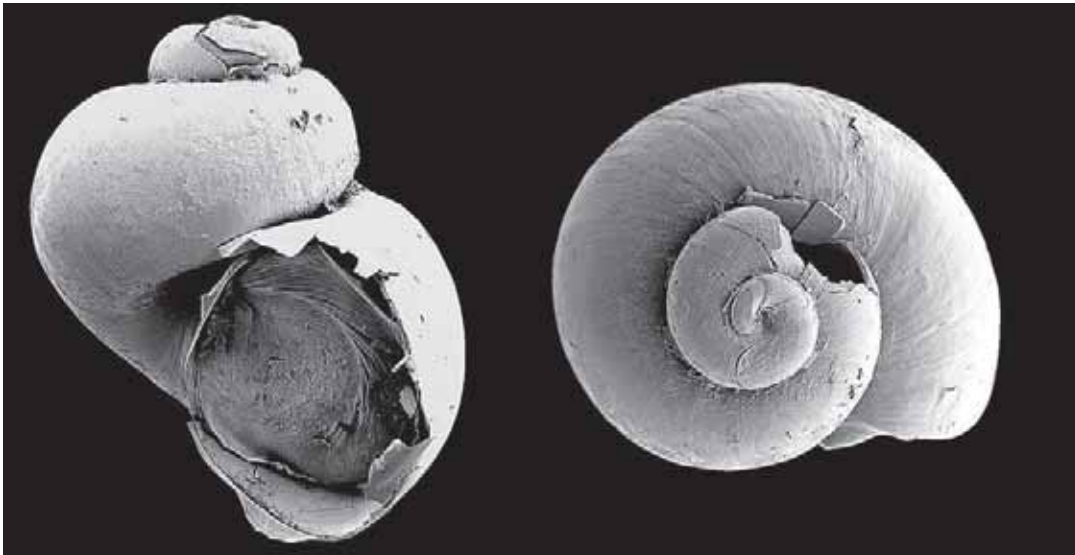
1: H. globularis, apertural and dorsal view of a specimen; Juan de Fuca Ridge, Endeavour Segment, Clam Bed

Biology: Epifaunal grazers. Genus known from vents, seeps, whalebone and driftwood. Development unknown.