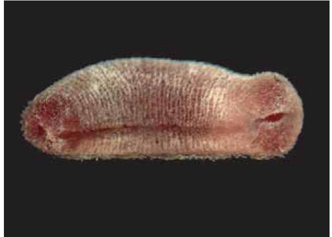
3: Helicoradomenia sp. 1, in vivo specimen from East Pacific Rise: 9°N, site Tica; by M. Bright.