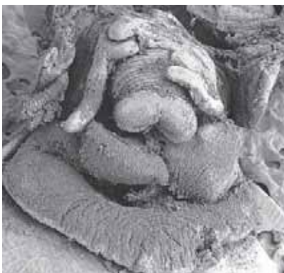
2: H. globularis , critical point dried specimen; front view of head-foot, shell and pallial skirt removed; Juan de Fuca Ridge, Endeavour Segment, Clam Bed; by A. Warén.