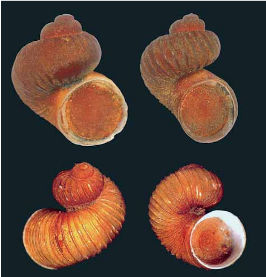
1 top: Apertural view of two specimens of L. costatus ; by A. Warén; bottom: Same species; by P. Briand.

Biology: On soft bottom and among Bathymodiolus . Genus endemic to vents. Stomach contains amorphous organic material but rarely sponge spicules, crustacean remains. Larval development lecithotrophic with planktonic dispersal stage.