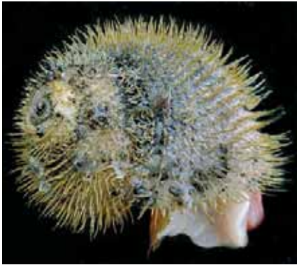
1: Apertural view; by P. Briand © Ifremer.

Distribution: A single morphospecies in the Western Pacific: Mariana, North-Fiji and Lau Back-Arc Basins; Indian Ocean: Rodriguez Triple Junction, Kairei hydrothermal field. Nevertheless, A. hessleri from the type location is genetically different from the three Alviniconcha populations collected at other places.