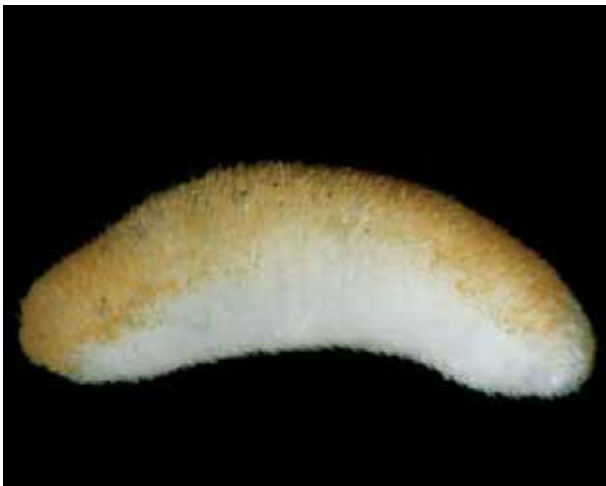
6: Helicoradomenia sp. 3, body length 2.3 mm, lateral view (anterior at left), mantle with incrustation by yellow-orange deposits; from East Pacific Rise: 21°S; cruise Biospeedo © Ifremer.