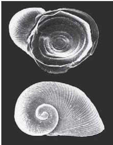
1: L. exquisitus , top specimen 1, apertural view, 3.4 mm; bottom specimen 2, apical view, 2.3 mm; from WARÉN & BOUCHET (1989).

Biology: Near hydrothermal vents on mussel beds or on other hard substrate.