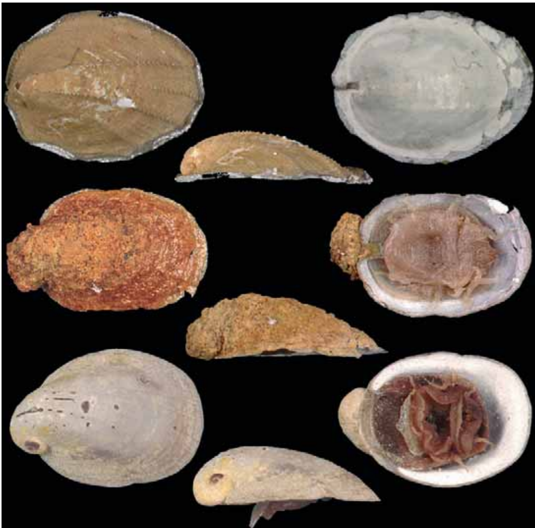
1 top: G. emarginatus ; middle: G. patulus with incrustations; bottom: G. spiralis. All with exterior, interior and lateral view

Biology: Details of habitat unknown. Genus endemic to vents. Larval development lecithotrophic with planktonic dispersal stage