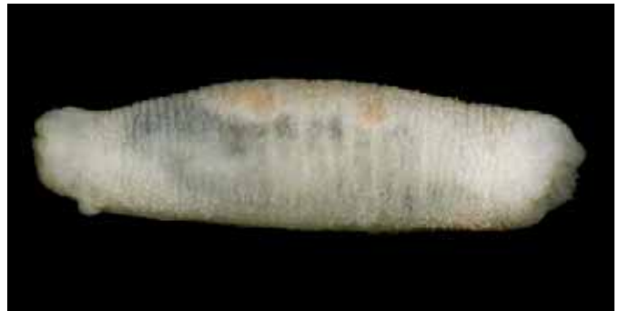
5: Simrothiellidae gen. et sp. 1, body length 3 mm, lateral view, anterior end at left; mantle in part with dorsal incrustation of orange iron oxide; from East Pacific Rise: 13°N, site PP Hot 3 (Elsa); cruise Phare.