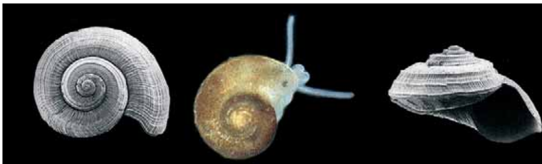
2 left and right: Specimens (SEM); middle: Living specimen