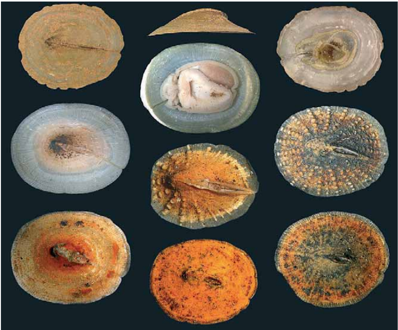
1: P. midatlantica ; top: Dorsal, lateral and ventral view, no precision of origin; middle: Specimen from Logatchev (Mid-Atlantic Ridge), dorsal and ventral view; bottom: specimen from Snake Pit

Biology: On rocks. P. midatlantica also occurs on Bathymodiolus mussels. Genus endemic to vents. Development without planktotrophic larvae.