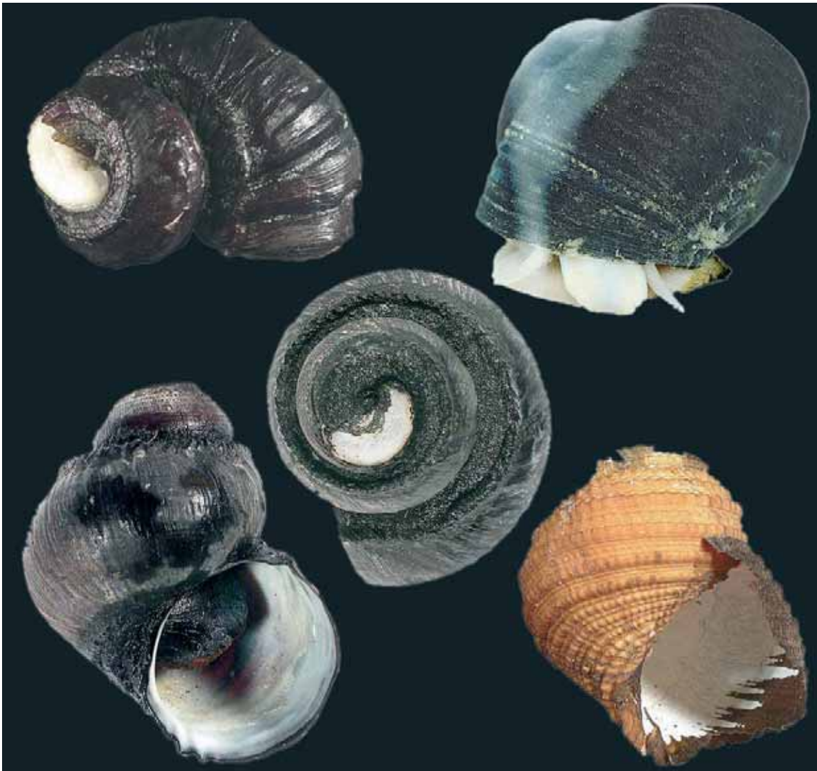
1: Adult specimens, apertural and apical view; juvenile specimens, apertural view; by P. Maestrati.

Distribution: North Fiji, Lau, Manus Back-Arc Basins.