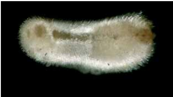
4: Helicoradomenia sp. 2, body length 2 mm, in ventral view, anterior end at left showing slit-like dorsofrontal sensory pit and atrio-buccal area, pedal groove (foot) wide; from East Pacific Rise: 18°S; cruise Biospeedo © Ifremer.