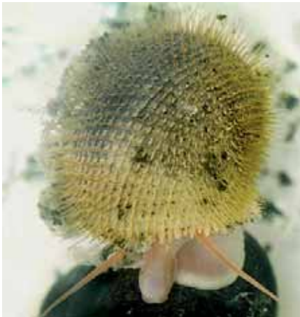
3: In situ specimen in the Lau Back-Arc Basin; Biolau cruise © Ifremer.