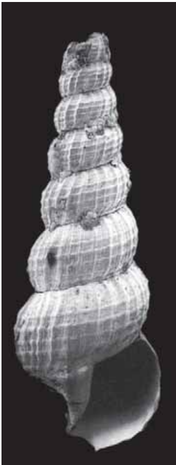
1: Apertural view; after WARÉN & BOUCHET (2001).

Distribution: Northern Pacific, known only from Explorer Ridge: Magic Mountain (Steve 4 vent).