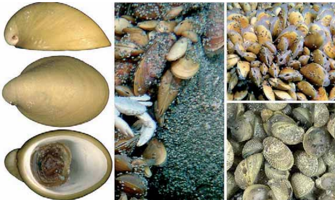
1: L. atlanticus from Mid-Atlantic Ridge; left top to bottom: Exterior, interior and lateral view; by R. von Cosel & A. Le Goff; top right: In situ © Ifremer/Atos; bottom right: P. Briand © Ifremer.

Remark: Different genetic types, probably species, occur, especially of the forms similar to L. elevatus and L. schrolli .