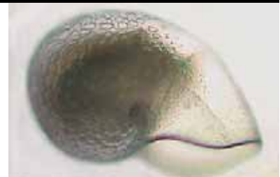
2: Larva; by courtesy of L. Mullineaux.