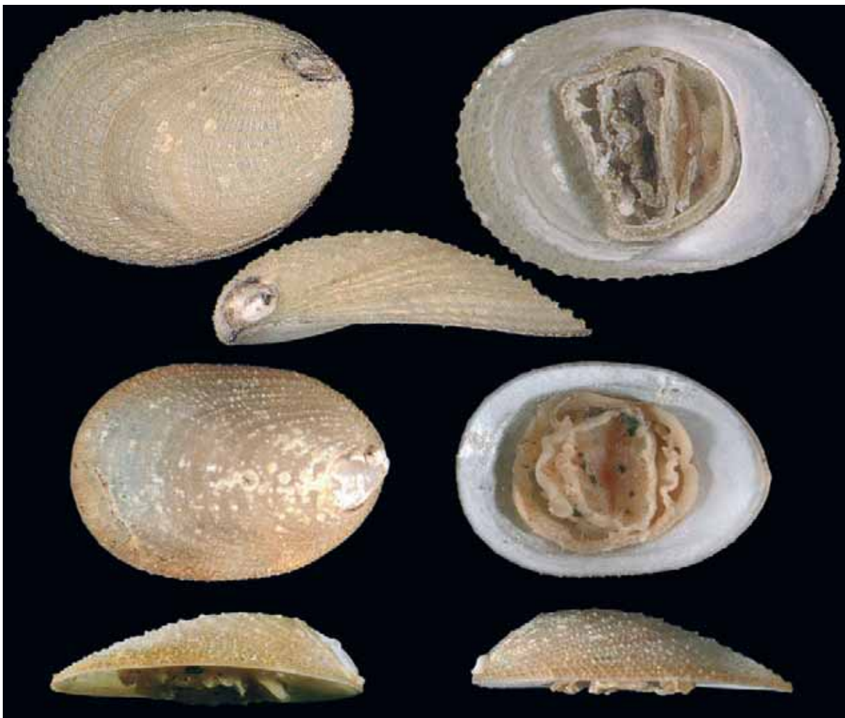
1: S. briandi : exterior, interior and lateral views

Biology: Genus endemic to vents. The reddish colour of fresh animals is probably caused by hemoglobin. Development with planktotrophic larvae. Egg capsules common on shells and other hard surfaces.