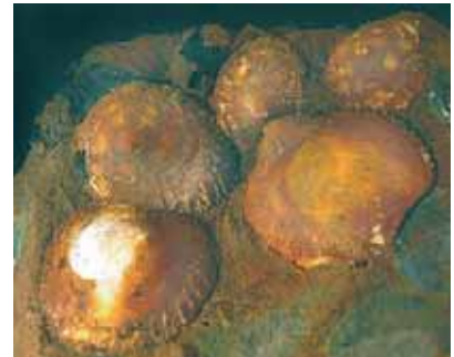
3: In situ specimens, from East Pacific Rise: 13°N © Ifremer.