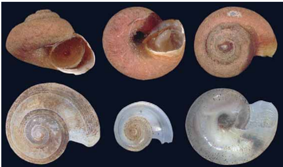
1 top from left to right: Apertural, apical and ventral view of the same specimen; bottom: Three specimens

Distribution: Mid-Atlantic Ridge: Menez Gwen and Lucky Strike. Genus with three species endemic to vents and seeps. One at Lau and Fiji Back-Arc Basins. Lurifax japonicus from Sumisu Caldera, Southern Japan.