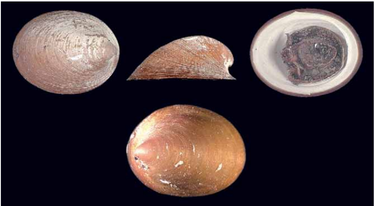
1 top: Exterior, lateral and interior view; by R. von Cosel & A. Le Goff; bottom: Exterior, lateral and interior view; by P. Briand.

Distribution: East Pacific Rise: 21-17°N.