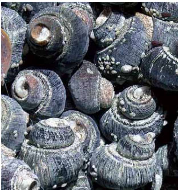
1: Ifremeria nautiliei from Kilo Moana, Lau Back-Arc Basin, TU-IM 07 cruise © C.R. Fisher.

(3) For any work deemed to have results of more than temporary importance and where species identification is involved,