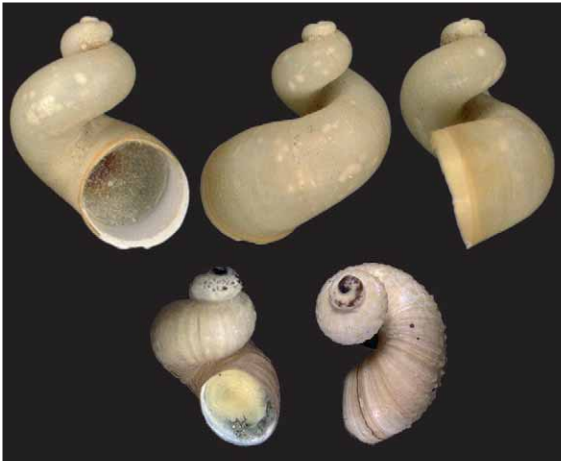
1 top left to right: Apertural, abapertural and lateral view of P. laevis ; bottom: another specimen.

Biology: Many specimens found in washings of tubes of Alvinella and siboglinids but both species seems to occur also on other substrates. Genus endemic to vents. Stomach contents indicate detritus feeding. Larval development lecithotrophic with planktonic dispersal stage.