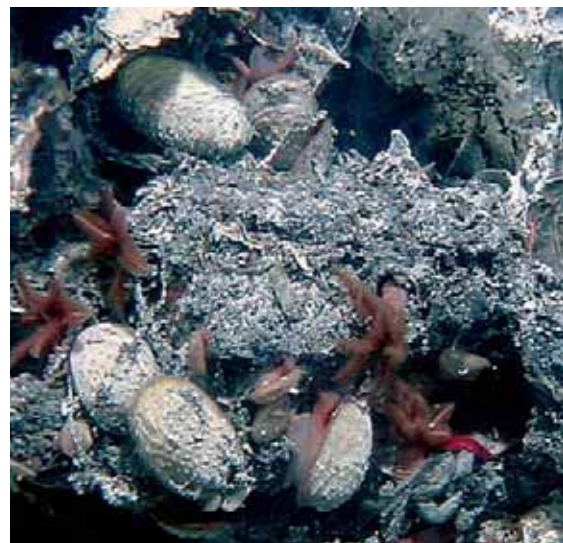
5: In situ Nodopelta sp. among alvinellid worms; East Pacific Rise: 13°N, Phare cruise © Ifremer.