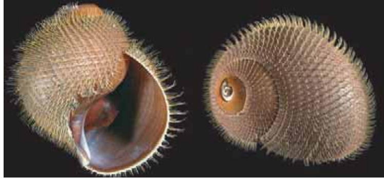
2: Dorsal and ventral view; by P. Briand © Ifremer.