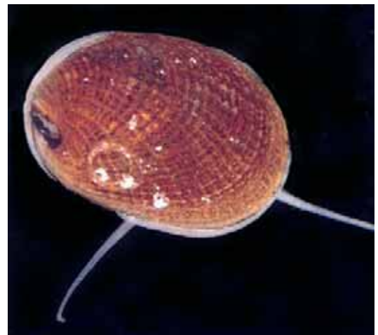
4: S. briandi : in situ