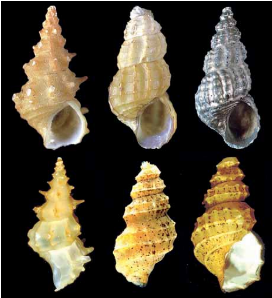
1 top row left: D. spinosa ; middle: D. melanioides ; right: D. cancellata, holotype coated for SEM; bottom row left: D. spinosa ; middle and right: D. provanna

Biology: Genus endemic in vents; detritus feeders; development unknown.