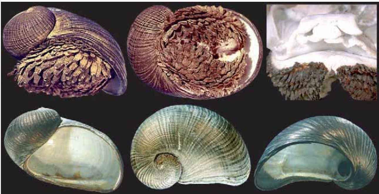
1 top from left to right: Complete specimen, lateral, ventral view, and front view of head-foot (shell and mantle removed); bottom from left to right: Shell, front, apical, and basal view. Maximum diameter of complete specimen 50 mm; by A. Warén.

Distribution: Indian Ocean: Rodriguez Triple Junction.