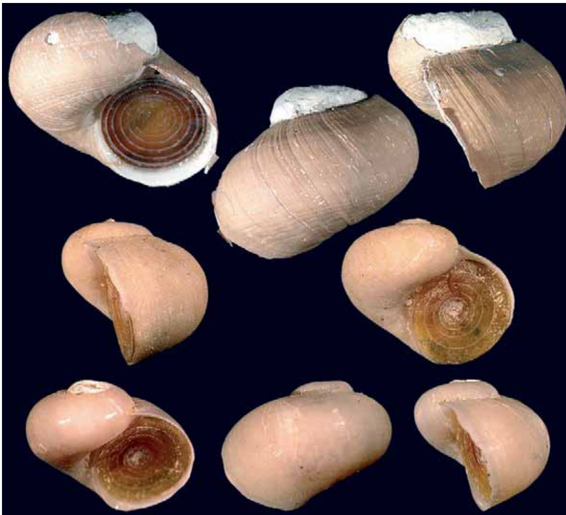
1: View of different sides of several specimens; by R. von Cosel.

Biology: Species of Fucaria occur only in seeps and vents. Food consists of the detritus layer on the bottom (stomach contents consist of mineral particles, sponge spicules and radiolarian fragments in a matrix of mucus and detritus). Larval development lecithotrophic with planktonic dispersal stage.