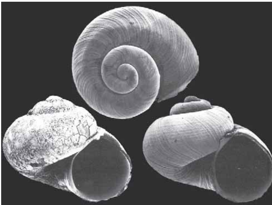
1: Holotype, 1.32 mm; top: apical view; bottom left: apertural view with periostracum and in-crustations; bottom right: same specimen, cleaned; cruise Biolau; after WARÉN & BOUCHET (1993).