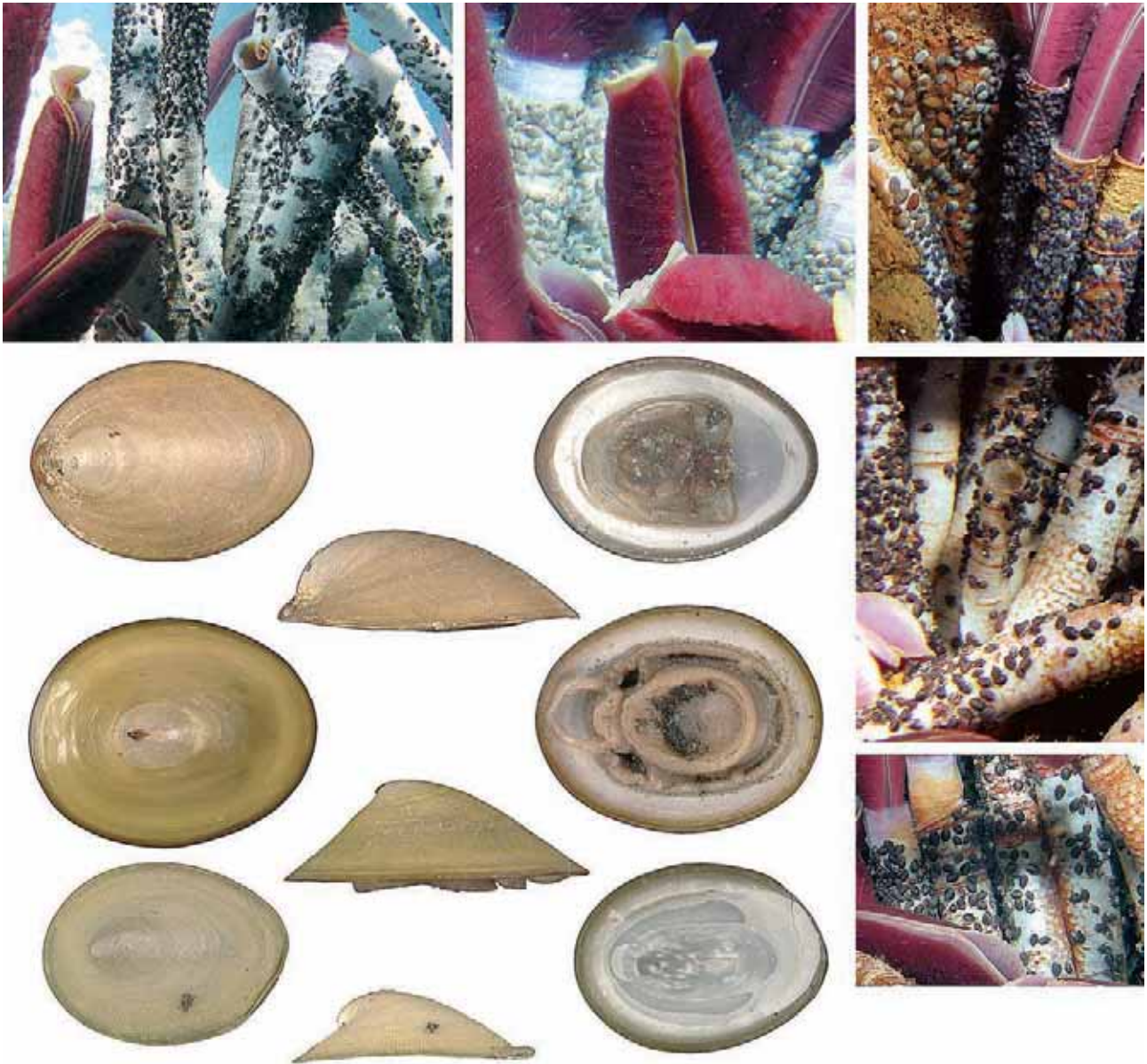
4 top: L. elevatus ; middle: L. ovalis ; bottom: L. pustulosus . All with exterior, interior and lateral view; by R. von Cosel & A. Le Goff; in situ views, limpets on tubes of Riftia pachyptila © Ifremer/Phare.