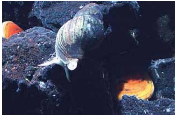
4: E. desbruyeresi in situ, among mytilid Bathymodiolus brevior from Lau Back-Arc Basin, cruise TUIM07; by courtesy of C.R. Fisher.