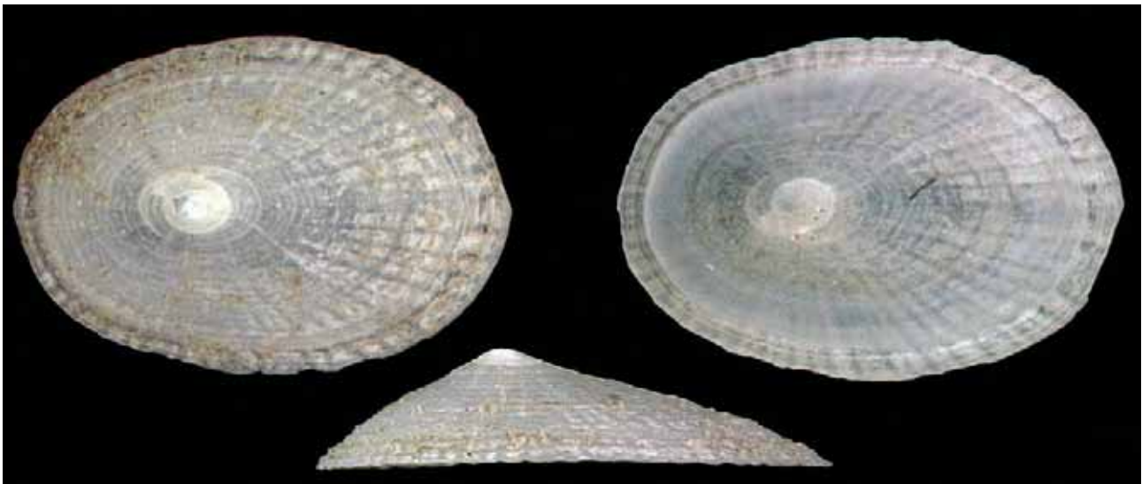
1: N. gordensis , exterior, interior and lateral views; by R. von Cosel & A. Le Goff.

Biology: Genus endemic to vents and seeps; some species have been collected on inactive chimneys devoid of other megafaunal species. Larval development lecithotrophic with planktonic dispersal stage. As in Paralepetopsis , species demarcation based on morphology is close to impossible since the species are feature-less, variable and often badly corroded (except N. densata ).