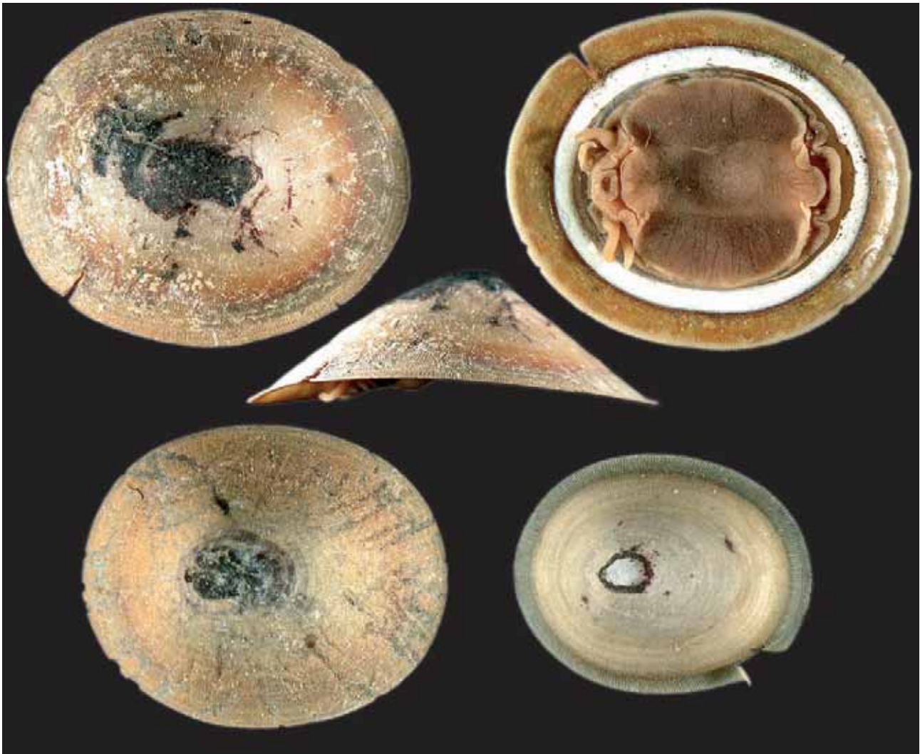
1: O. tollmanni ; top left, bottom right, bottom left: exterior view, top right: Interior view; middle lateral view; by R. von Cosel.

Biology: Genus endemic to vents. Feeds by grazing bacterial mats from surfaces of sulphide chimneys and of shells of bivalves and gastropods. The reddish colour of live animals is probably caused by hemoglobin. Larval development with planktotrophic larvae. Egg capsules, 1 mm diameter, deposited on shells of other molluscs, often in large numbers on Ifremeria .