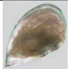
2: Larva; by courtesy of L. Mullineaux.