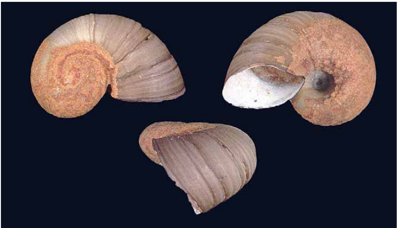
1 top left, right and bottom: Dorsal, ventral and apertural view of P. planispira

Biology: Found in washings of tubes of Alvinella and siboglinids. Genus endemic to vents. Stomach contained only undefined organic material. Larval development lecithotrophic with planktonic dispersal stage.