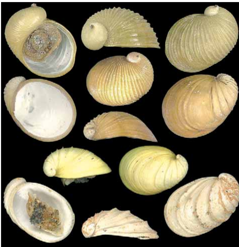
1 top: Four specimens of P. smaragdina ; by A. Le Goff © MNHN; middle: Five specimens of P. operculata ; from these the upper three specimens by A. Le Goff © MNHN and the lower two specimens with lateral and exterior view; by P. Briand © Ifremer; bottom: Three specimens of P. delicata , interior, lateral and exterior; by A. Le Goff © MNHN.

Biology: Specimens have been collected from washings of Alvinella and appear to be closely associated with active smokers. Genus endemic to vents. Larval development lecithotrophic with planktonic dispersal stage.