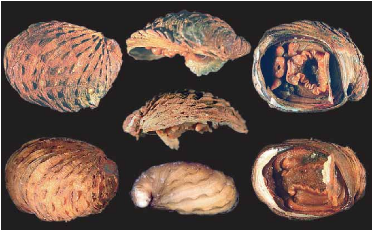
1: All specimens H. hirta

Biology: Genus endemic to vents. Gill and intestine morphology indicate that Hirtopelta uses the gill for chemosynthetic purposes. Larval development lecithotrophic with planktonic dispersal stage.