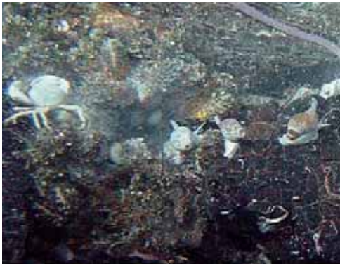
3: E. auzendei in situ, with bythograeid crab, chiridotid holothurian and serpulid worm Laminatubus alvini from southern East Pacific Rise, cruise Biospeedo.