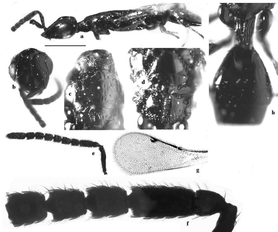
Fig. 1. Spalangia kocakeri nov.sp. Male. (a) body; (b) head in frontal view; (c) pronotum and mesoscutum; (d) Scutellum and propodeum; (e) antenna; (f) basal segments of flagellum with linear sensillae; (g) forewing; (h) petiole and metasoma. (Scale bar for a, c= 0.5 mm; for b= 0.35 mm; for d,h= 0.6 mm; for e= 0.94 mm; for f= 0.21 mm; for g= 0.44 mm).

Comments: Spalangia kocakeri nov.sp. is similar to Spalangia drosophilae ASHMEAD in having body (head slightly) strongly depressed, flattened, 2.0 mm in length; scutellum with cross-line indicated only by one or two punctures laterally. But the new species differs S. drosophilae in having male antenna with flagellum (antenna less scape) 0.54x as long as stretched head plus thorax (40:74), sparsely hairy, hairs about 1/3 width of segment in question; scape 1.2x as long as the globular pedicel plus F1, which is nearly 1.5x as long as the pedicel and about 1.9x as long as broad; the following segments almost equal in size, F2-F7 almost 1.13x as long as wide, and abdominal