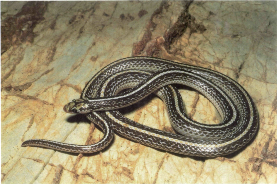
Fig. 1: Prosymna visseri FITZSIMONS, 1959 (CAS 214753) from near Sesfontein, Namibia illustrating the characteristic colour pattern and relatively large eyes of this species. Abb. 1: Prosymna visseri FITZSIMONS, 1959 (CAS 214753) aus der Umgebung von Sesfontein, Namibia. Man beachte die charakteristische Zeichnung und die verhältnismäßig großen Augen.