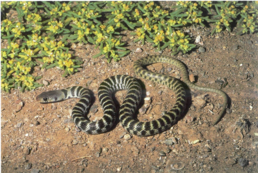
Fig. 2: Coluber zebrinus BROADLEY & SCHÄTTL, 2000 (CAS 214764) from 25 km north of Warmquelle, Namibia. Whole body view showing the characteristic barred pattern. Abb. 2: Coluber zebrinus BROADLEY & SCHÄTTL, 2000 (CAS 214764) von 25 km nördlich Warmquelle, Namibia Gesamtansicht mit den charakteristischen Querstreifen.