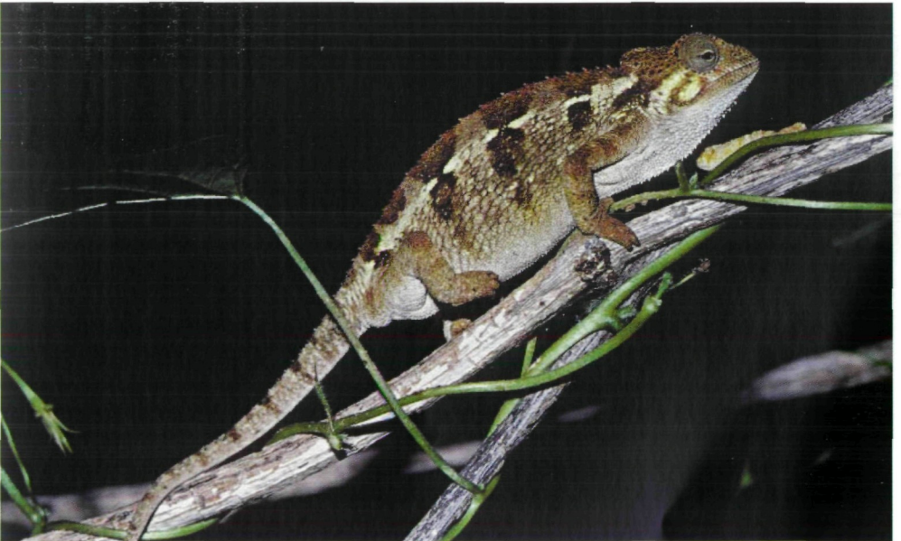
Fig. 4: Female of Chamaeleo ntunte sp. n. (paratype, ZFMK 74221) in its natural habitat. Abb. 4: Weibchen von Chamaeleo ntunte sp. n. (Paratypus, ZFMK 74221) im natürlichen Lebensraum.