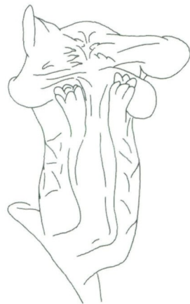
Fig. 2: Schematic drawing of the hemipenis of Chamaeleo ntunte sp. n. (ZFMK 73963). Drawing: Jan R. ŠLAPETA.

Sexual dimorphism is expressed by the above mentioned dichromatism, the presence of an almost homogeneous scalation in females and mainly by the thickened tail-base in males.