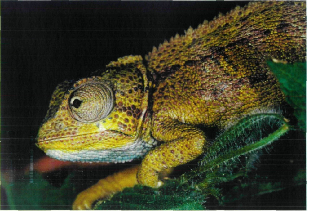
Fig. 3: Male of Chamaeleo ntunte sp. n. (holotype, ZFMK 73963). Abb. 3: Männchen von Chamaeleo ntunte sp. n. (Holotypus, ZFMK 73963).