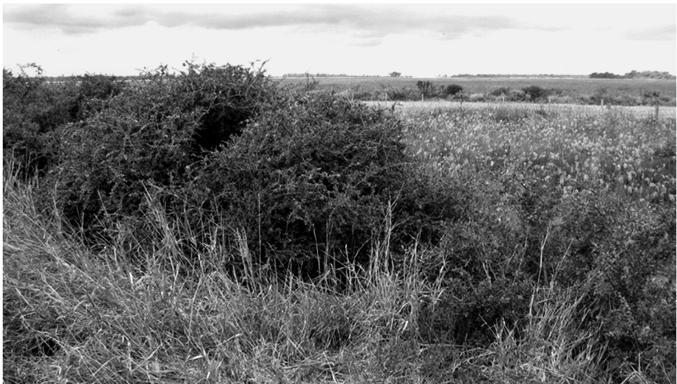
Fig. 1: Habitat at the new record locality of Teius suquiensis AVILA & MARTORI, 1991, in the Province of Santiago del Estero, Argentina.

Teius suquiensis AVILA & MARTORI, 1991, is a parthenogenic lizard present in contact zones of the parapatric sexual species Teius oculatus (D'ORBIGNY & BIBRON, 1837) and Teius teyou (DAUDIN, 1802) (AVILA 2002). This is a diurnal species that feeds on insects (AVILA et al. 1992). Of the two populations known, the southern is associated with the Espinal and Dry Chaco ecoregions, reaching elevations of 1,210 m a.s.l. in the "Sierras de Córdoba", in the Provinces of San Luis and Córdoba, whereas, the northern is present in the Dry and Humid