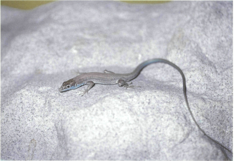
Fig. 2: Adult male of Lacerta cyanura from 20 km N of Dibba, Oman. - (Photo: R. LEPTIEN). Abb. 2: Adulte männliche Lacerta cyanura von 20 km nördlich Dibba, Oman. - (Photo: R. LEPTIEN).