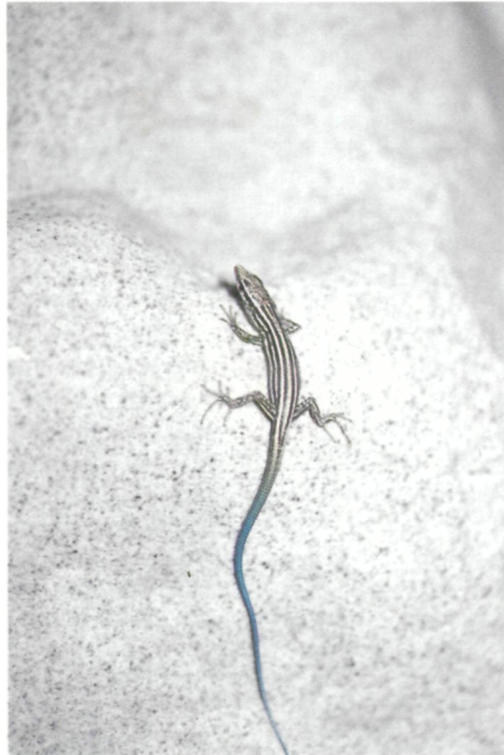
Fig. 3: Hatchling of Lacerta cyanura , one day old. - (Photo: R. LEPTIEN). Abb. 3: Frisch geschlüpfte Lacerta cyanura , einen Tag alt. - (Photo: R. LEPTIEN).