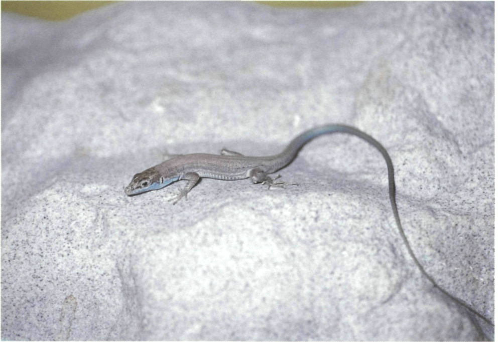
Fig. 2: Adult male of Lacerta cyanura from 20 km N of Dibba, Oman. - (Photo: R. LEPTIEN). Abb. 2: Adulte männliche Lacerta cyanura von 20 km nördlich Dibba, Oman. - (Photo: R. LEPTIEN).