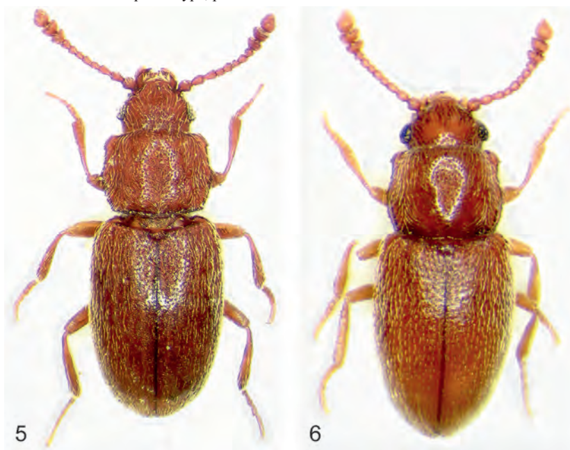
Fig. 5-6: (5) Cryptophagus redondoensis nov.sp. holotype, male; (6) Cryptophagus bussei ESSER, 2017