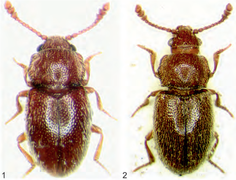
Fig. 1-2: (1) Cryptophagus jemezmontanus nov.sp. holotype, male; (2) Cryptophagus sanmateomontanus nov.sp. holotype, male.

Jens ESSER Fagottstraße 6 D-13127 Berlin, Germany E-mail: jens_esser@yahoo.de