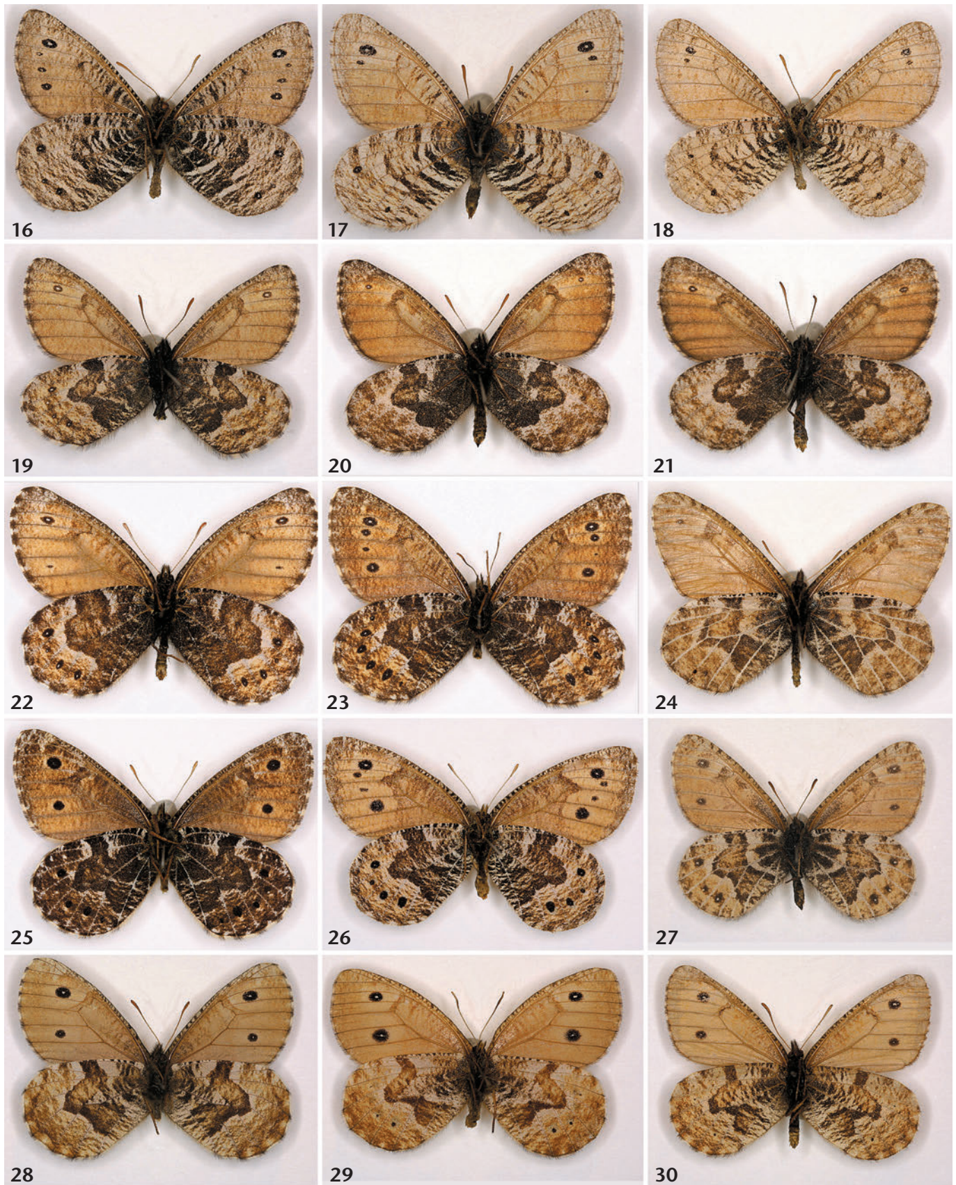
urda urda EVERSMANN, 1847. USSR, Primorje, Ussuri Region, Gornotajomnoje, 24. v. 1989. Fig. 15: Oeneis [urda ssp.] mongolica (OBERTHÜR, 1876). Mongolia, Central aimak Bogdo ul, Bugijn az schuj, 1650 m, Exp. Dr. Z. KASZAB, 1967.

Fig. 16: Oeneis uhleri uhleri , underside of Fig. 1. Fig. 17: Oeneis uhleri varuna , underside of Fig. 2. Fig. 18: Oeneis uhleri reinthali , underside of Fig. 3. Fig. 19: Oeneis nanna kluanensis ssp. n., holotypus ♂, underside of Fig. 4. Figs. 20–21: Oeneis nanna kluanensis ssp. n., paratypes ♂♂, undersides of Figs. 5–6. Fig. 22: Oeneis nanna jakutski , underside of Fig. 7. Fig. 23: Oeneis nanna jakutski , underside of Fig. 8. Fig. 24: Oeneis sculda vadimi , underside of Fig. 9. Figs. 25–26: Oeneis nanna nanna , undersides of Figs. 10–11. Fig. 27: Oeneis sculda sculda , underside of Fig. 12. Figs. 28–29: Oeneis urda urda , undersides of Fig. 13–14. Fig. 30: Oeneis [urda ssp.] mongolica , underside of Fig. 15.