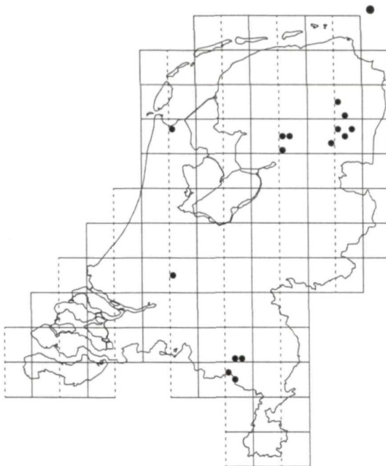
Fig. 2. Known distribution of Micarea subcinerea , based on grid squares of 5 x 5 km 2 . Large dot, the record from Germany.