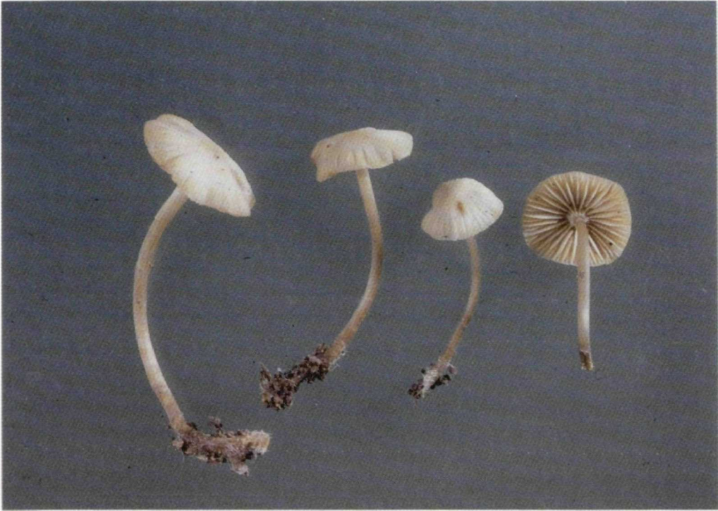
Fig. 2. Mycena dobraensis (holotype).

From outside of Europe the following taxa have to be compared: Mycena scotina MAAS GEEST. & DE MEIJER (MAAS GEESTERANUS & DE MEIJER 1997: 38) is a species in sect. Filipedes collected in Paraná (Brazil) with pilei up to 8 mm wide, not striate, white-pruinose, almost blackish brown, lamellae L = 12 , decurrent with small tooth, white with greyish tints, stipe 0.4 mm thick, for the most part greyish brown, grey-brown below, spores 5.4\text{--}5.6\ \mu\text{m} wide, basidia 2-spored, cheilocystidia 15\text{--}45 \times 9\text{--}27\ \mu\text{m} , pleurocystidia absent, hyphae of the pileipellis 7\text{--}11.5\ \mu\text{m} wide and growth single on rotten logs of dicyledoneous trees, altogether characters very different from M. dobraensis .