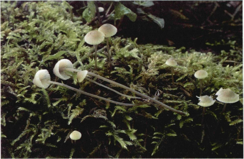
Fig. 2. Mycena truncimuscicola , habitus.