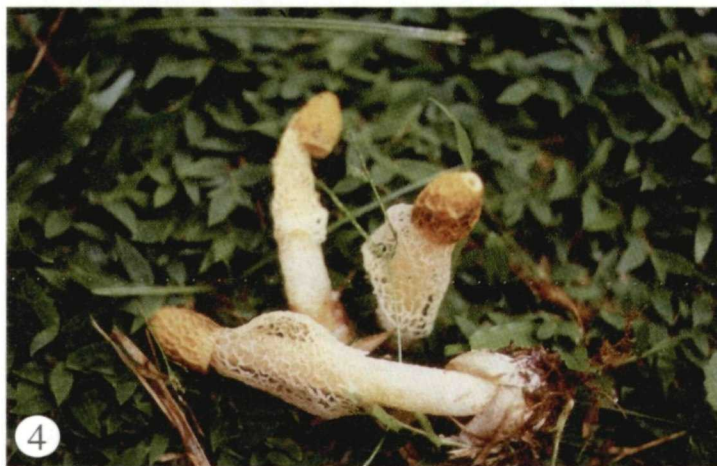
Fig. 2. Aseroë rubra (WU 28483). – Fig. 3. Calvatia gardneri (WU 28470). – Fig. 4. Phallus flavidus (WU 29607, holotype). – Phot. I. HAUSKNECHT.