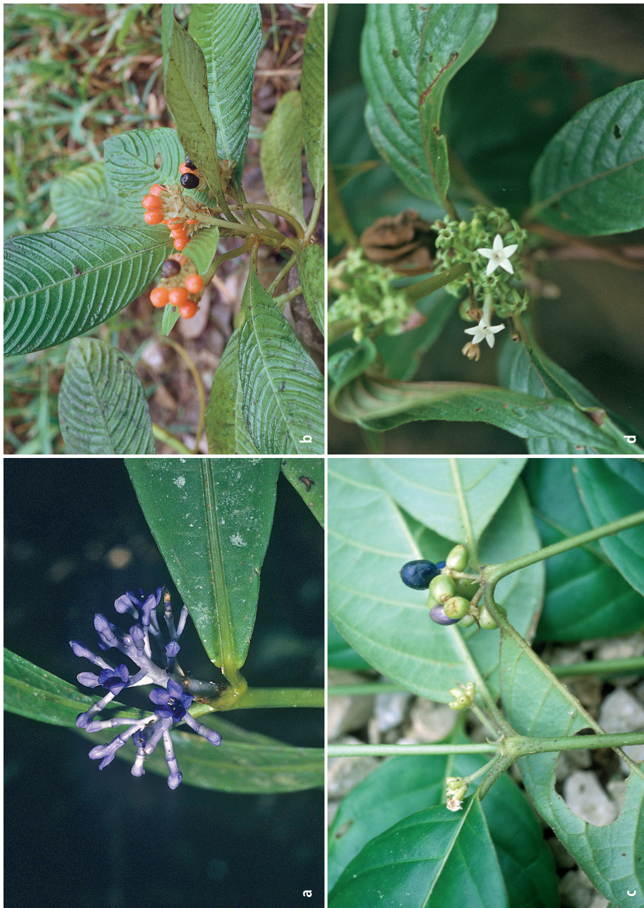
Plate 2: (a) Faramea suerrensis , (b) Notopleura polyphlebia (syn. Psychotria polyphlebia ), (c) Ronabea latifolia (syn. Psychotria erecta ), (d) Sabicea panamensis