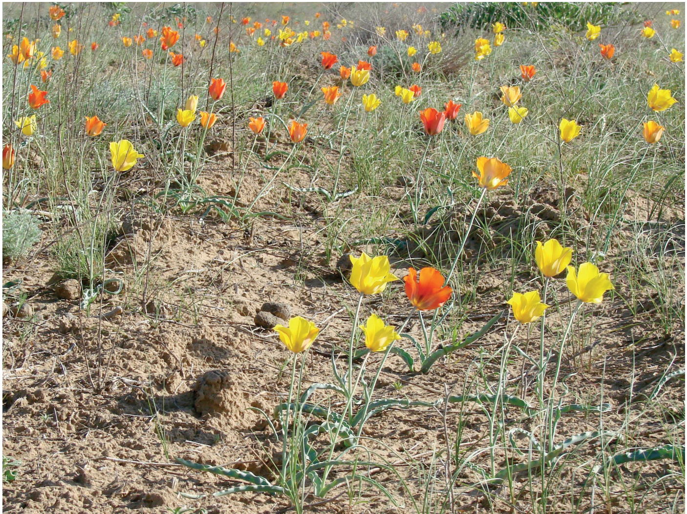
Fig. 1: Large population of Tulipa lehmanniana in South-Eastern Kyzylkum.

This species is widespread on all ridges of the Nuratau mountains, from eastern to western extreme end. It grows as solitary specimens, small groups or large populations (up to several hundred plants), at 800-900 m a.s.l. to 1800-2000 m a.s.l., among forb-tall grass, sagebrush-herbaceous communities, semishrubs and shrubs, particularly on relatively humid northern and western slopes. The largest populations registered on the Nuratau ridge, where Tulipa affinis occurs quite often (Fig. 4). The number of generative specimens in local populations vary from 4-5 to 70-80, 100 or more per 100 m 2 . In some areas on the watershed of Nuratau, blooming tulips makes the landscape bright red, there are up to 4-5 generative specimens per 1 m 2 .