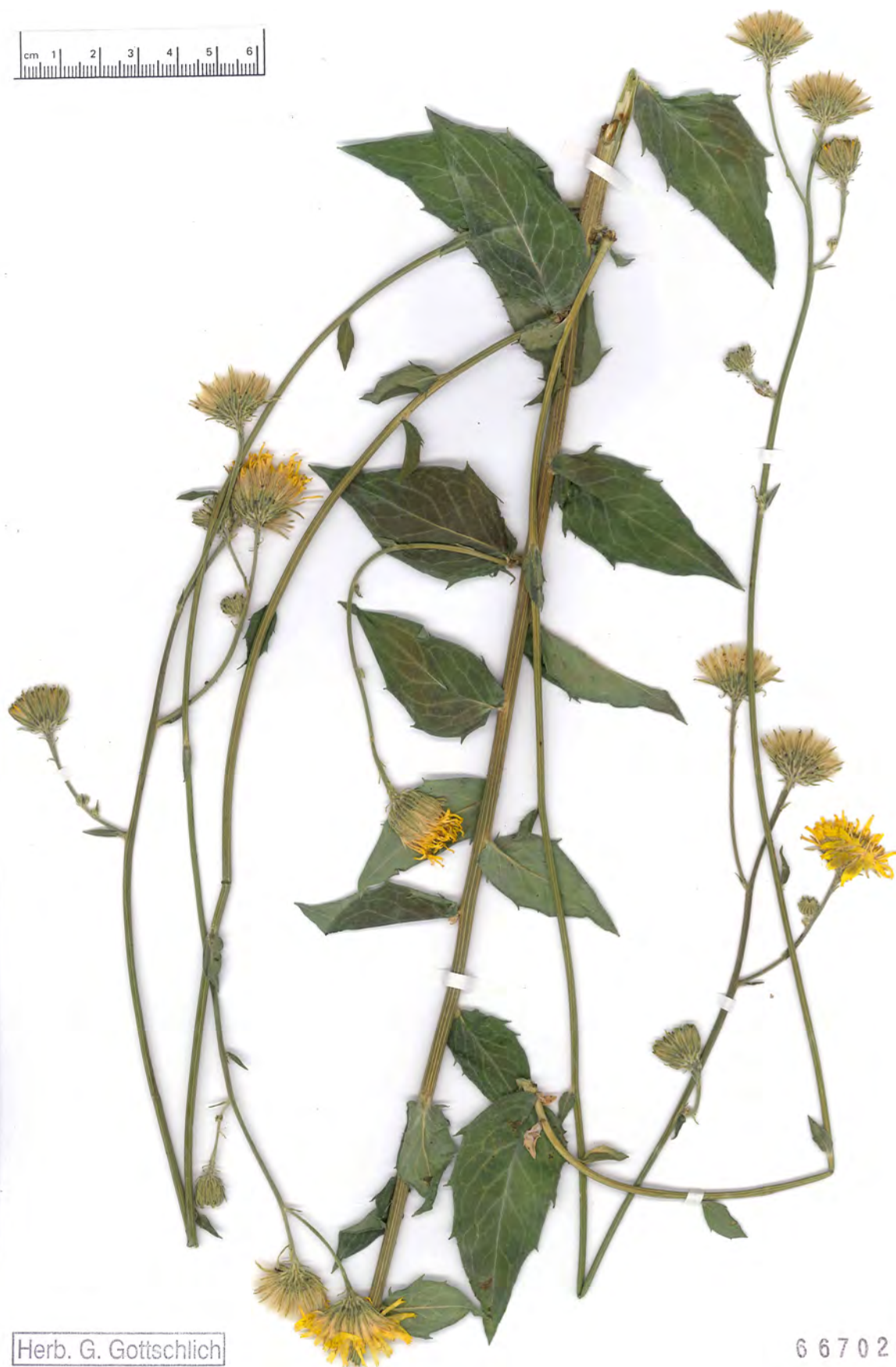
Fig. 4b: Hieracium sabaudolypticum GOTTSCHL. & DUNKEL, middle part of the stem.